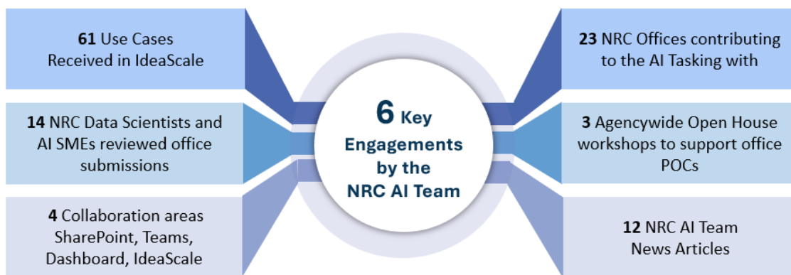
Figure 1: Summary of outreach and educational activities for NRC staff.

Figure 1 summarizes the NRC AI Team’s outreach and education activities. Through this collaborative approach, the 23 offices developed 61 potential use cases. The staff’s successful engagement provided an initial collection of ideas that begins to explore what might be possible using AI. Enclosure 2 (nonpublic) provides information from an internal dashboard of all the recommended use cases. As the agency begins implementing the use cases, the NRC will, consistent with Federal law, 14 prepare and share an inventory of AI use cases with other Government agencies and the public.