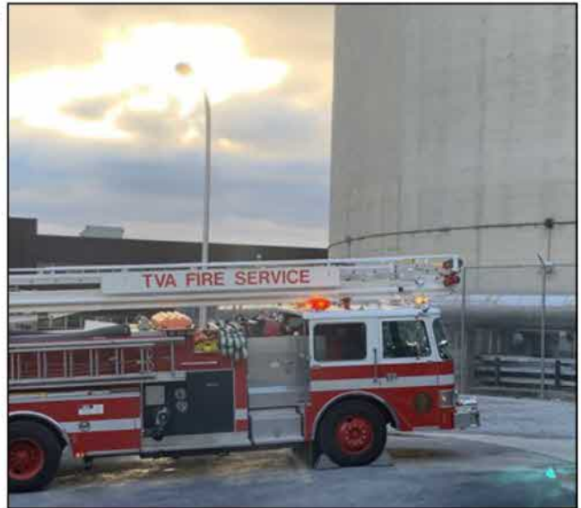
TVA Fire Service and SQN Fire Ops personnel responding to the NOUE at SQN today, after light smoke was reported inside the Unit 2 Containment Building. Plant personnel are safe, with no reports of damage to any equipment.

Please refer any media inquiries on this event to our TVA media team at 865-632-6000 or tvainfo@tva.gov .