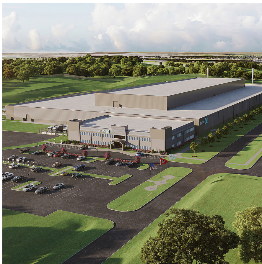
Video: TRISO-X Fuel Fabrication Facility

"Today's groundbreaking by X-energy is further proof that Oak Ridge is the center of America's revived domestic nuclear energy industry. I am proud that X-energy has chosen Oak Ridge to build its new TRISO manufacturing facility and invest in Oak Ridge's outstanding workforce," added U.S. Representative Chuck Fleischmann.