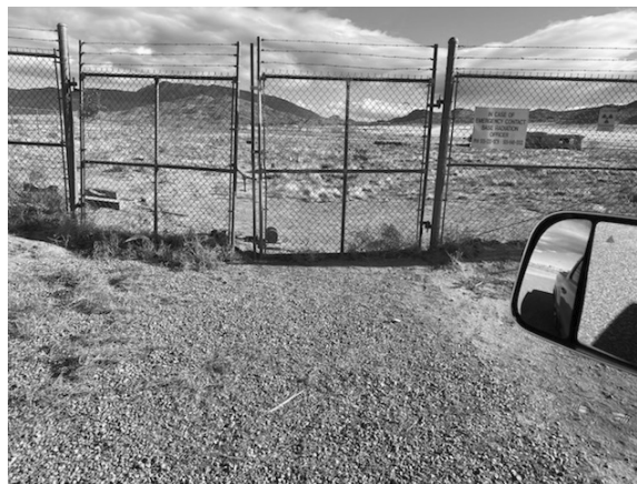
Figure 1: Training Site 3 Fence (Pre- Corrective Action)