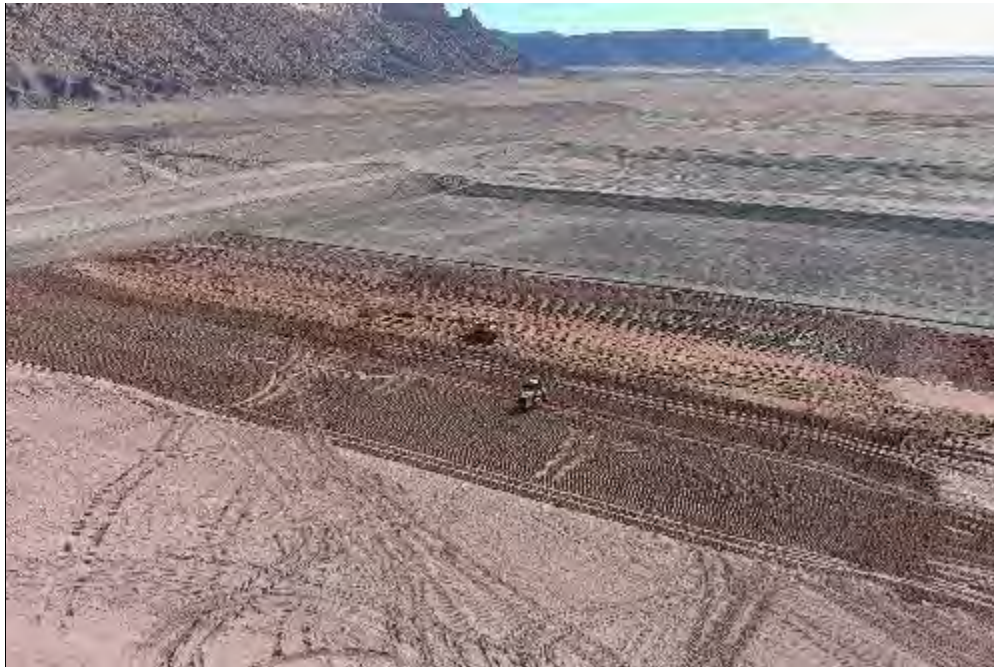
Photo 45. Aerial Photo of RRM being Placed May 2021