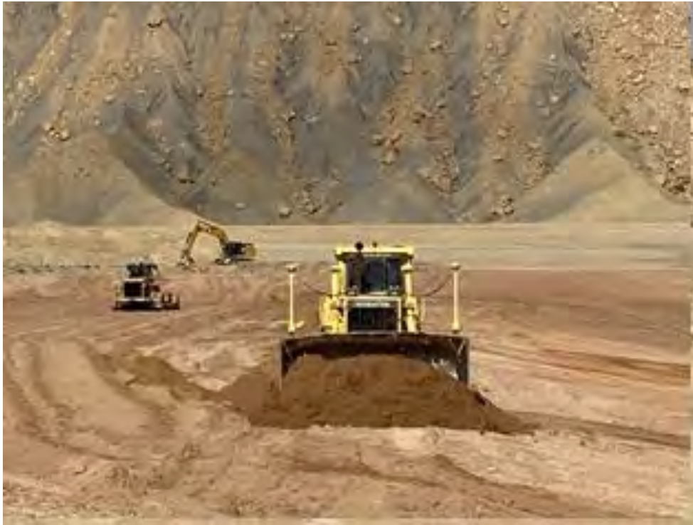
Photo 33. Cell Operations February 2021