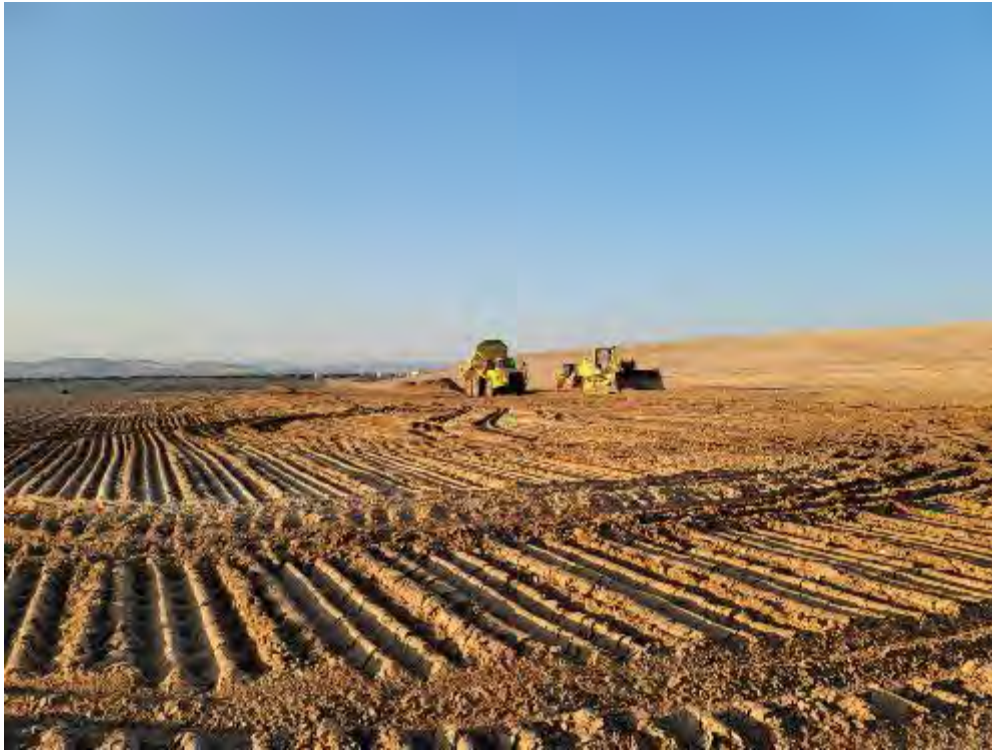
Photo 63. Pushing and Dumping RRM September 2021