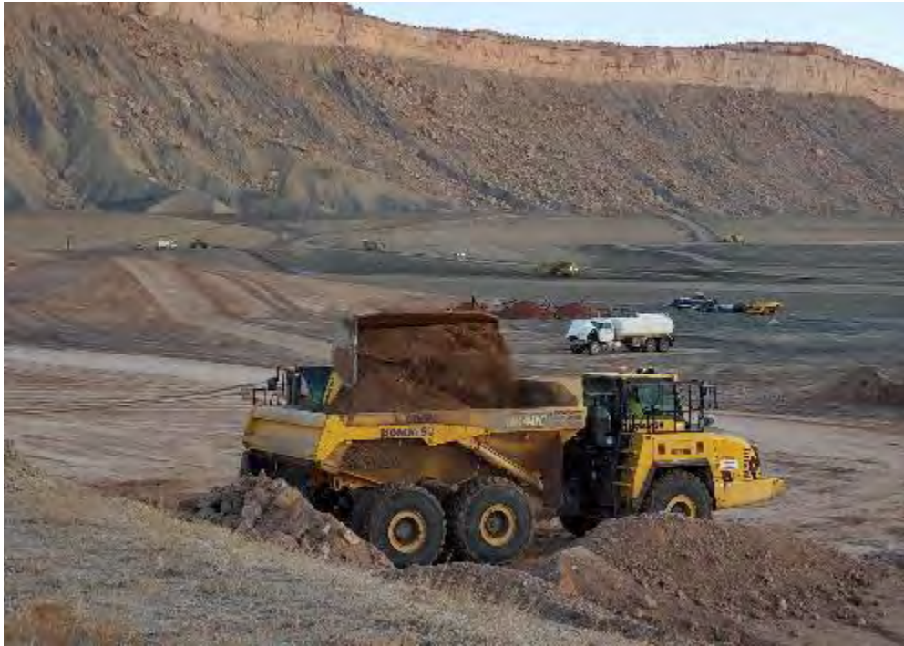
Photo 26. Loading RRM December 2020