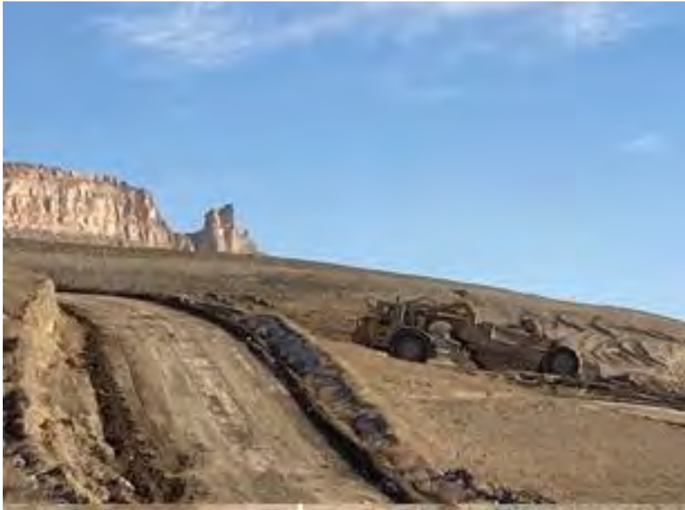
Photo 79. Transporting Material to Spoils Embankment January 2021