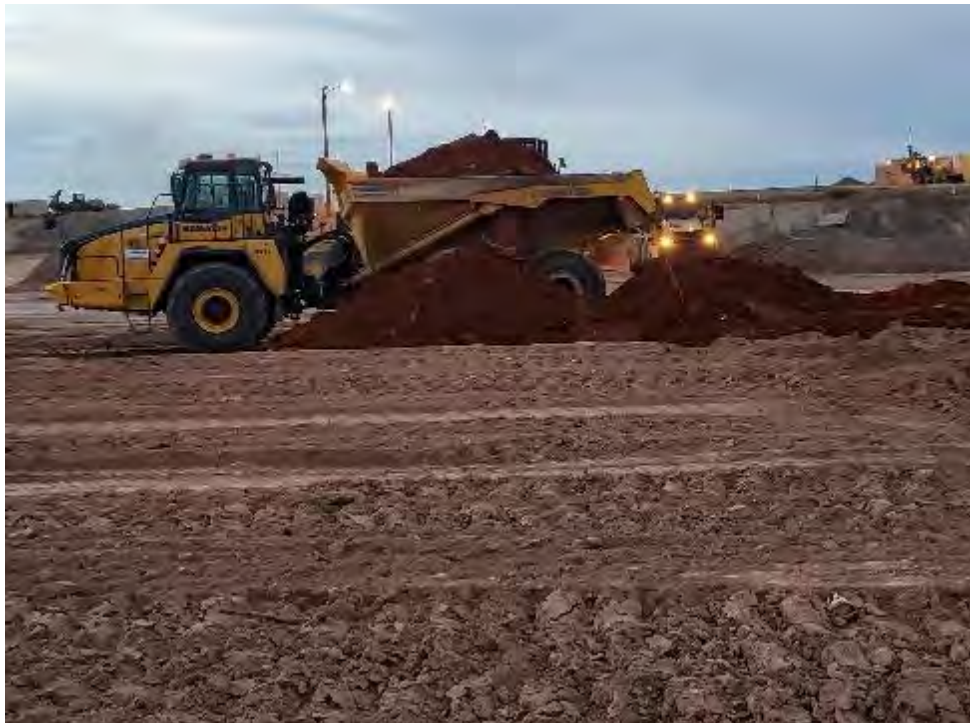
Photo 28. RRM Debris Lift December 2020