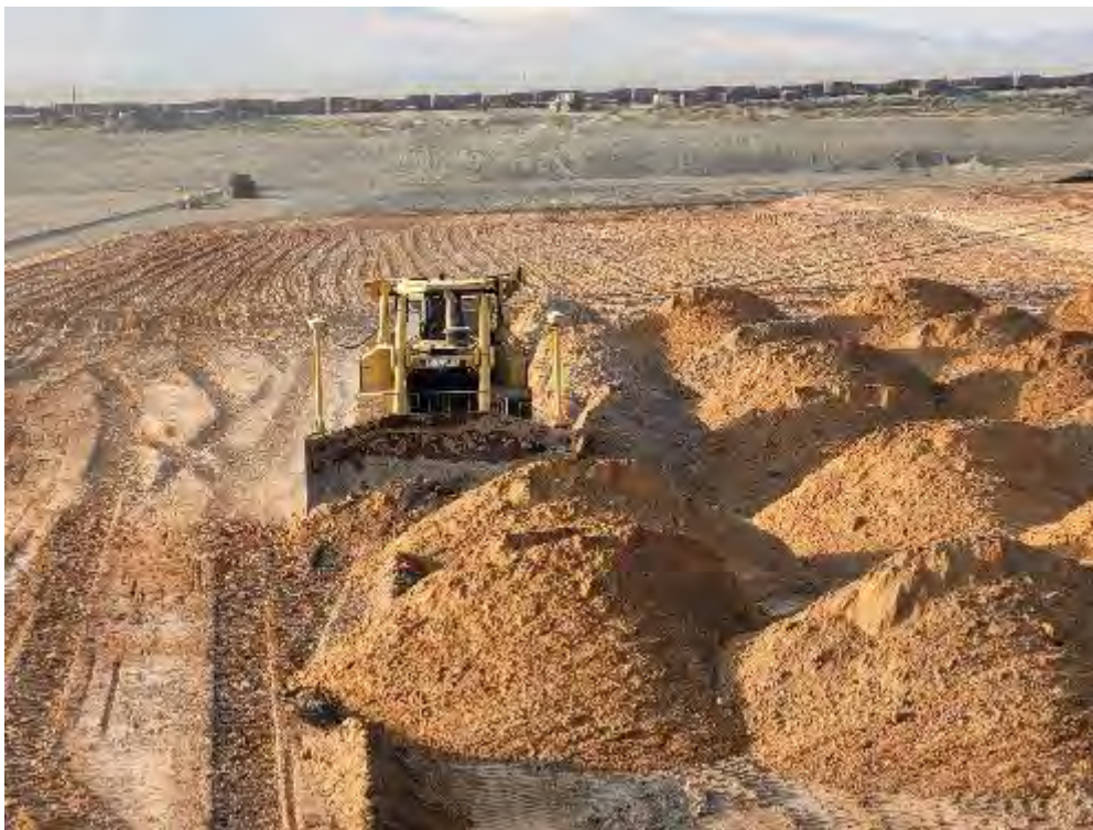
Photo 64. Pushing RRM September 2021