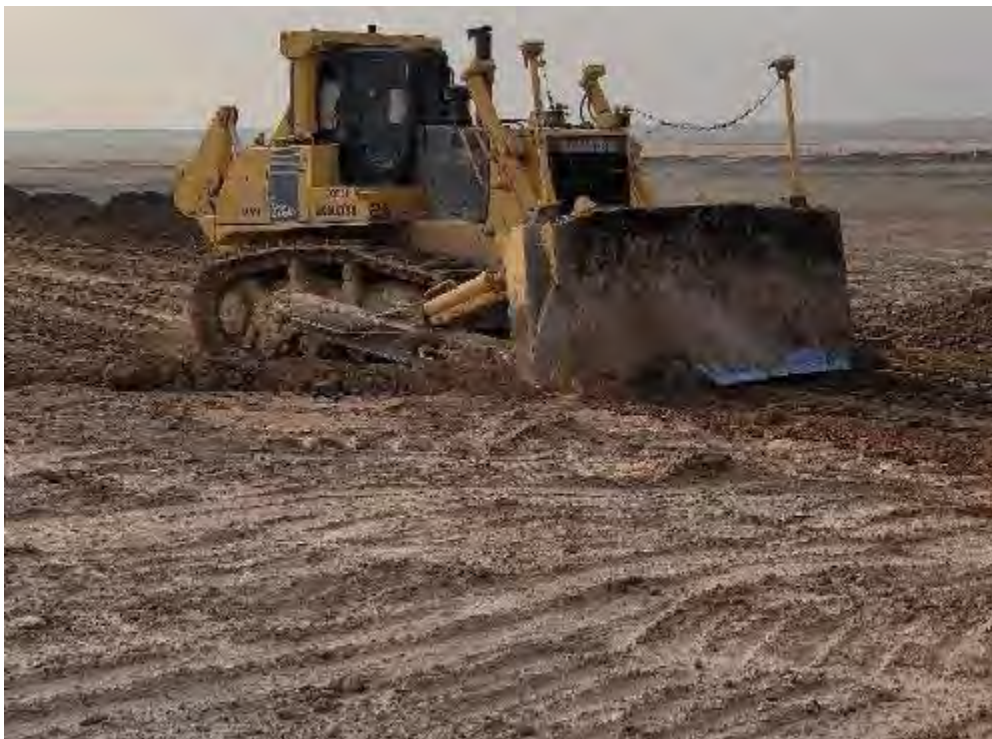
Photo 56. Dozer used for RRM Lifts July 2021