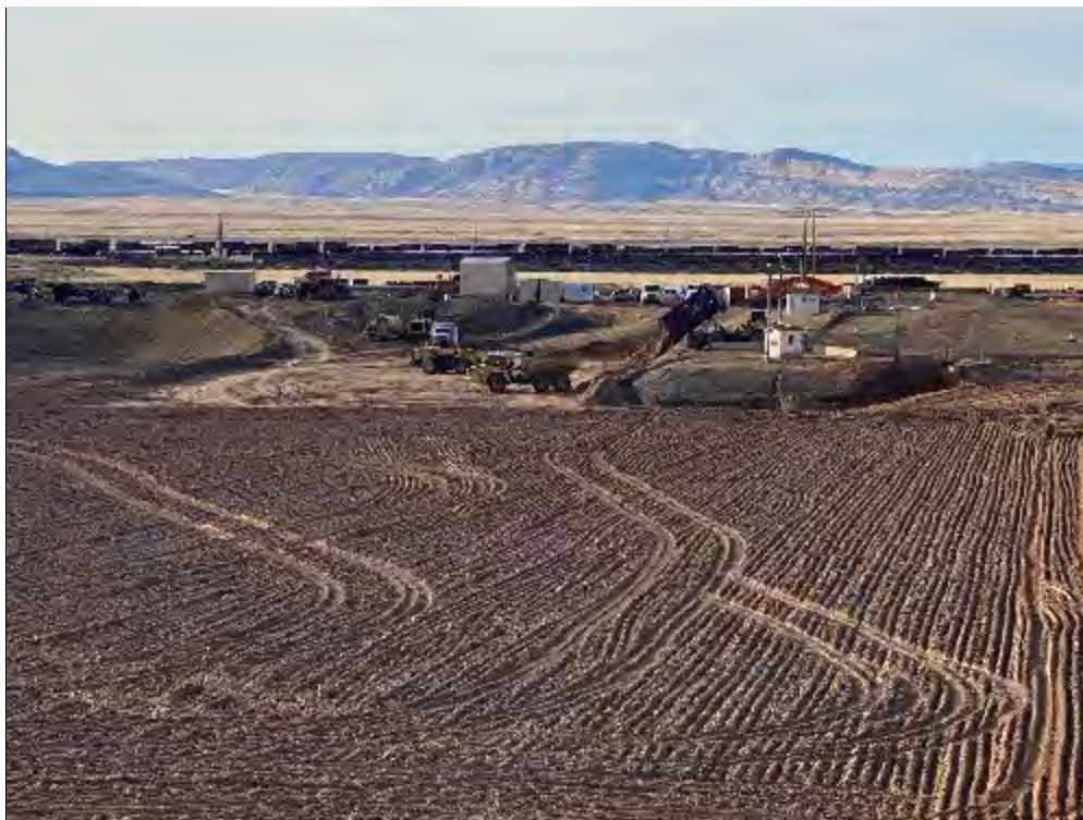
Photo 40. RRM Lifts March 2021