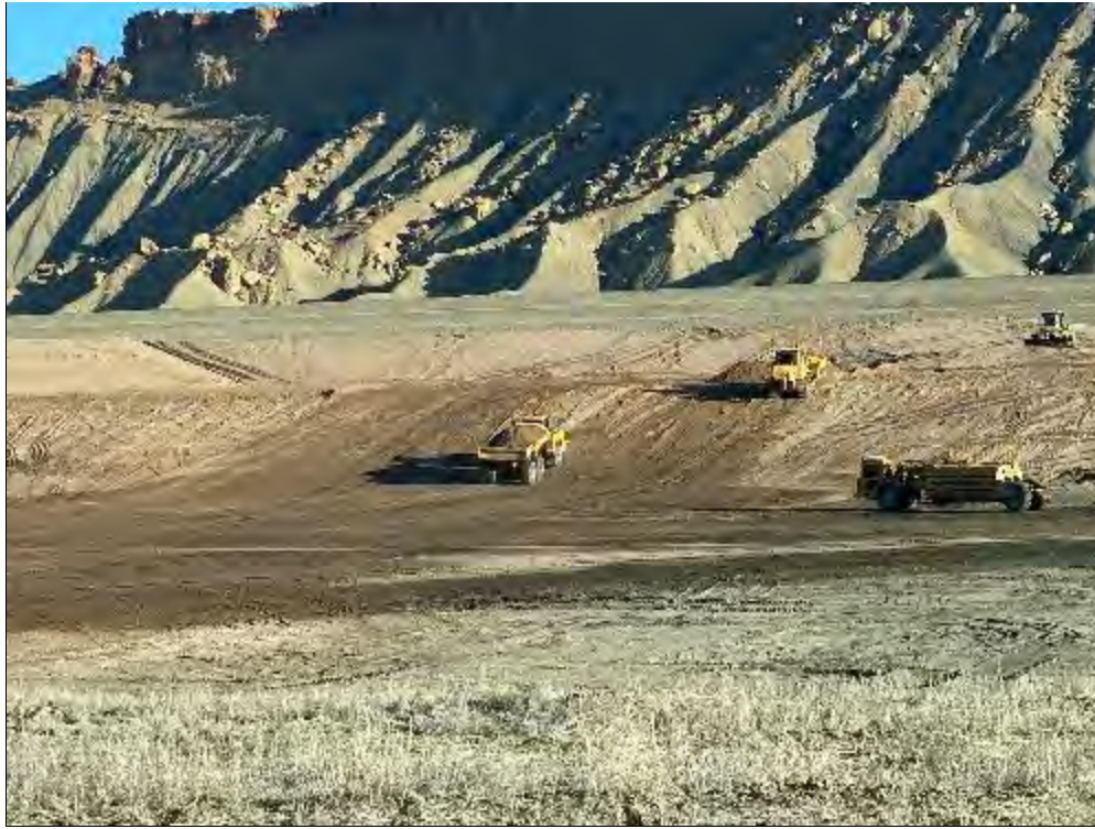
Photo 41. Hauling RRM for Placement April 2021