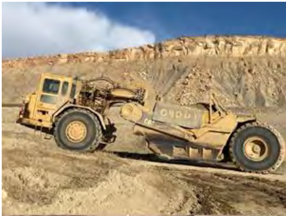
Photo 80. Scraper Hauling Spoils Embankment Material January 2021