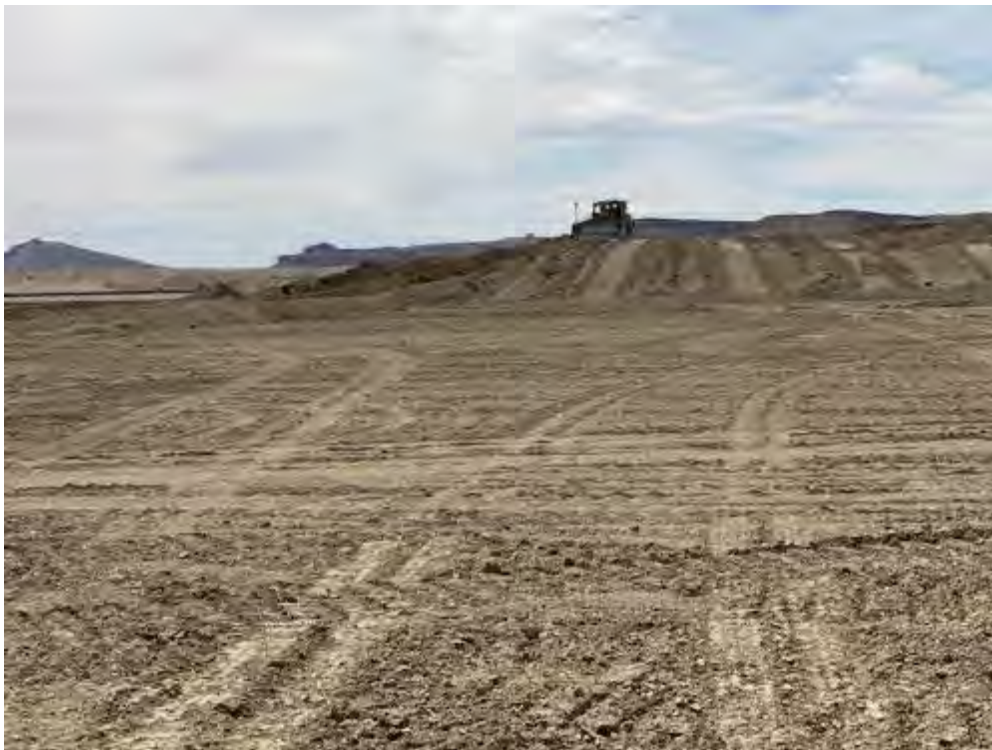
Photo 72. North Side Interim June 2021