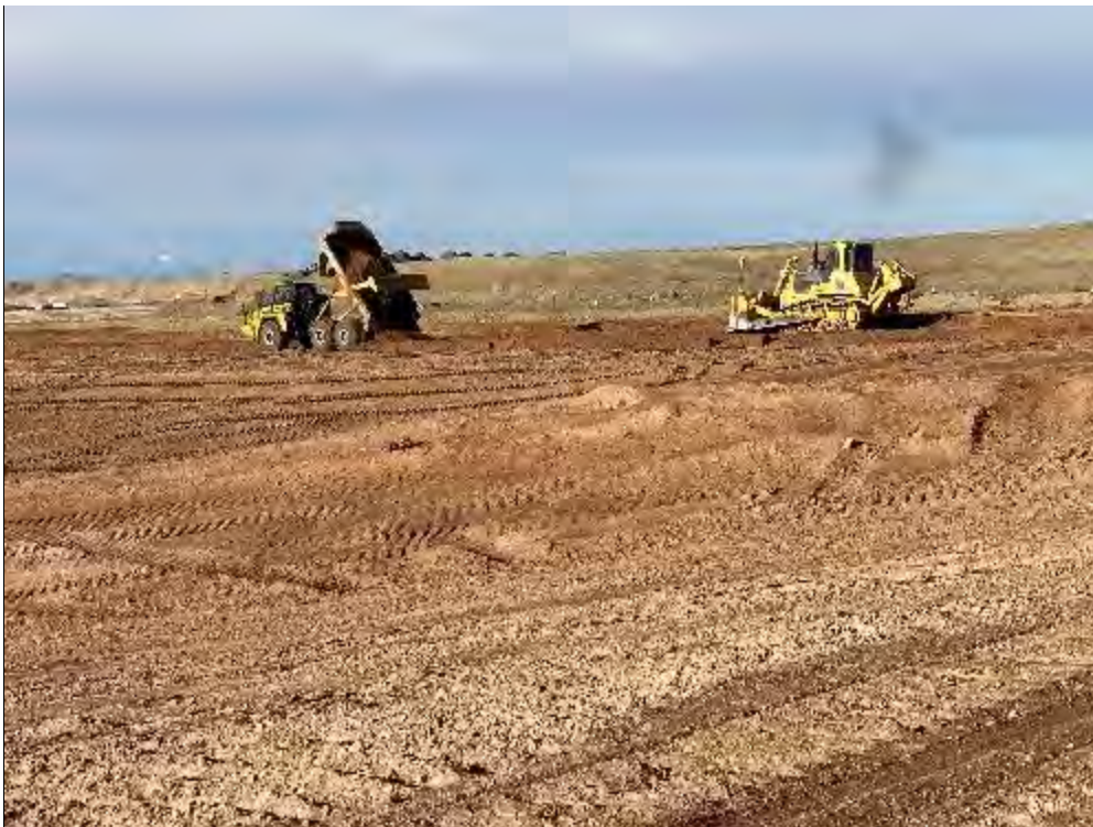
Photo 38. Debris Being Covered March 2021