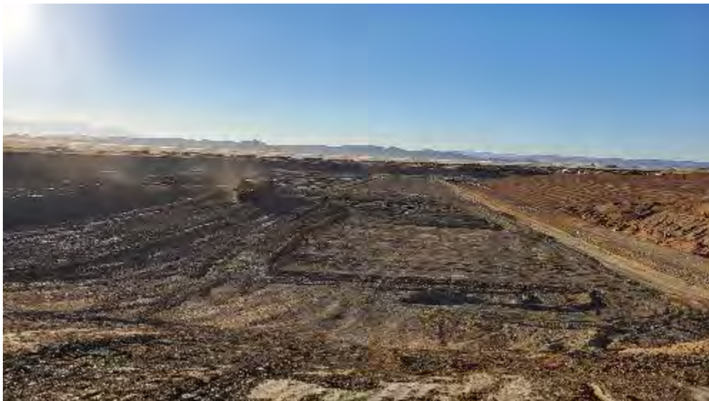
Photo 12. Cell Excavation December 2020