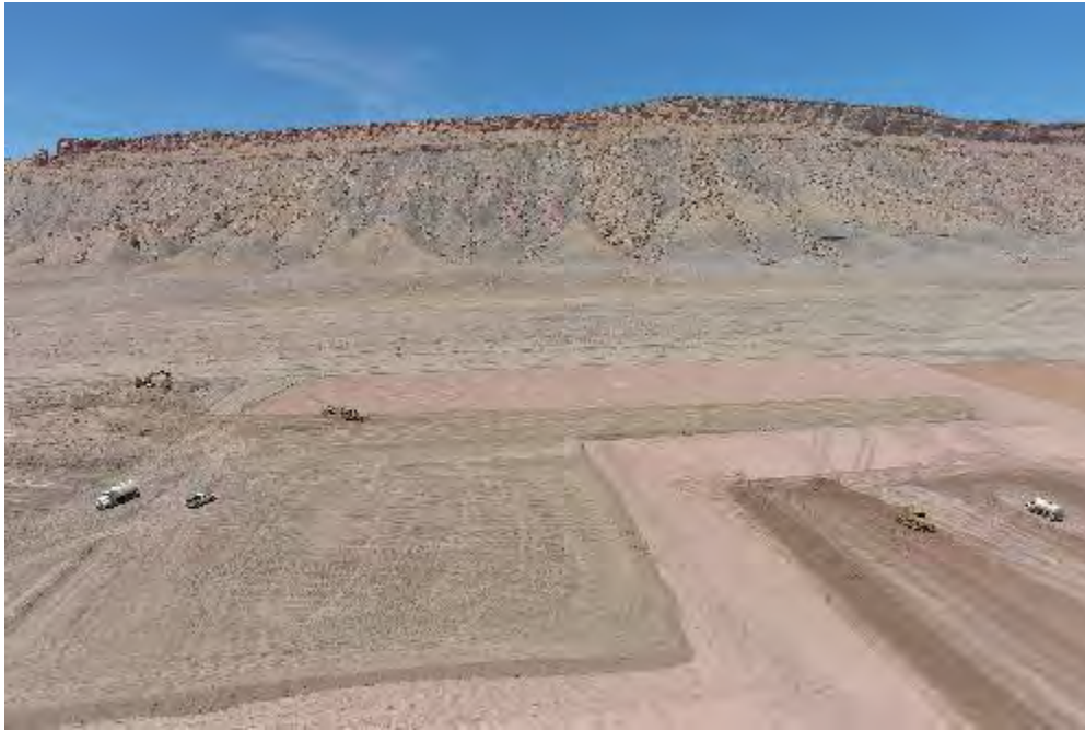
Photo 65. Aerial of Ongoing Interim May 2021