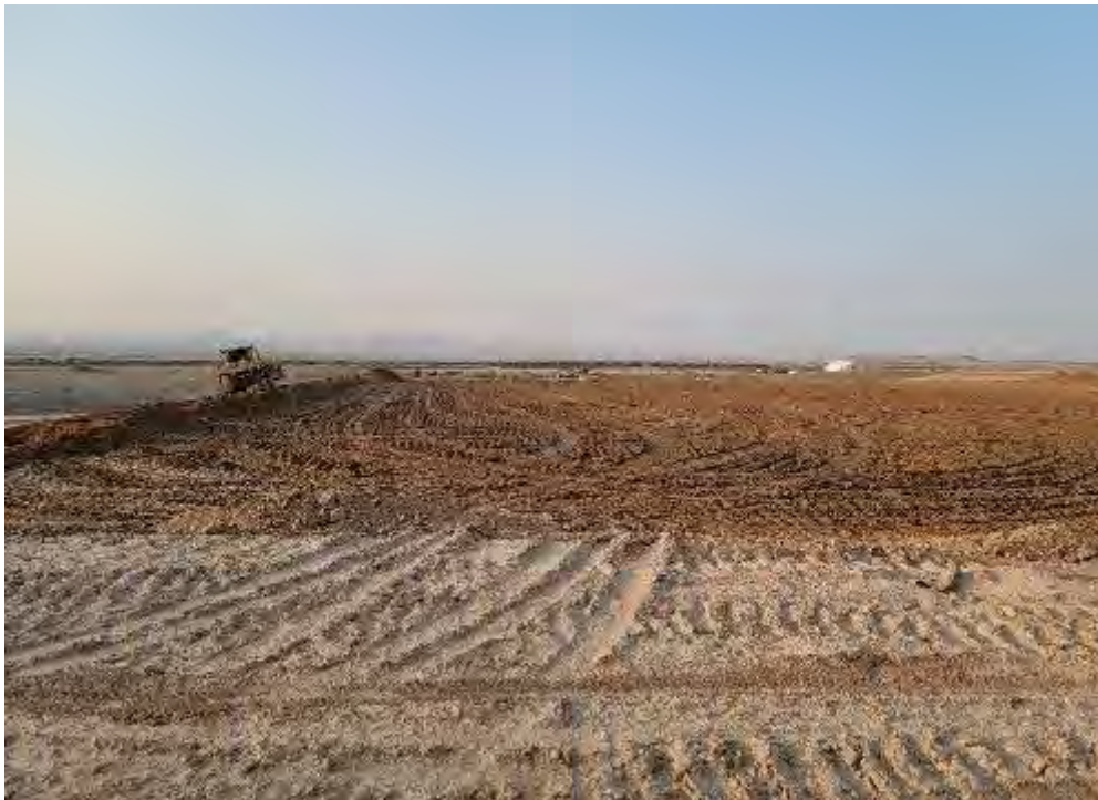
Photo 60. Looking South at the Disposal Cell August 2021