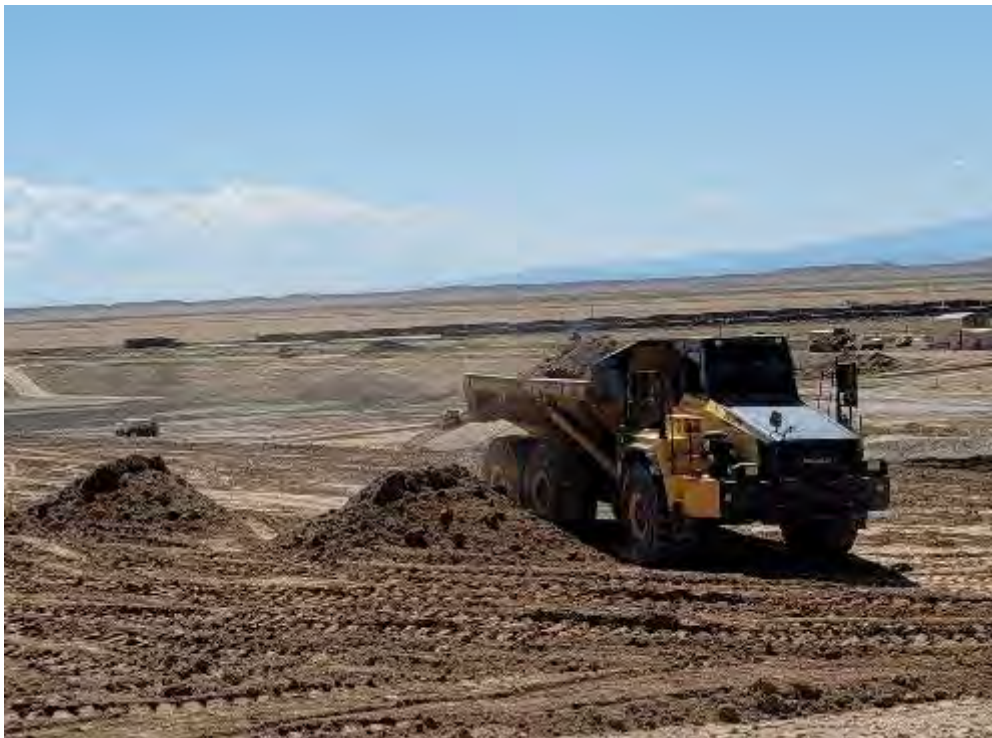
Photo 54. Hauling RRM for Placement July 2021