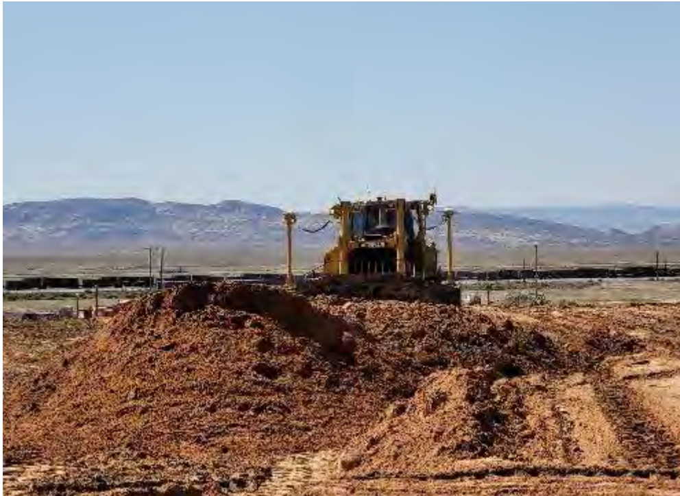
Photo 59. Dozer Pushing Material on RRM Lift August 2021