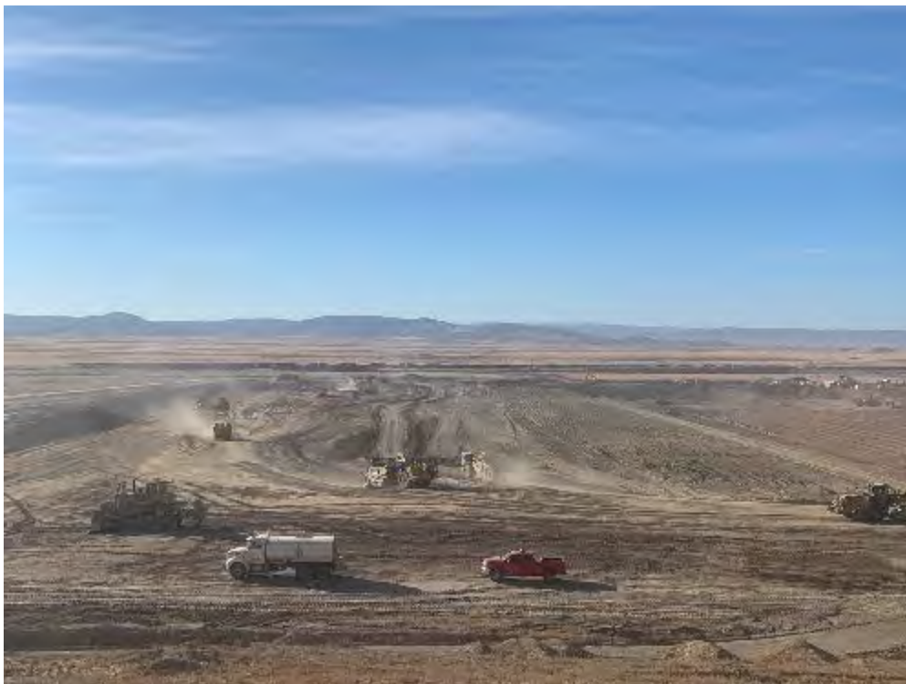
Photo 2. Phase 3 Cell Excavation October 2020