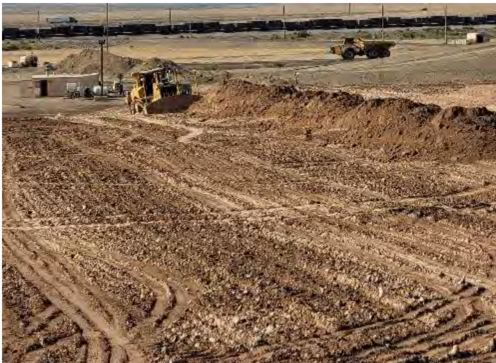
Photo 50. Dozer Placing RRM on Active Lift Area June 2021