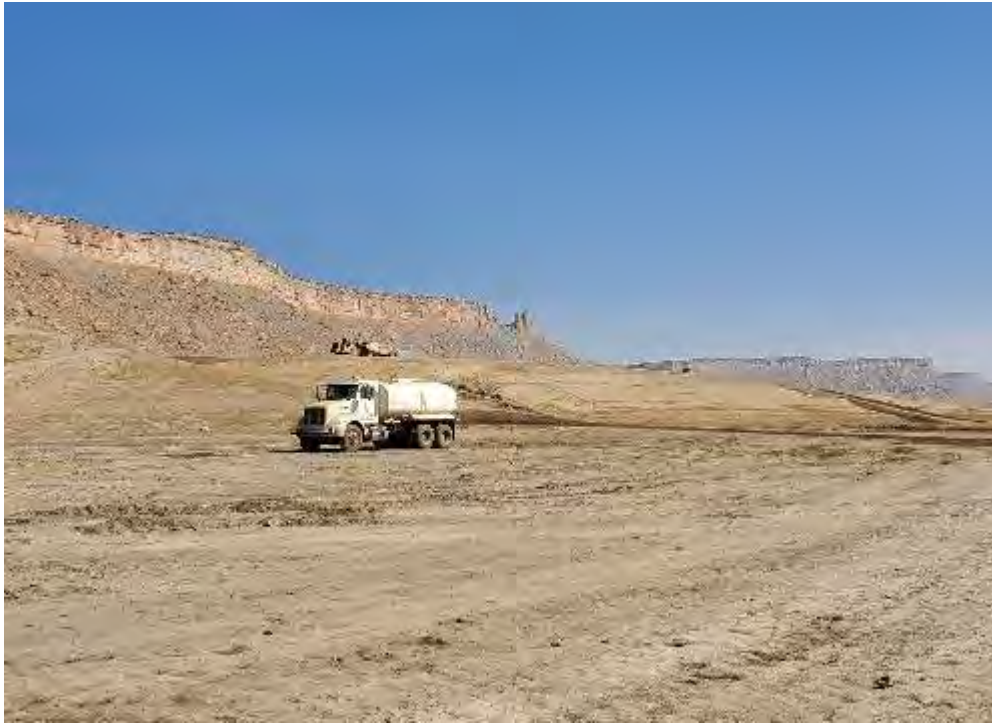
Photo 75. Spoils Embankment Construction October 2020