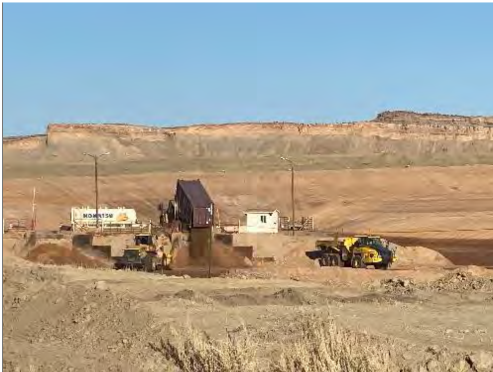
Photo 42. RRM Loadout April 2021