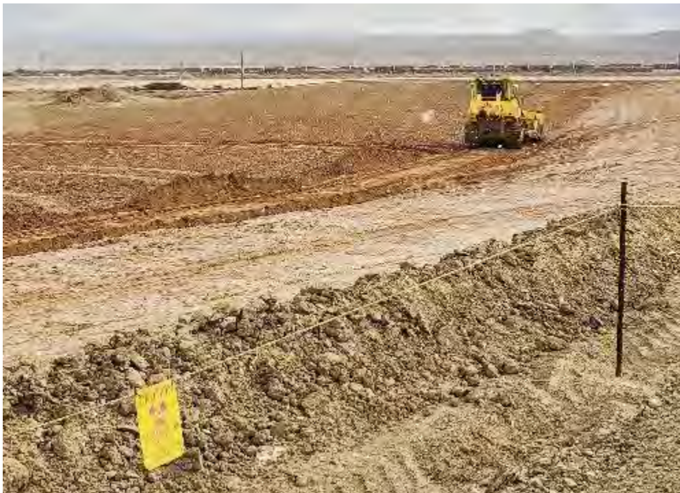
Photo 34. Pushing Soils While Snowing February 2021