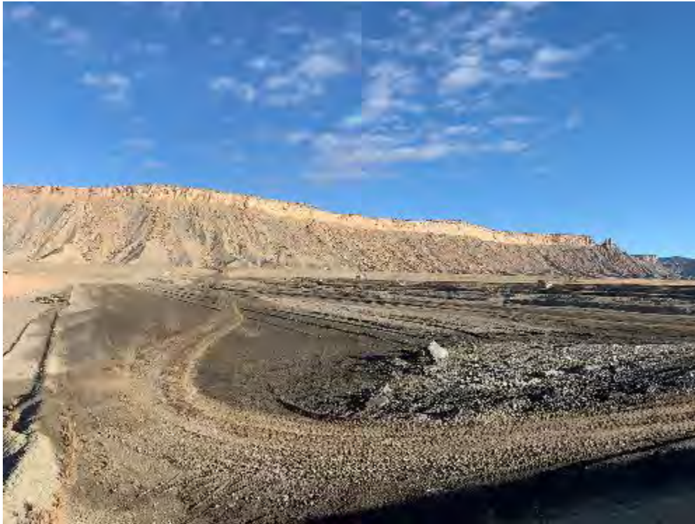
Photo 7. Cell Excavation November 2020