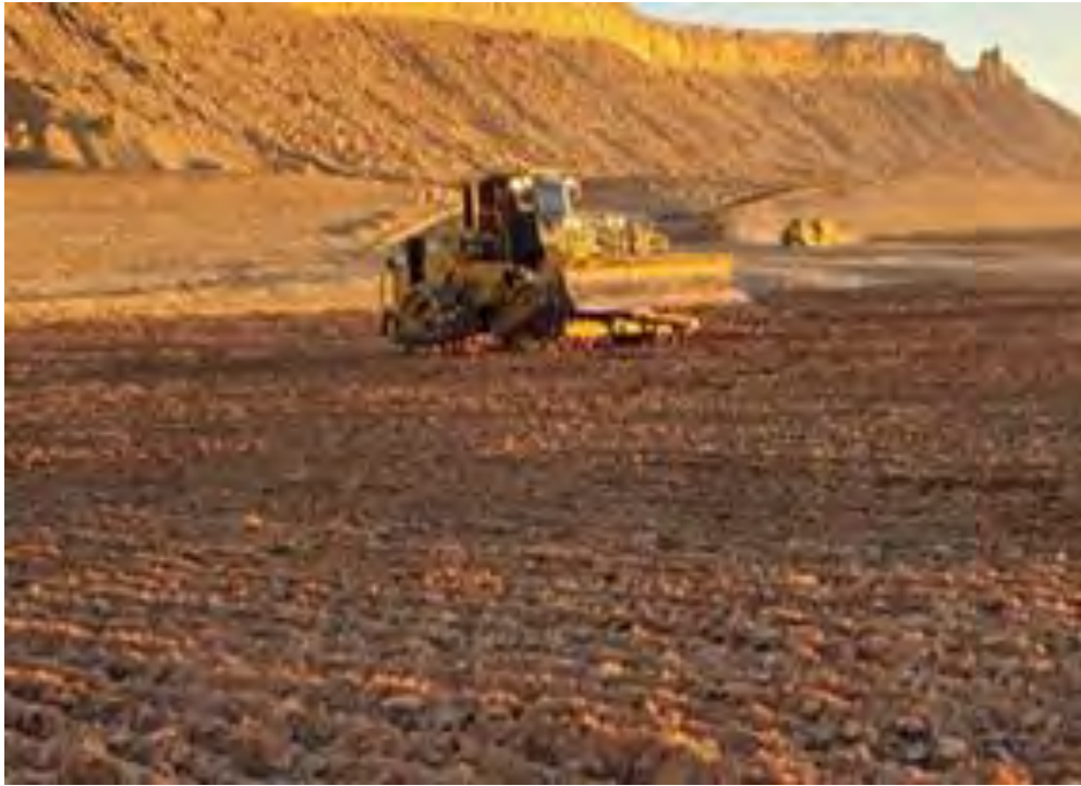
Photo 24. RRM Compaction December 2020