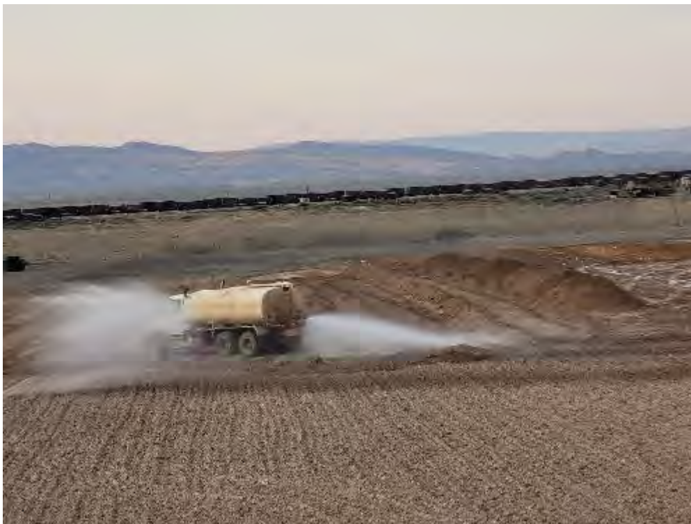
Photo 62. Dust Suppression and Moisture Conditioning September 2021