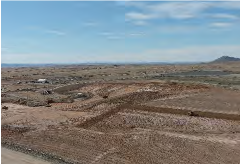
Photo 37. Aerial Picture of Disposal Cell March 2021