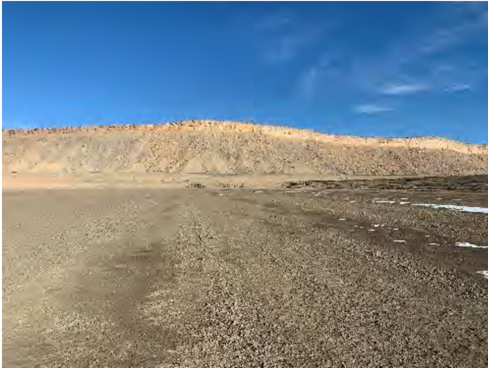
Photo 11. Cell Excavation December 2020