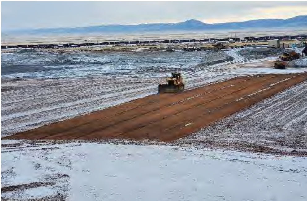
Photo 31. Snow and Frost Removal January 2021