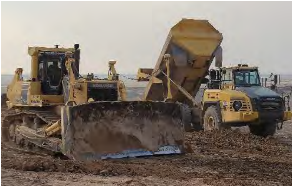
Photo 55. Equipment Preparing RRM Lift July 2021