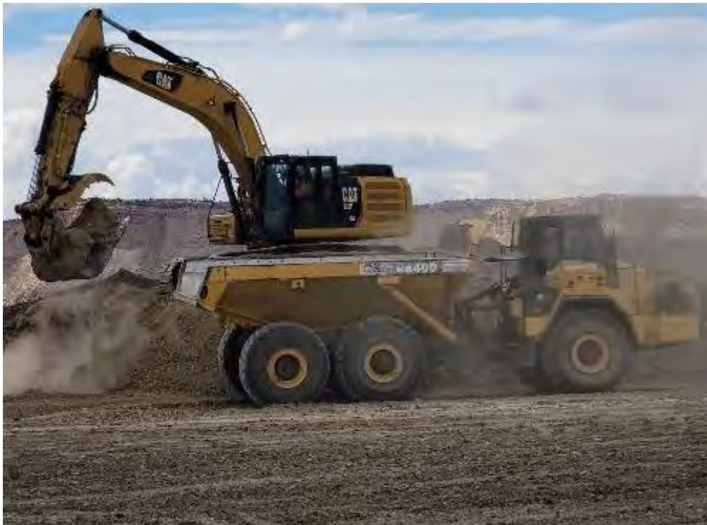
Photo 70. Interim Protective Cover Haul June 2021