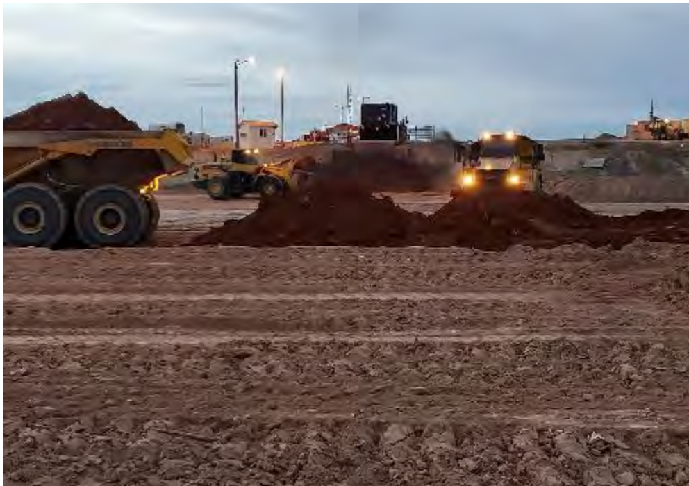
Photo 29. Material being placed December 2020