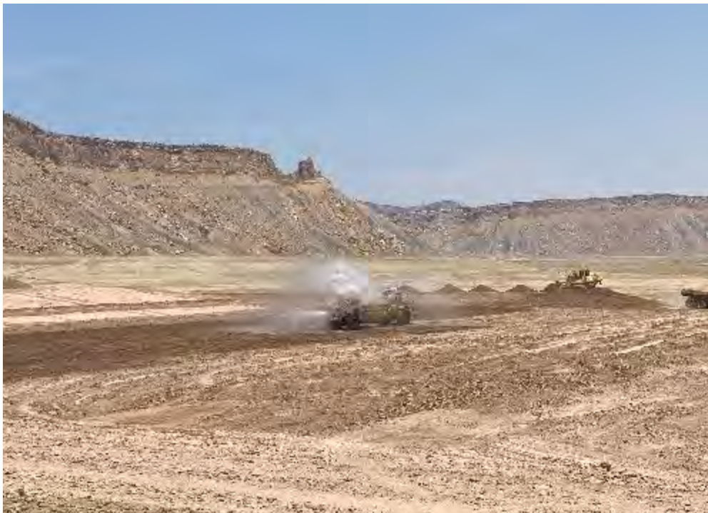
Photo 52. Watering Area for Dust Control June 2021