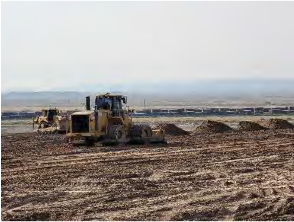
Photo 57. Compaction of 4 th RRM Lift in Top 7 Feet August 2021