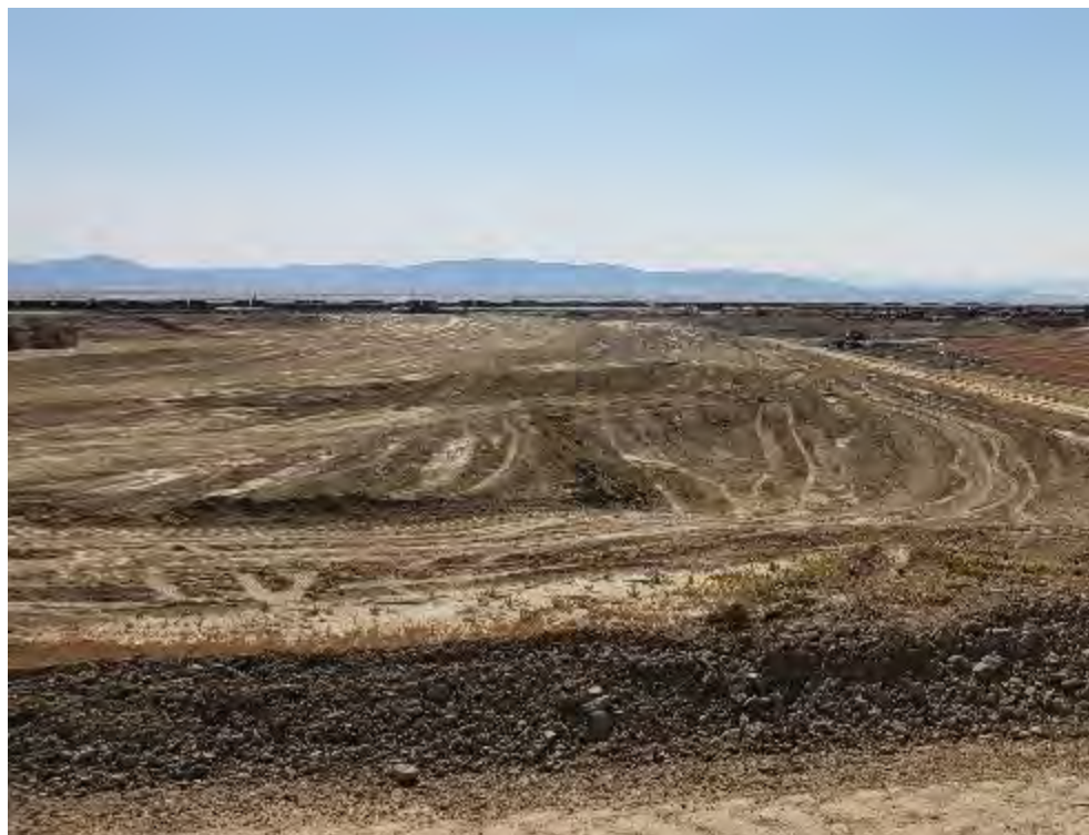
Photo 4. Phase 3 Cell Excavation October 2020