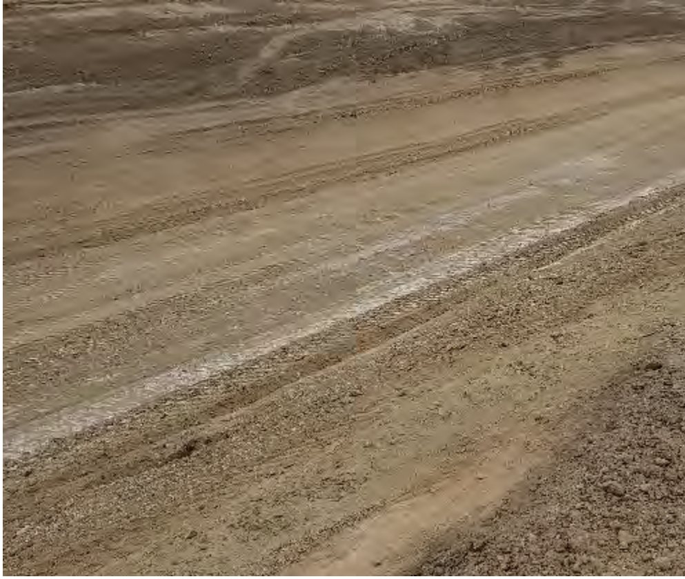
Photo 17. Completed Cell Excavation February 2021