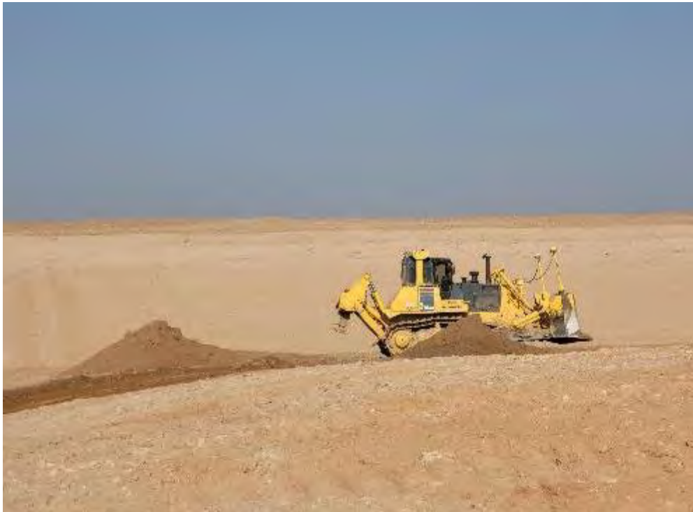
Photo 58. RRM Placement August 2021