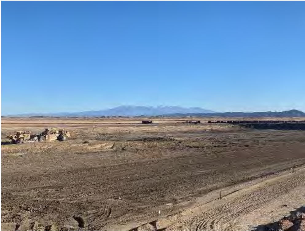
Photo 9. Cell Excavation December 2020