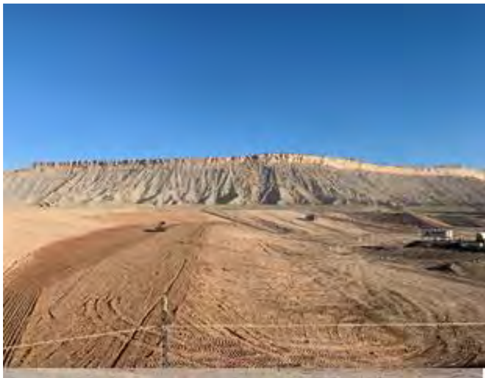
Photo 19. Placement of RRM October 2020