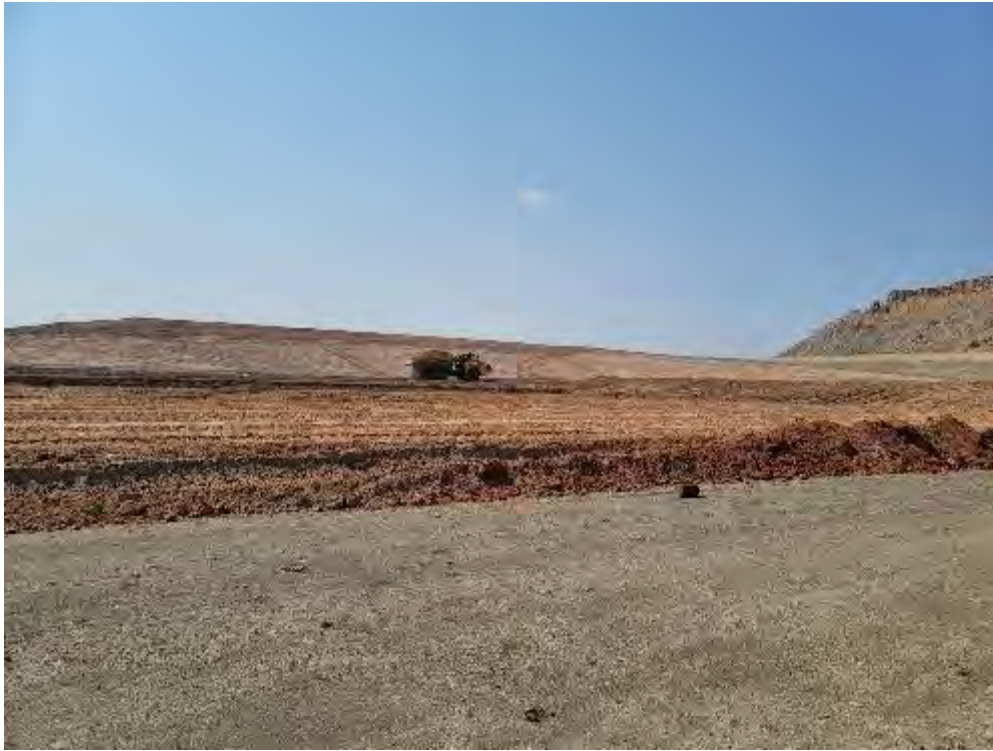
Photo 61. Placement of Debris Lift September 2021