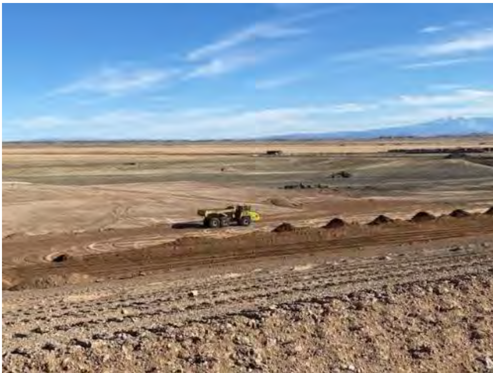
Photo 23. RRM placement November 2020