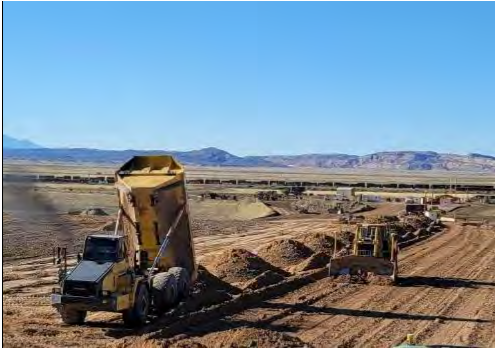
Photo 47. Placement of Material on Lift Area by Haul Truck May 2021