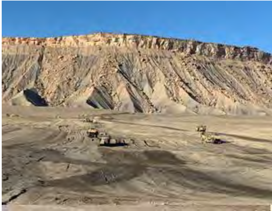
Photo 5. Cell Excavation November 2020