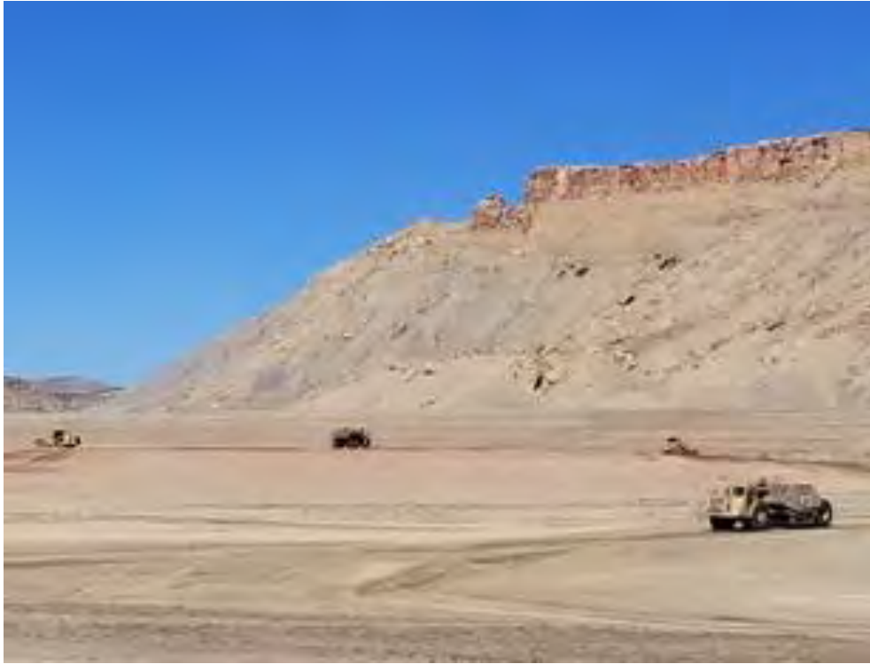
Photo 3. Phase 3 Cell Excavation October 2020