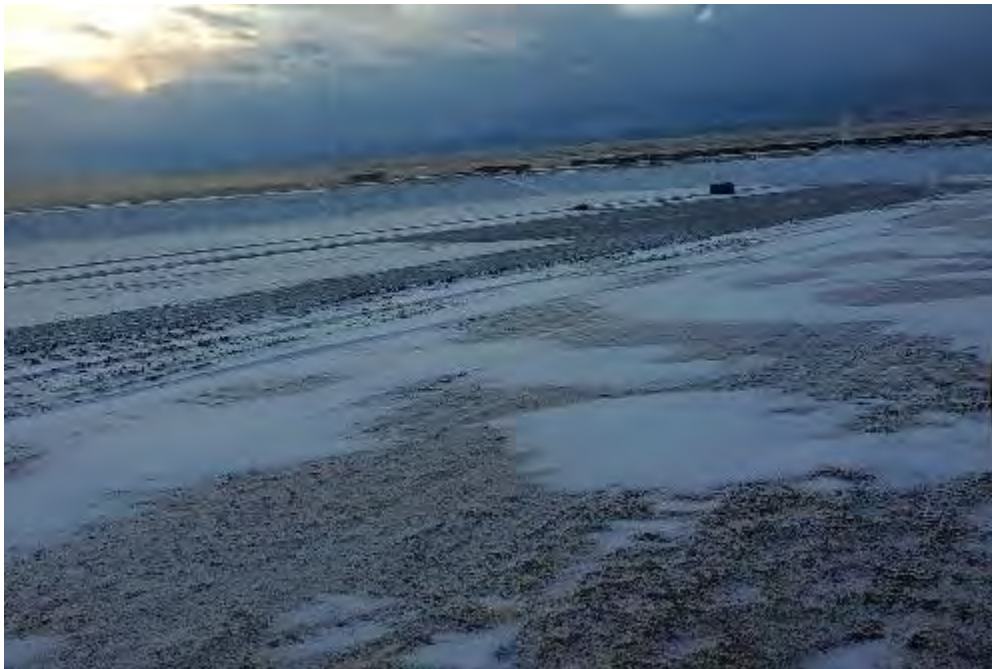
Photo 14. Cell Excavation January 2021