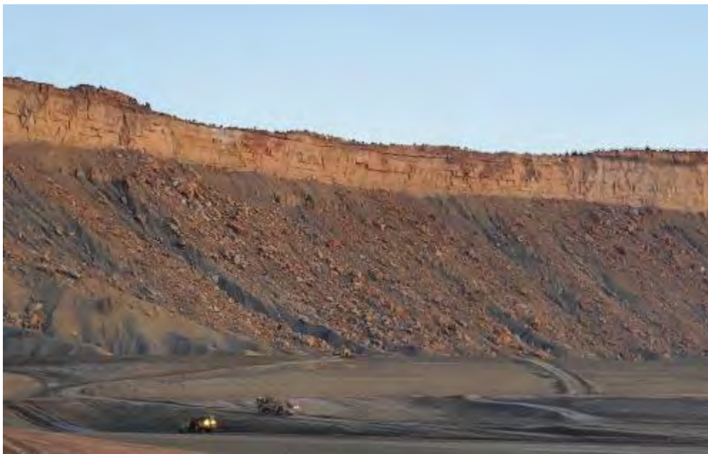
Photo 78. Transporting Material to Spoils Embankment December 2020