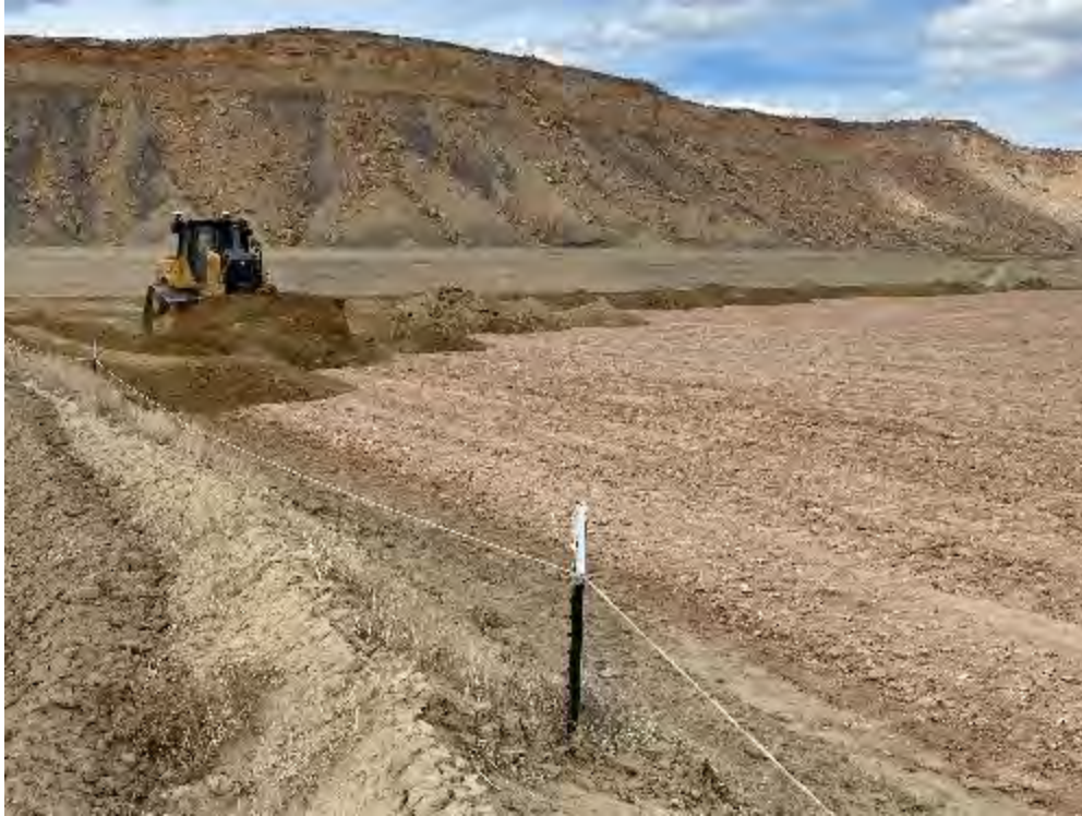
Photo 67. Pushing Interim May 2021