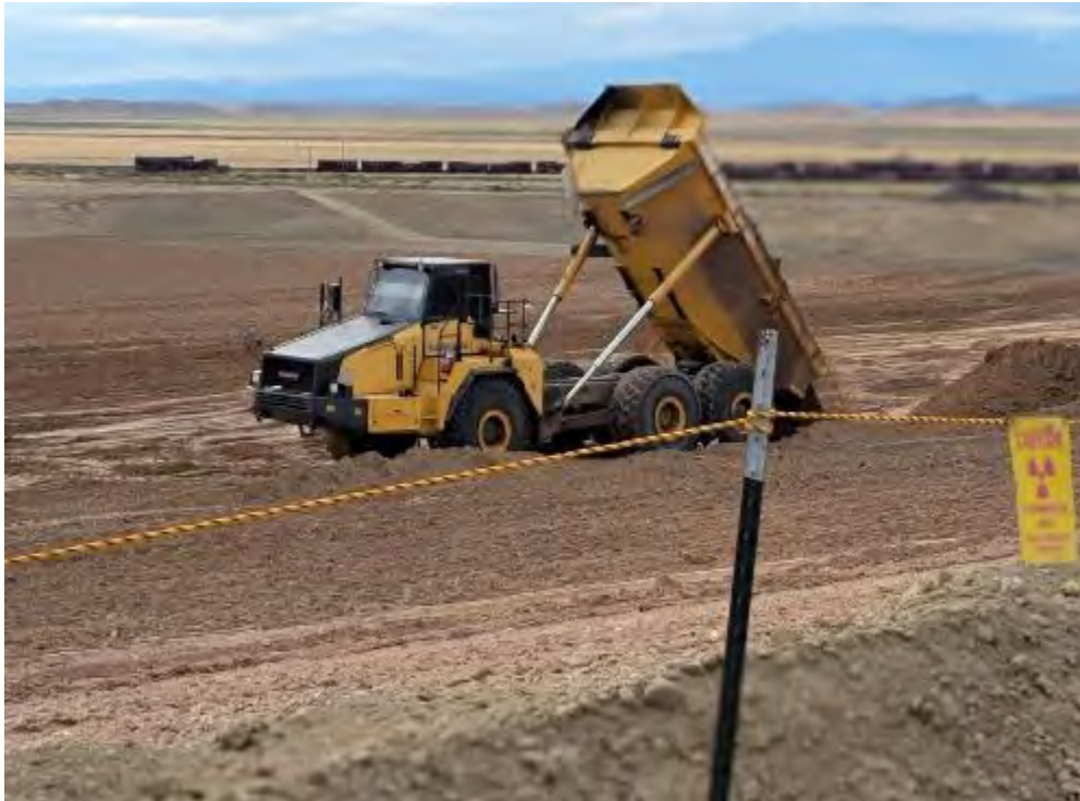
Photo 51. Haul Truck Dumping RRM of Lift Area June 2021