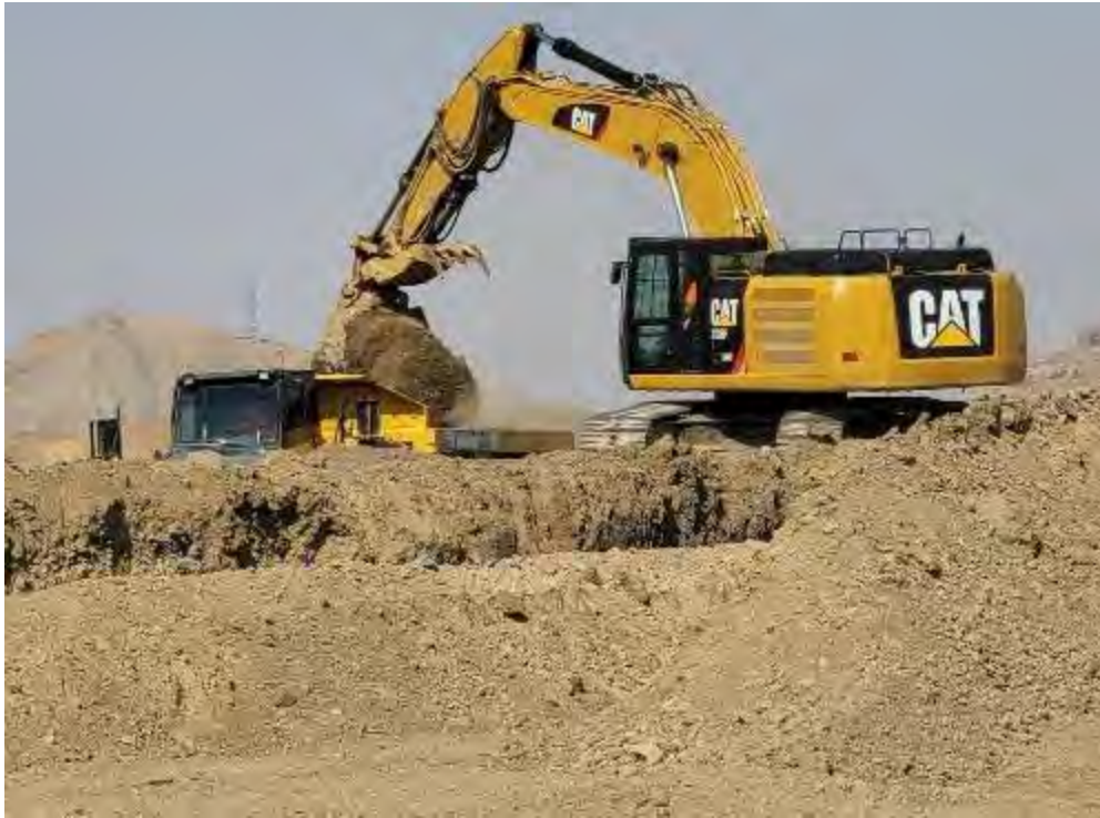
Photo 69. Interim Loadout June 2021