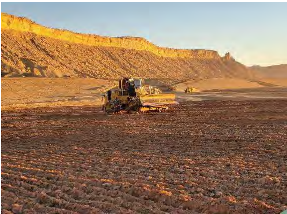
Photo 25. Breaking up Frost December 2020