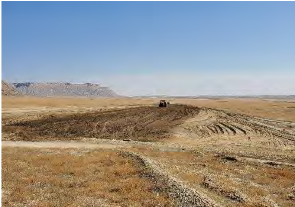
Photo 73. Constructing Spoils Embankment October 2020