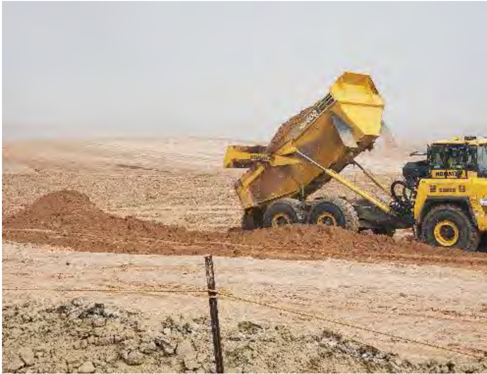
Photo 35. Soils Placement February 2021