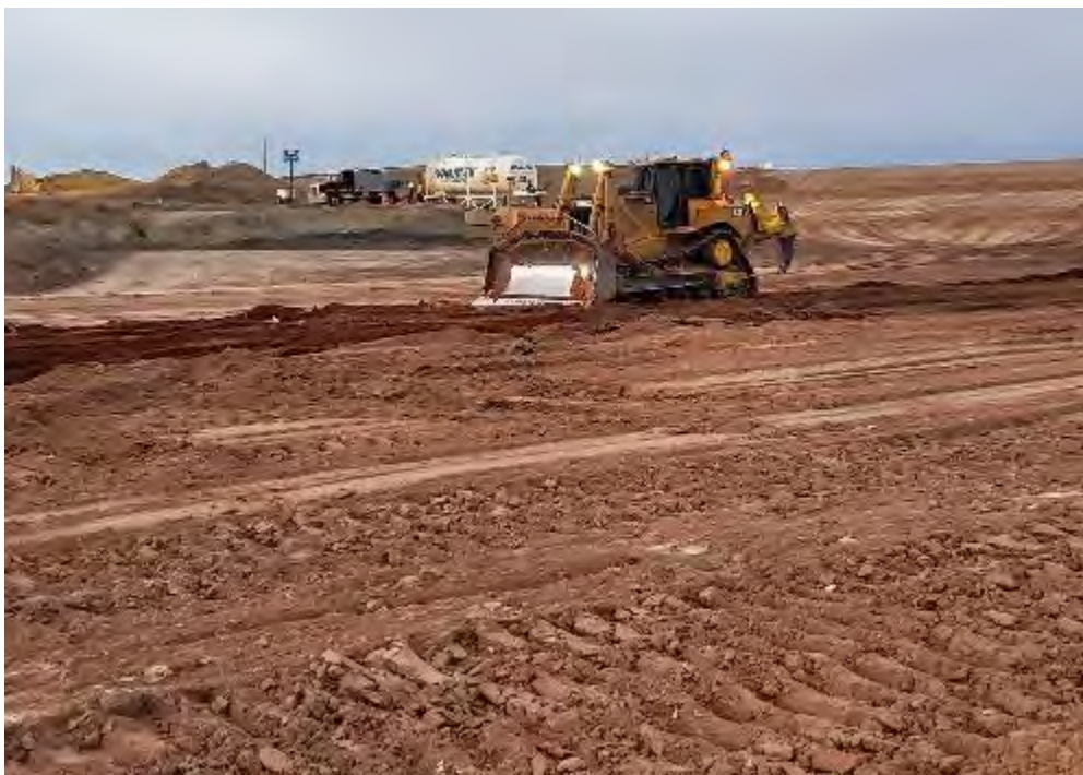
Photo 27. Placing a Debris Lift December 2020