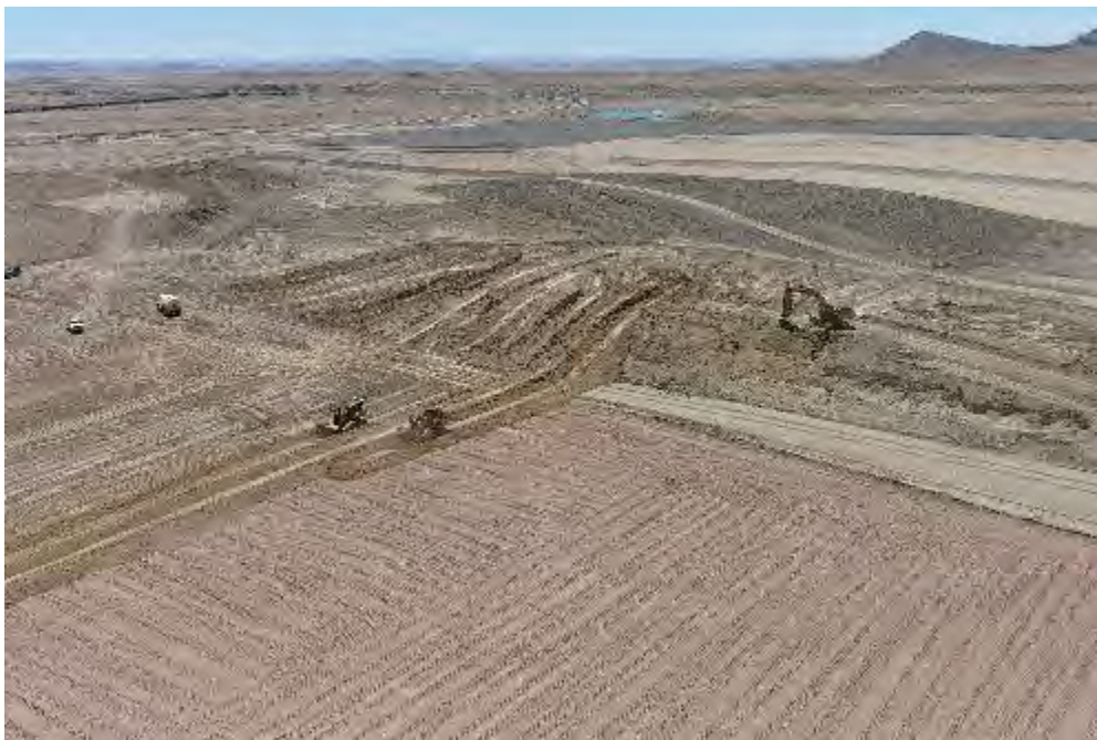
Photo 68. Pushing Out of the Stock Pile May 2021