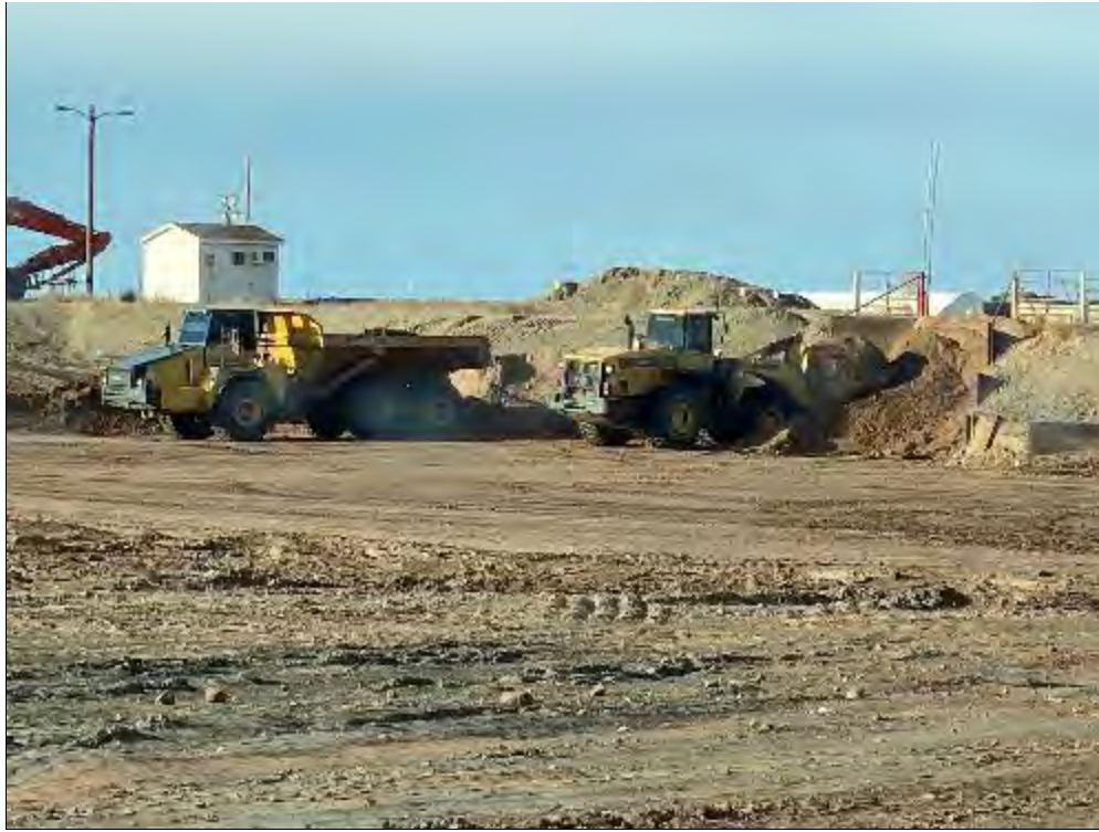
Photo 39. RRM Loadout March 2021