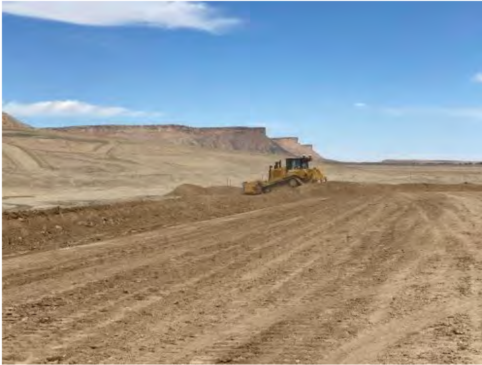
Photo 71. Dozer Pushing Interim Cover Material June 2021