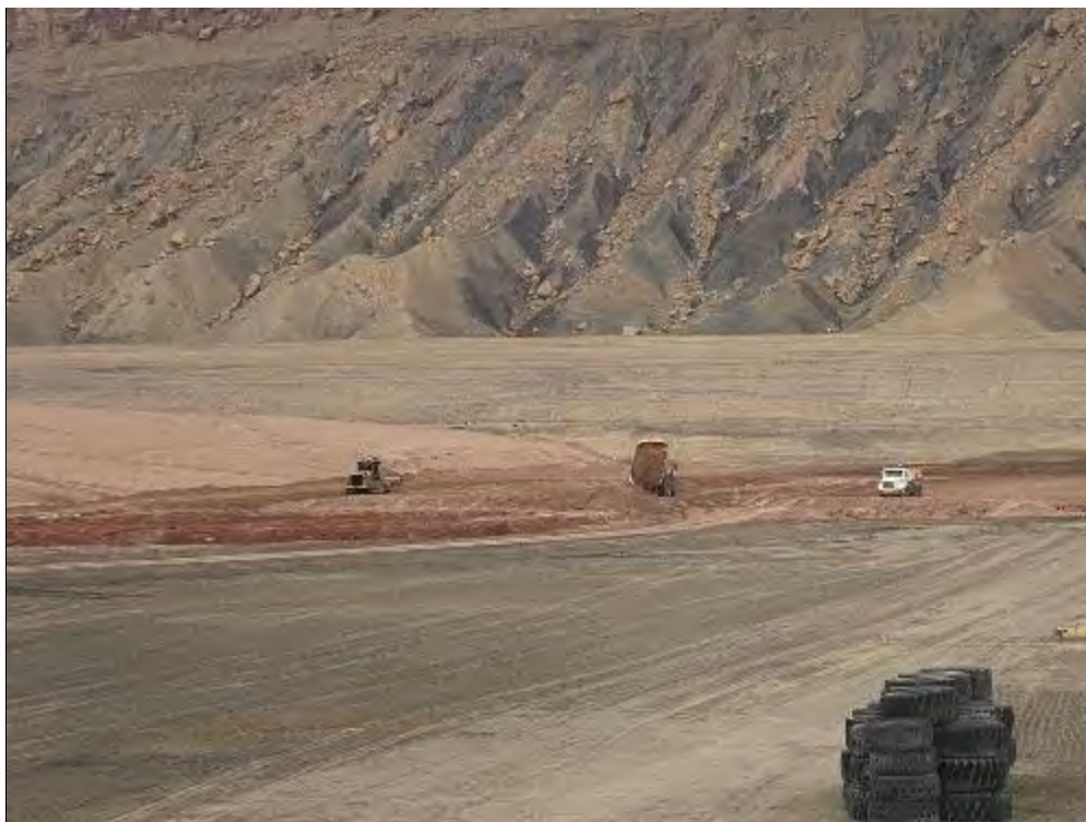
Photo 46. RRM Placement May 2021