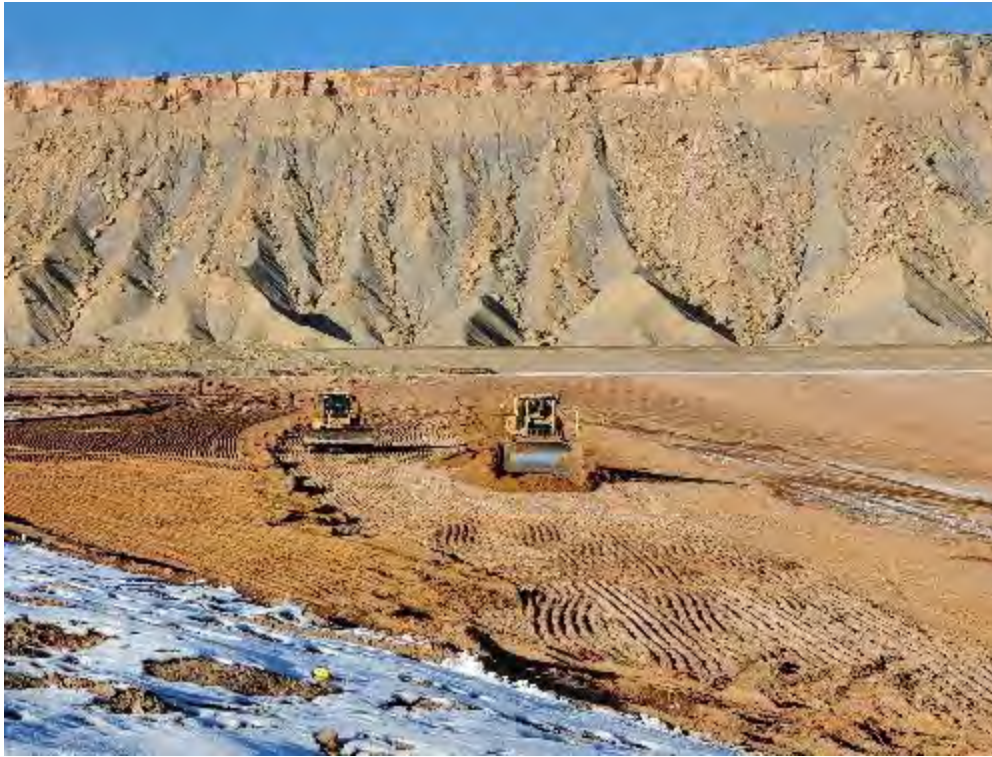
Photo 32. Equipment Placing RRM January 2021