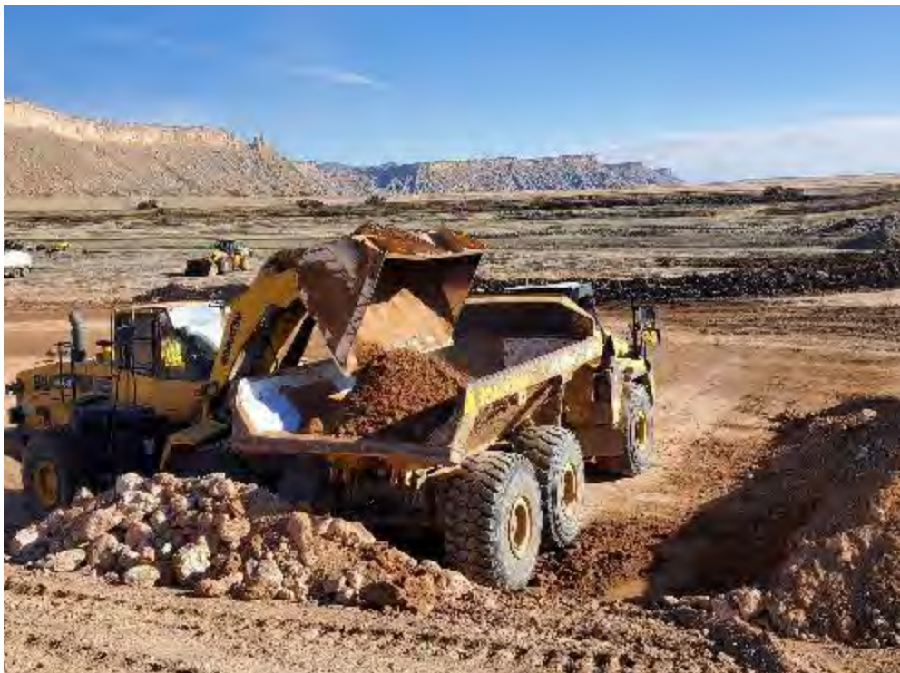
Photo 21. RRM Loadout November 2020