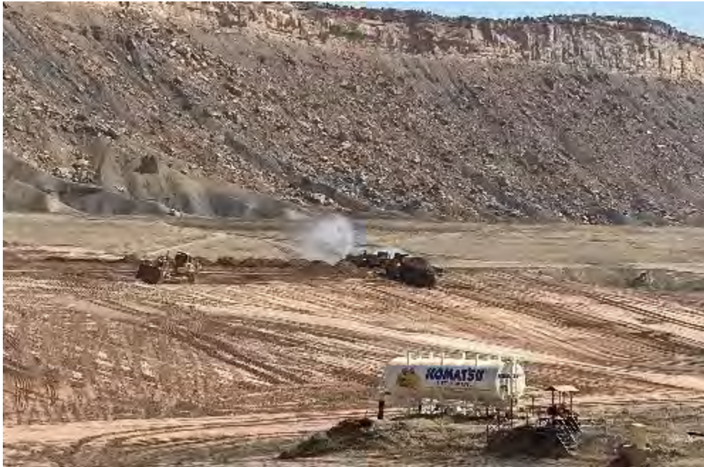
Photo 49. Placing RRM June 2021