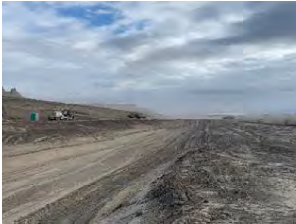
Photo 13. Cell Excavation January 2021