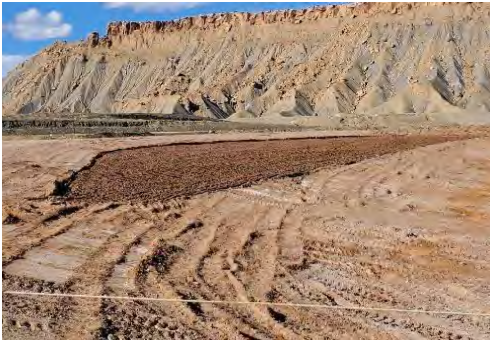
Photo 36. RRM Lift February 2021