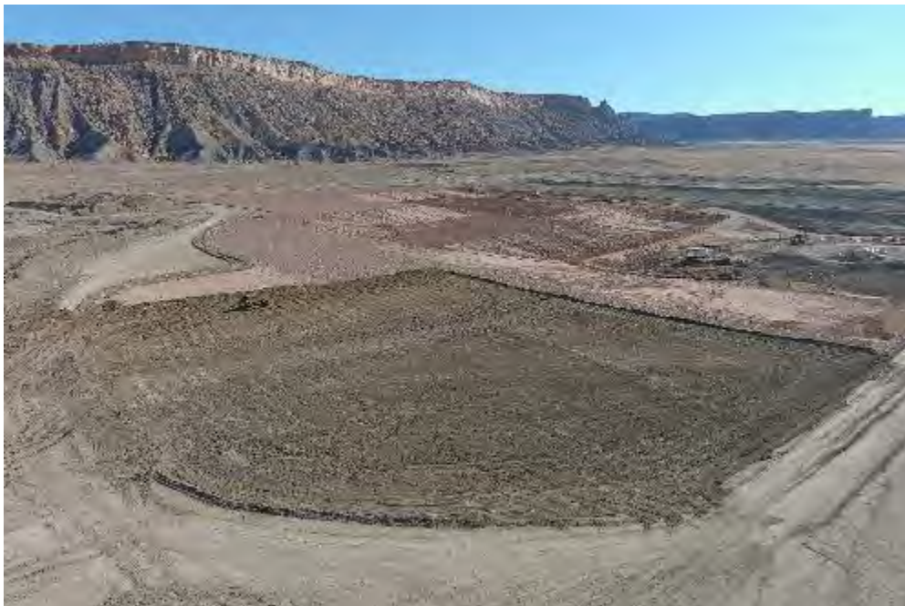
Photo 66. Aerial of Interim Placement May 2021