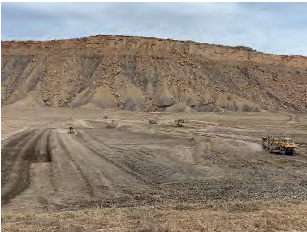
Photo 6. Cell Excavation November 2020