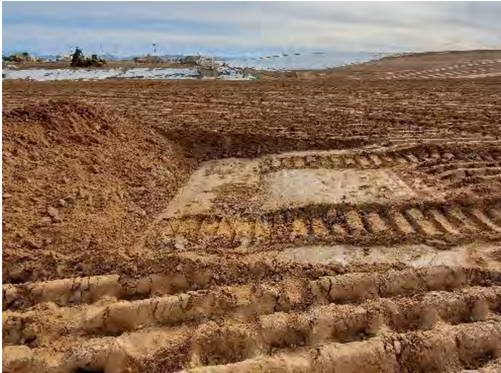
Photo 30. Lift Prepared for In-place Density Test January 2021