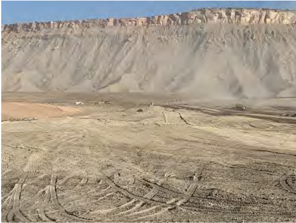
Photo 1. Phase 3 Cell Excavation October 2020