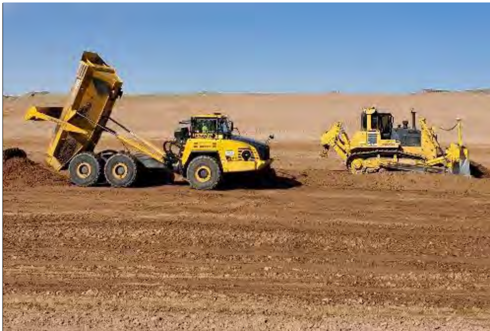
Photo 44. Equipment Placing RRM Material on Lift Area April 2021