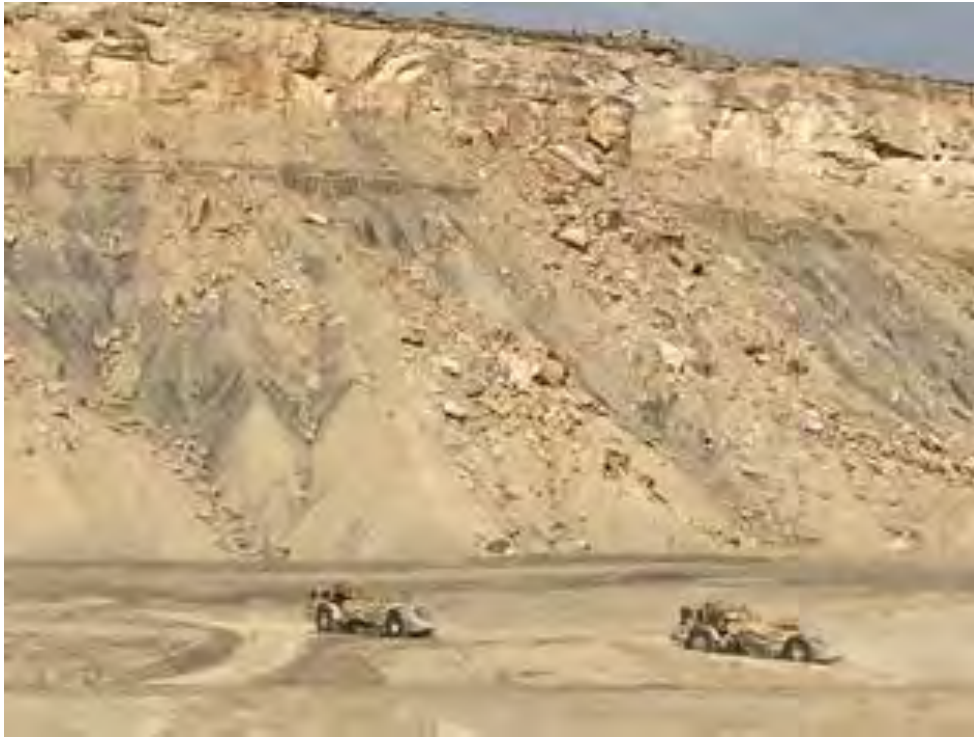
Photo 15. Cell Excavation February 2021