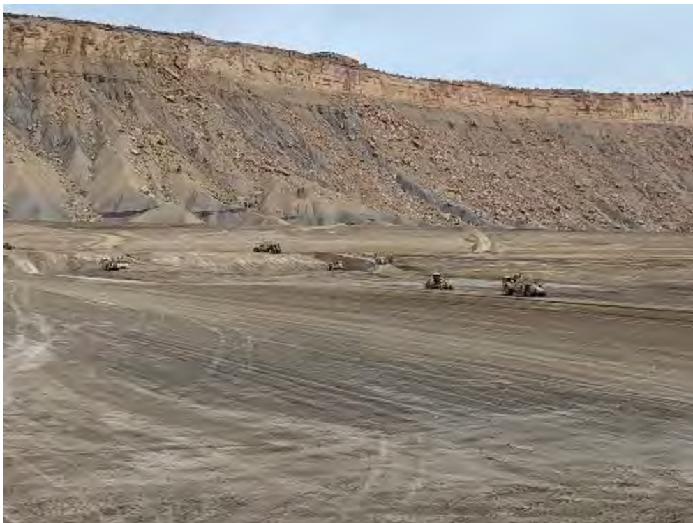
Photo 10. Cell Excavation December 2020