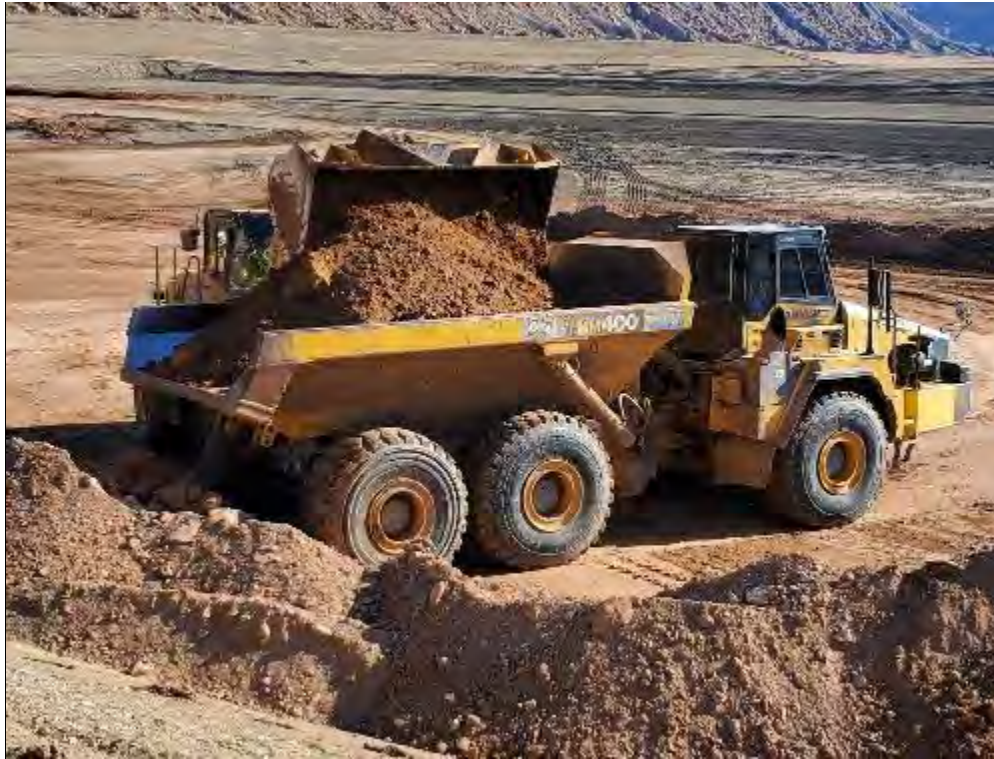
Photo 43. Loader Loading Material in Haul Truck April 2021