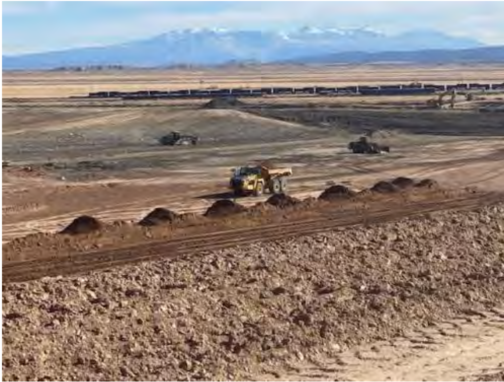
Photo 22. RRM ready for placement November 2020