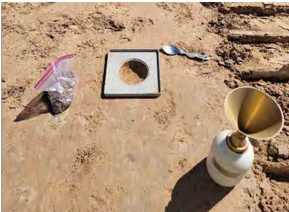
Photo 48. Preparing for Sand Cone Testing May 2021