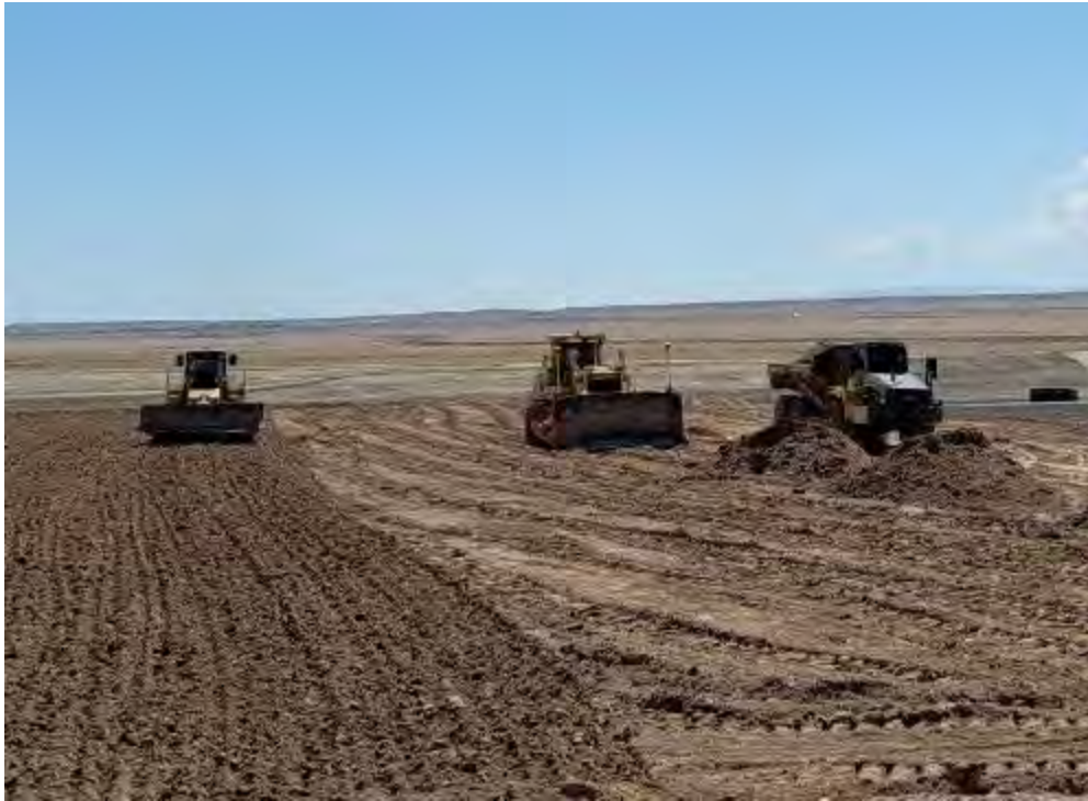
Photo 53. Multiple Disposal Cell Operations July 2021