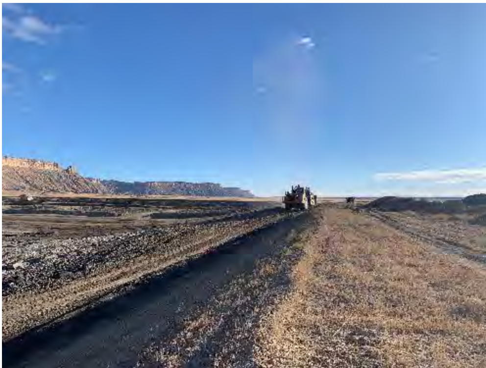
Photo 8. Cell Excavation November 2020