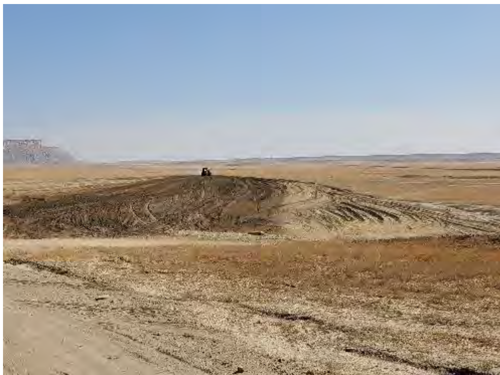
Photo 74. Placing Spoils Embankment Lift October 2020