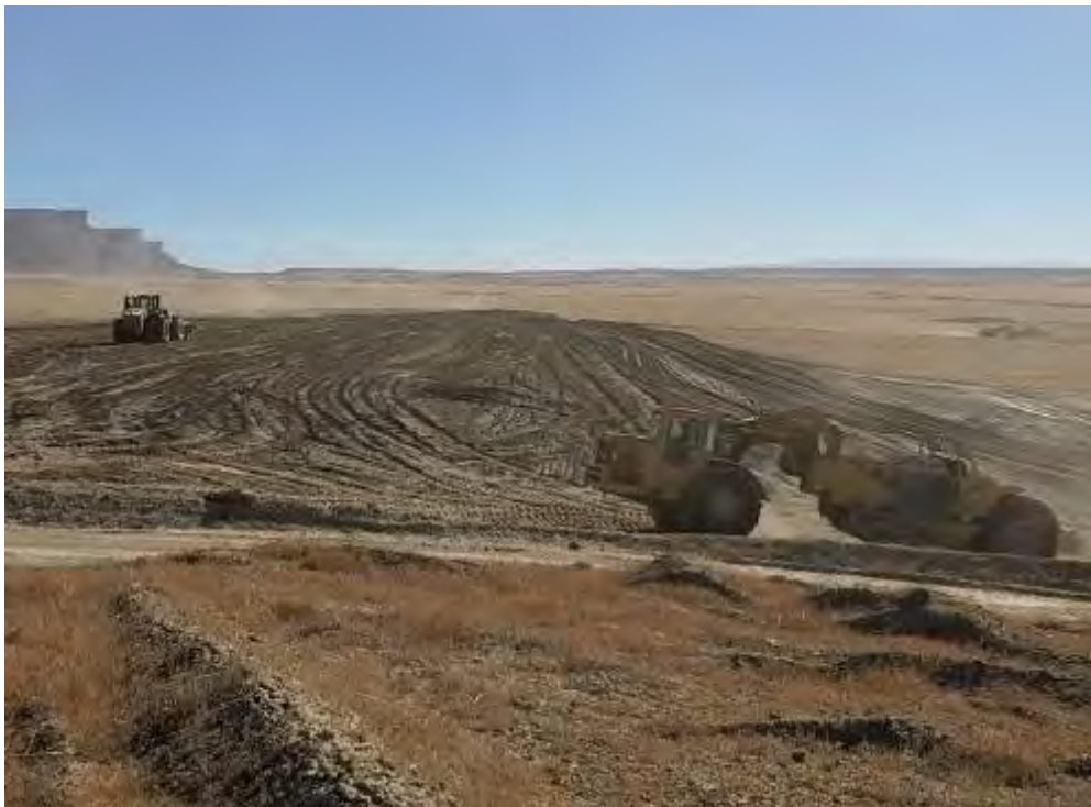
Photo 76. Hauling Material for Placement on Spoils Embankment November 2020