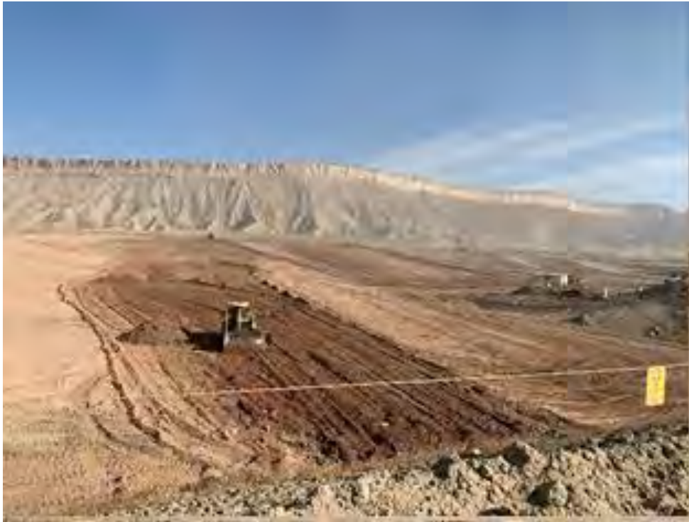
Photo 18. Dozer placing material October 2020