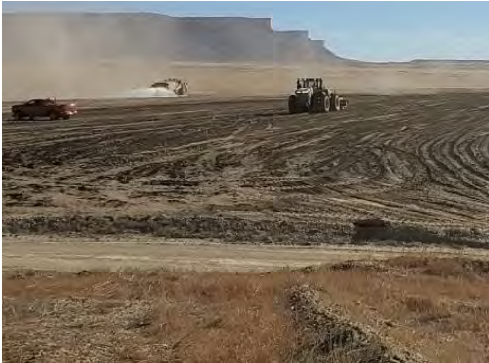
Photo 77. Constructing Spoils Embankment November 2020