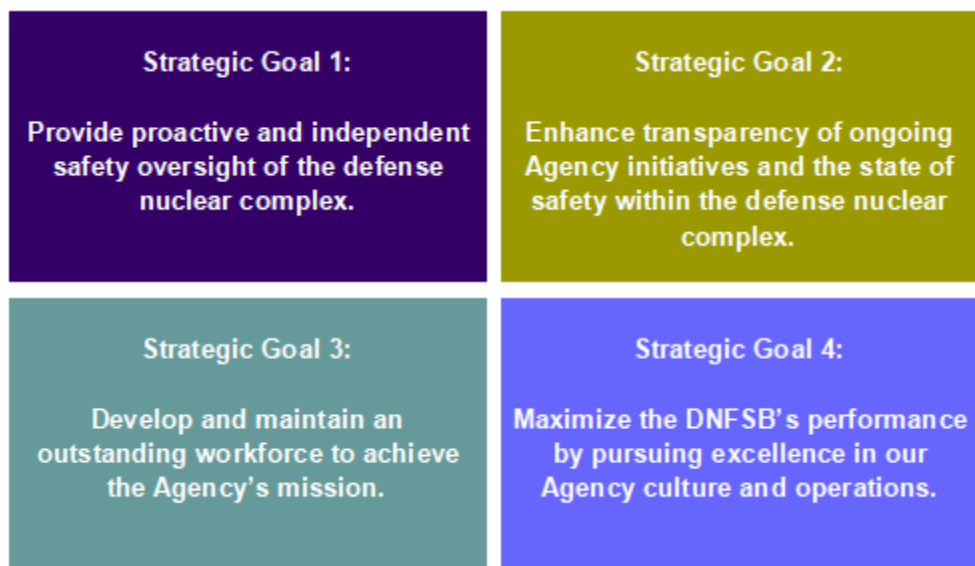
Figure 2. DNFSB Strategic Goals