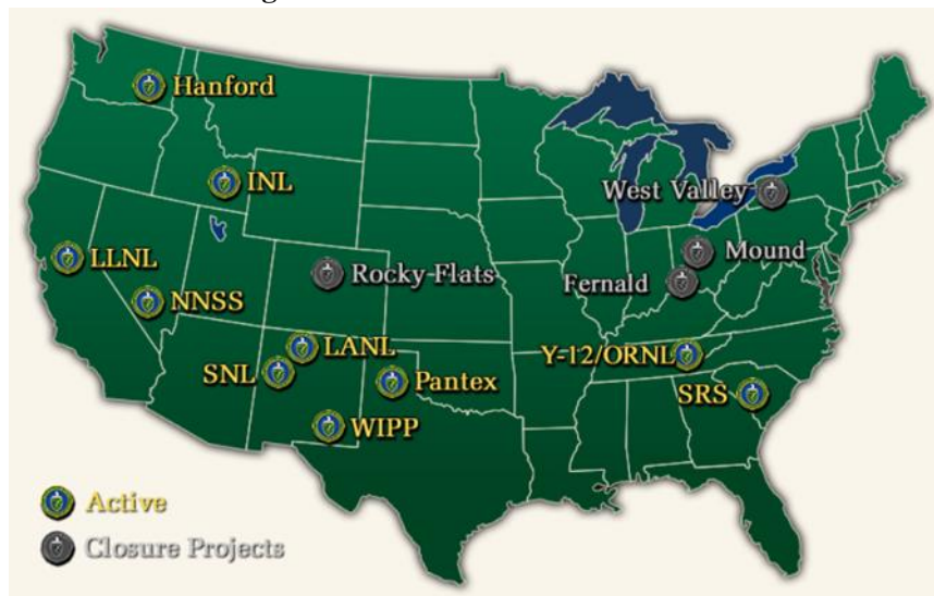
Figure 1. DOE Defense Nuclear Sites

The DNFSB is responsible for overseeing 10 active DOE defense nuclear sites in the United States. See Figure 1 for the total number of DOE defense nuclear sites, including the 10 sites under the DNFSB's purview.