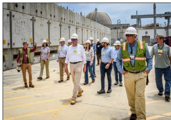
OIG staff toured a power plant interim spent fuel storage installation in July 2021.