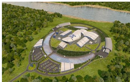
Artist rendition -- NuScale nuclear power plant