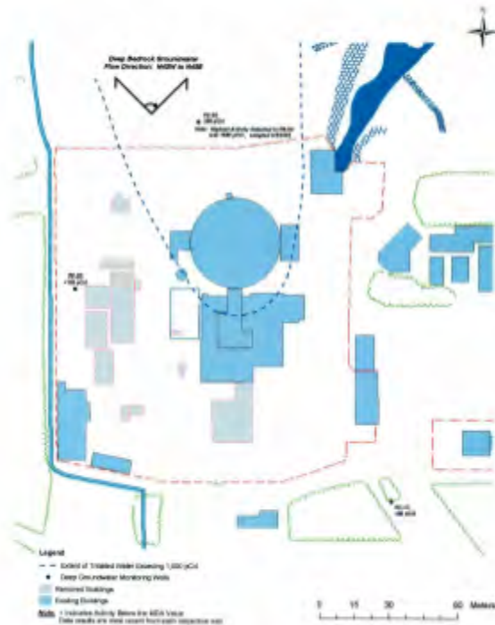
Figure 2-15. Tritium Plume in Bedrock Groundwater Zone