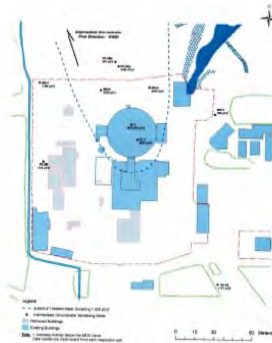
Figure 2-14. Tritium Plume in Intermediate Groundwater Zone