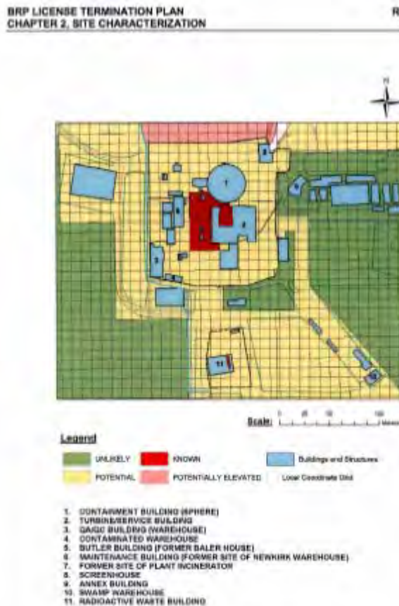
Figure 2-2. Big Rock Point Industrial Area