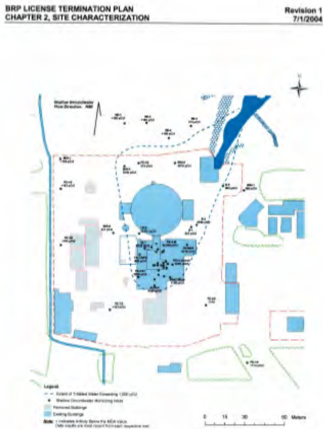
Figure 4. Tritium Plume in Bedrock Groundwater Zone. (page 22)

Figure 3. Tritium Plume in Intermediate Groundwater Zone. (page 21)