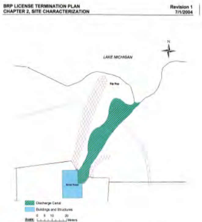
Figure 2-11. Discharge Canal Survey Unit

At the meeting, Consumers representatives also said that the groundwater under the site would wash the radioactive contamination into Lake Michigan, and since that was off their