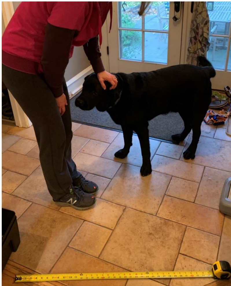
Figure 2. Dog petting.

Petting and the desire to be petted is the last of the “standing” activities. Petting is an activity that consists of hands-on contact with the dog. Additionally, the posture of the human is more likely to result in close contact with the dog, i.e., kneeling, sitting, bending over, etc. For this activity, an assumed distance of 1 foot is appropriate. The actual distance is likely to be longer given that the majority of petting is on the dog’s torso or head and the geometry considerations with regard to dog joint proximity to the person’s torso. However, 3 feet is likely not conservative. Figure 2 shows a typical posture for a person petting a dog.