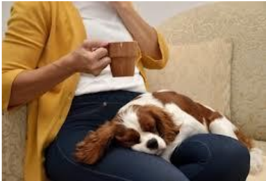
Figure 6. Dog in lap.

Previous NRC evaluations of human-feline interactions focused on distances of 3 inches, 6 inches, 1 foot, and 3 feet (1 meter) and implicitly indicated that distances greater than 3 feet were not of importance, a conclusion with which we agree (NRC 2001). A distance of 3 inches was especially discussed with regard to lapcats. While a cat’s thyroid may be near the torso, a dog’s leg joint will be further away even when in a person’s lap. This is especially true when considering the center of the torso rather than the closest portion of the torso as discussed in NRC 2003. For dogs, most of whom are substantially larger than the average cat, this distance is not applicable. Additionally, in most postures of lap-sitting, such as shown in Figure 6, the dog’s body will serve as a shield for most of the human torso for radiation coming from the dog’s legs or the dog would be in such a position that the average distance would be a foot or more, i.e. stretched out perpendicular to the human’s legs or with the dog’s legs pointed towards the human’s knees.