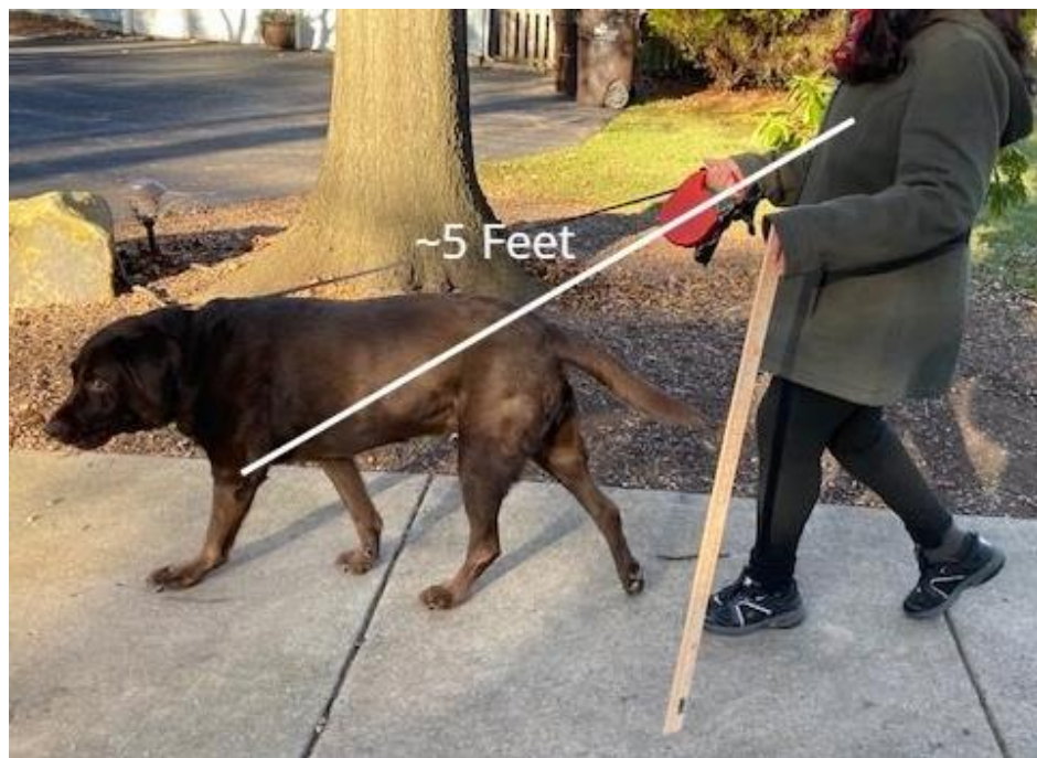
Figure 1. Large dog being walked by small adult.

Walking a dog is another activity where the majority of the activity is conducted at a distance of 3 feet or more. With the potential exception of very well-trained dogs that heel well, a typical dog will be walked with the dog at or near the extent of the leash. With a common minimum leash length of 3-4 feet, the length of an owner's arm, and taking consideration of the height difference between the dog's neck and leg joint, 3 feet is a reasonable minimum distance from a treated joint to a person's torso with greater distances more common. Figure 1 shows a large dog (107 lb) being walked by a small adult (4 ft 11 in tall). Scaling from the yardstick included in the photo, the distance from the dog's elbow to the center of the person's torso is approximately 5 ft.