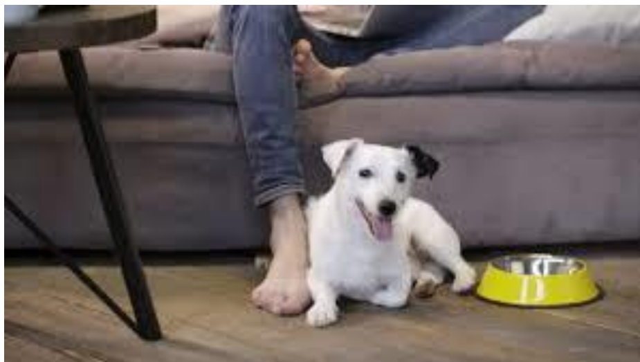
Figure 4. Dog at feet.

While the dog is resting at its owners feet or by the owner's chair, it will normally be lying down, either on its side or in a prone position. In either case, the dog's leg joints are effectively at floor height. In the case of a prone position, they are located underneath the dog, attenuating any radiation emitted towards the person. A standard chair seat has a height of 18 inches, limiting the lower extent of a person's torso to that height. The center of the torso would be some distance higher with an additional foot being conservative for the average adult (ICRP 2001). Coupled with the lateral offset of the dog (i.e., not under the chair), a distance of 3 feet from a dog's leg joints to the midpoint of a seated person's torso is a reasonable estimate. Figures 4 and 5 show typical positions.