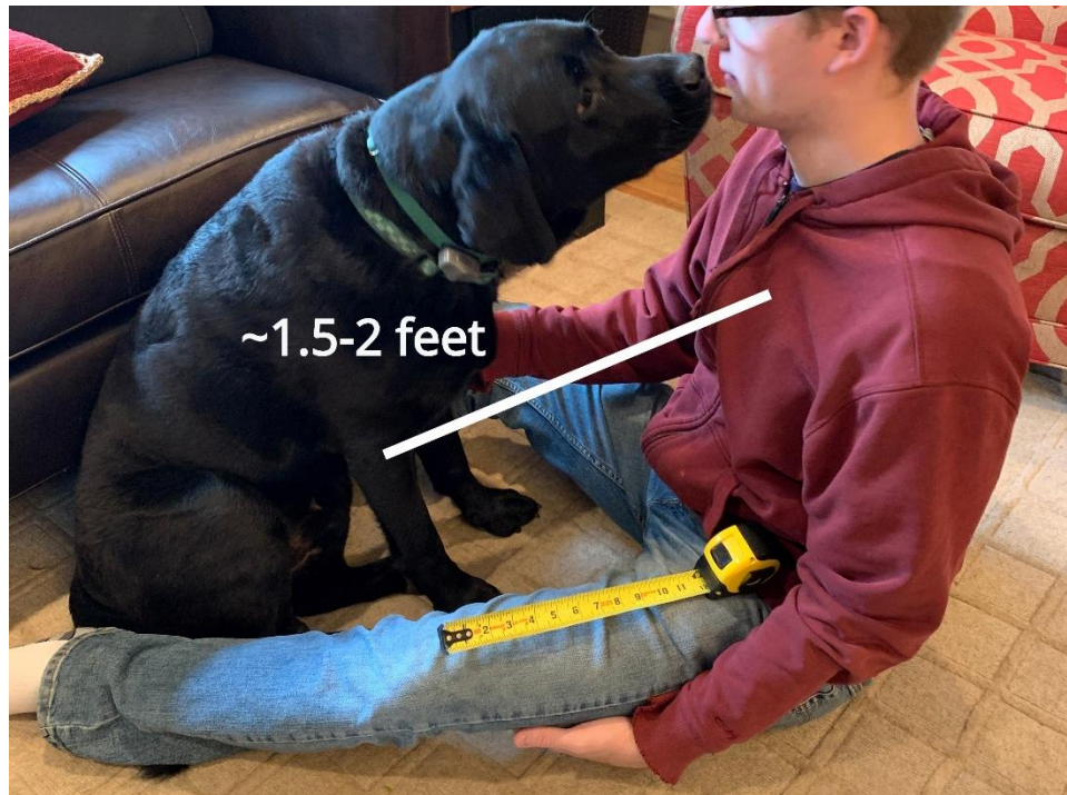
Figure 3. Dog petting.

While petting can be a frequent activity with dogs, each petting session typically does not last very long. Discussions with a focus group of dog owners indicated that a typical petting session would last 15-20 seconds and focus primarily on the dog's head. On a day with a lot of petting, there might be 8 to 10 such petting sessions, with fewer on other days, such as when at work or if the dog is outside often. This indicates petting commonly occupies up to 200 seconds, or 3.33 minutes per day. To be conservative, this is rounded to 5 minutes. Additionally, most petting, being petting on the head, would result in a human torso-dog joint distance of more than a foot, but less than 3 feet. While 2 feet is a reasonable estimate for the typical distance, it is conservatively assumed that the distance might be as little as 1 foot.