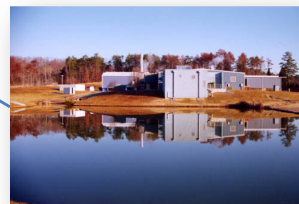
DSSI - Kingston, TN