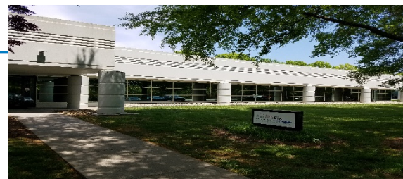
Perma-Fix Business Center Knoxville, TN