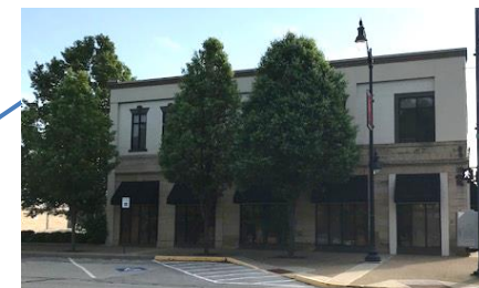
Technical Services Office New Brighton, PA