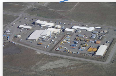
Perma-Fix Northwest - Richland, WA