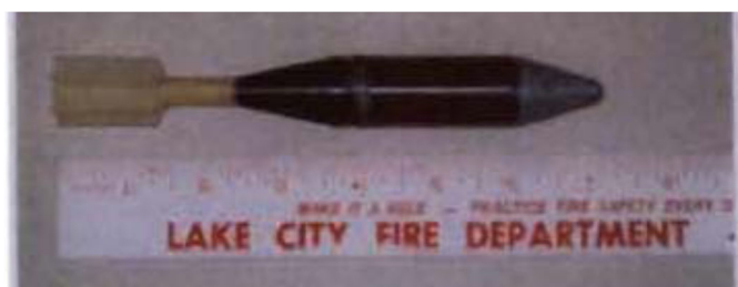
Figure 1-1 Davy Crockett M101 spotting round

Requirements of this plan are in addition to, not in lieu of, any and all other safety requirements, especially those related to unexploded ordnance (UXO) in or around RCAs.