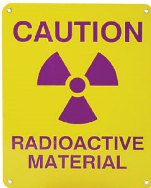
Figure 14-1 "CAUTION, RADIOACTIVE MATERIAL" sign

The Garrison RSO shall post or make available current copies of any notice of violation involving radiological working conditions, proposed imposition of civil penalty, or order from the NRC and any IMCOM response.