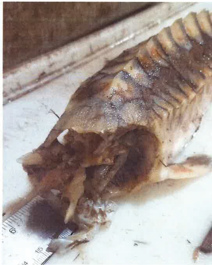
A dorsal view showing the missing head and related damage to the torso (7/13/20).