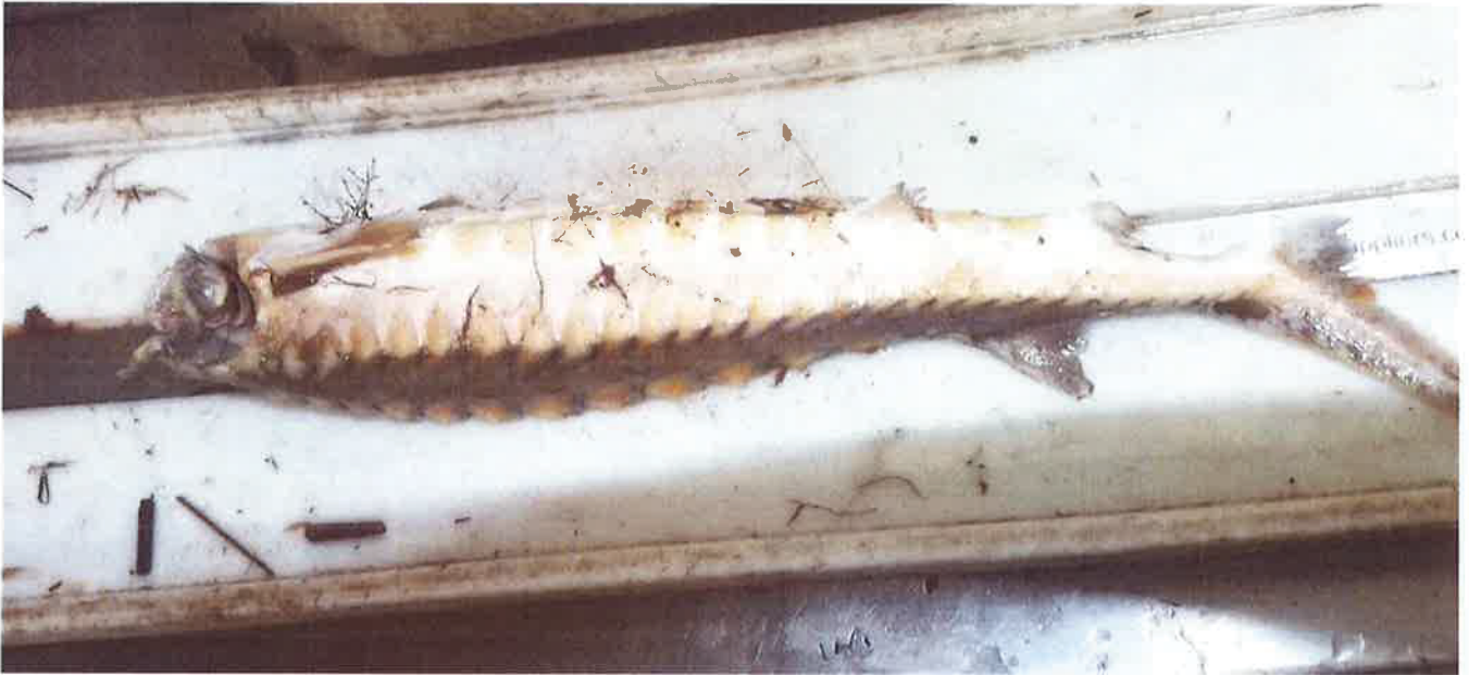
A dorsolateral view of the right side of the specimen, showing the missing head and areas of minor decomposition (07/13/2020).