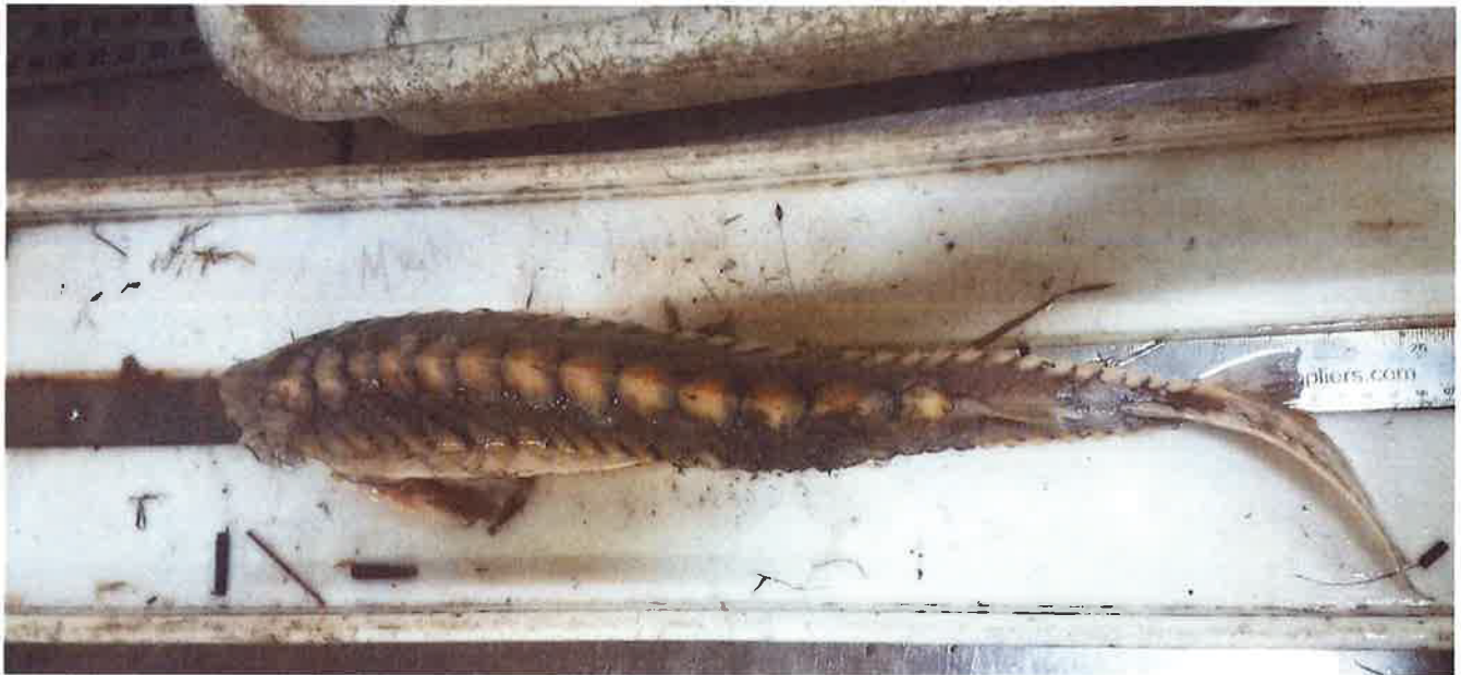
A dorsal view showing the existing torso with missing head. Evidence of minor decomposition was observed occurring to the dorsal and caudal fin edges, and to some areas of soft tissue (07/13/2020).