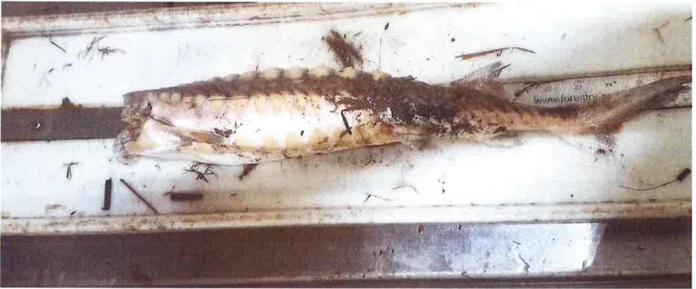
A dorsolateral view showing the size and condition of a deceased and headless Atlantic sturgeon ( Acipenser oxyrinchus ), retrieved at approximately 10:30am on 07/13/2020 from 11A circulator intake by Salem Yard Crew personnel during routine trash rack cleaning at Salem Nuclear Generating Station (07/13/2020).