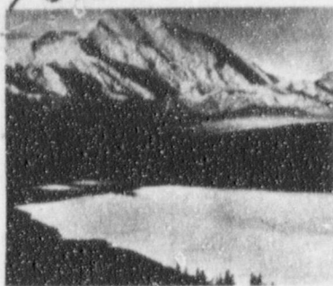
Sunrise, Mt. McKinley