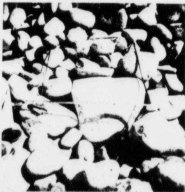
8-26-85 CLIVE ROCK PIT