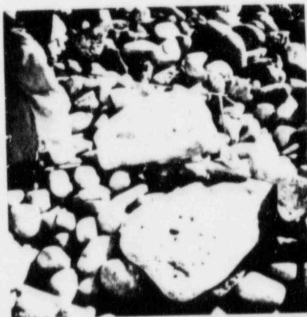
8-26-85 CLIVE ROCK PIT