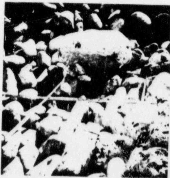
8-26-85 Cave Rock Pit