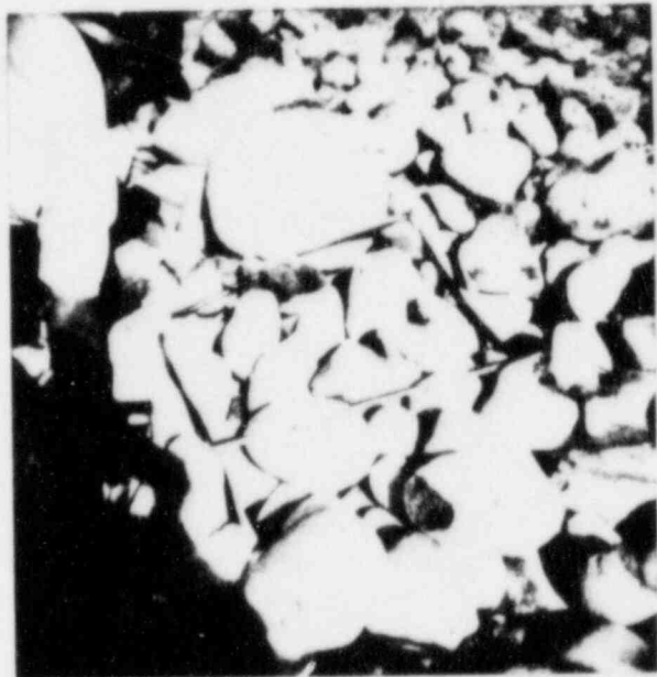
8-26-85 Cave Rock Pit