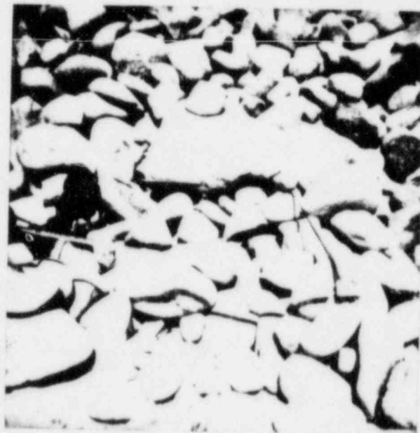
8-26-85 CLIVE ROCK PIT