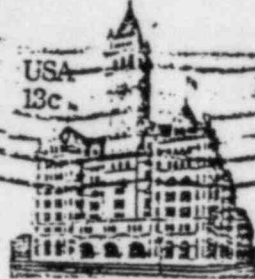
Old Post Office, Washington, D.C.