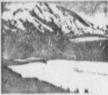
Sunrise, Mt. McKinley