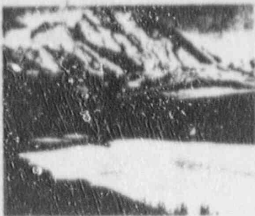
Sunrise, Mt. McKinley