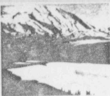
Sunrise, Mt. McKinley