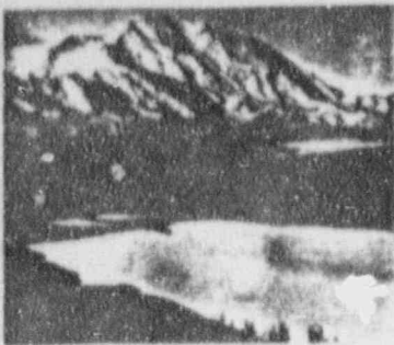
Sunrise, Mt. McKinley