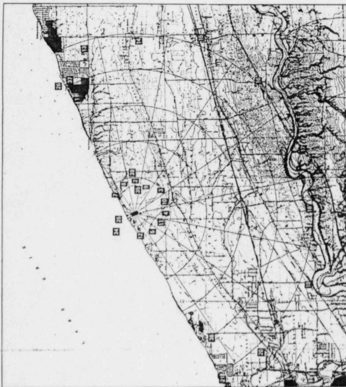
Figure 5.1-1 Radiological Environmental Monitoring Program Sampling Locations within 5 miles of PNPP