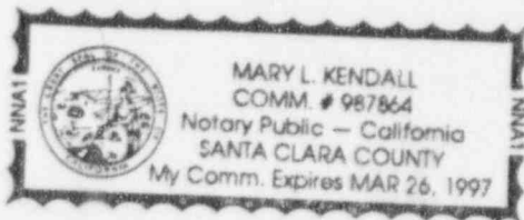
Notary Public, State of California