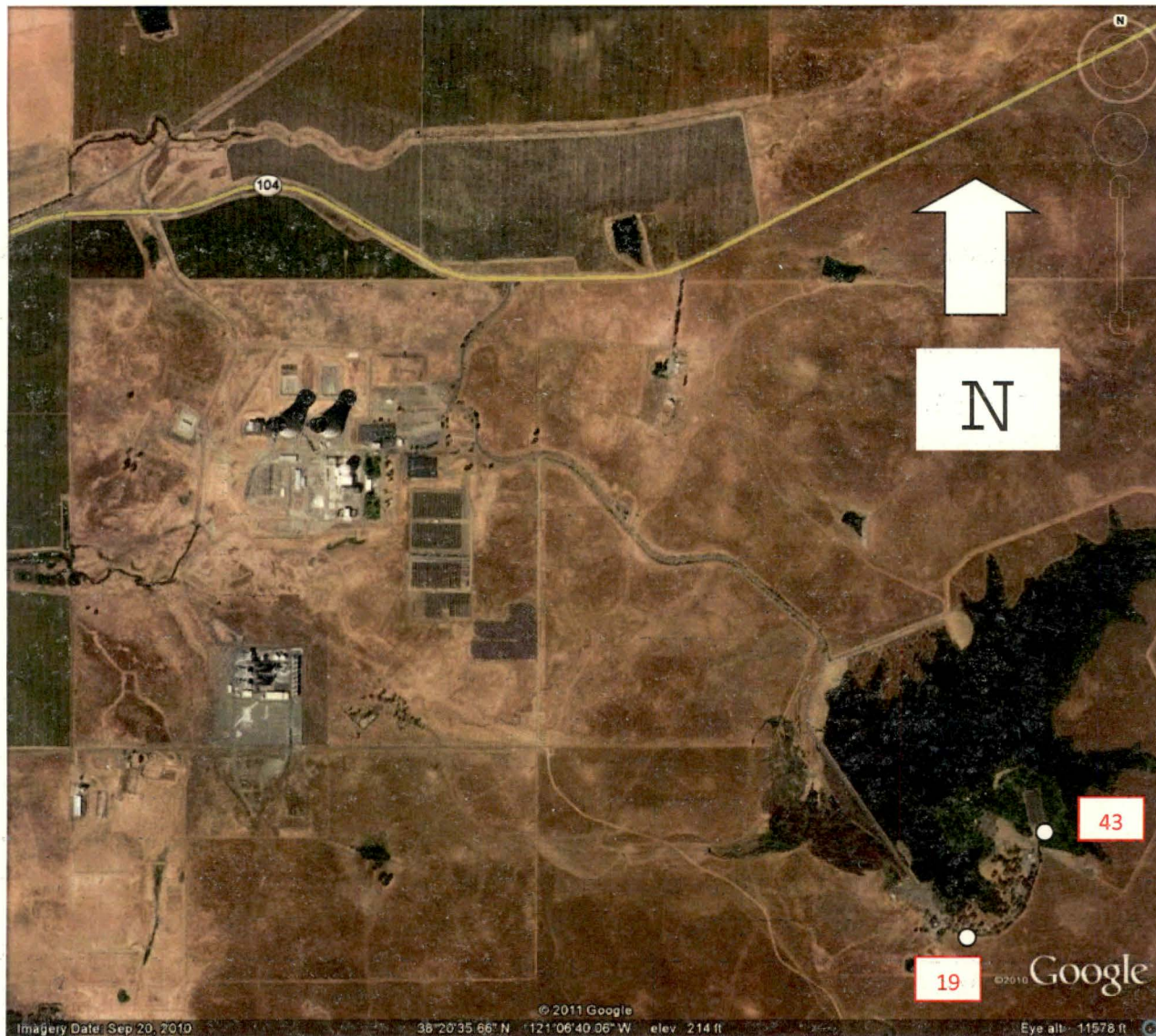
Figure B-2 Radiological Environmental Control Locations