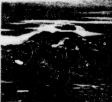
Mount St. Helens.

VOLCANO IS VIOLATING FEDERAL REGS. The radio- active release from Mount St. Helens was "many times more significant" than that from the