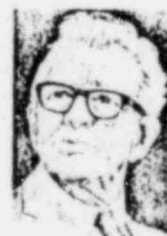
USA 15c Everett Dirksen

Protecting Service Section Office of the Secretary U.S. Nuclear Regulatory Commission Washington, D.C. 20555