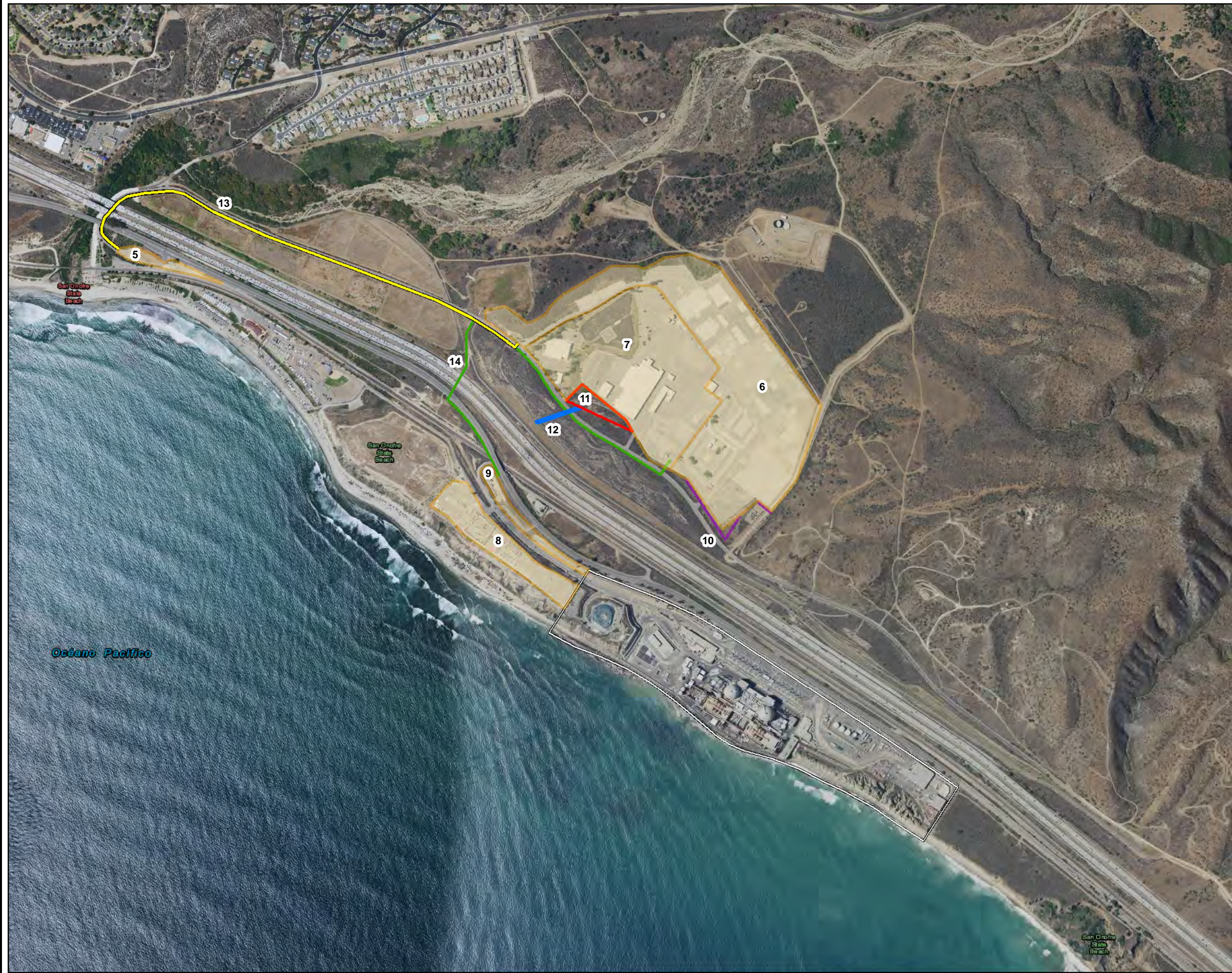
Figure 1 Mesa Lease Amendment to Add Orpan Lands

Path: P:\Data\Confidential\SONGS\Misc\Maps\20170427_MesaNavy\SONGS_Mesa_Navy_Fig1.mxd