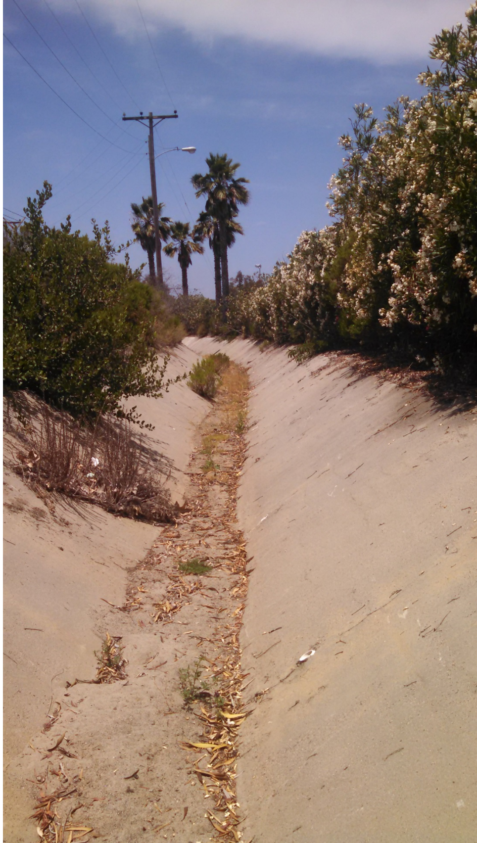
Storm Drainage Culvert