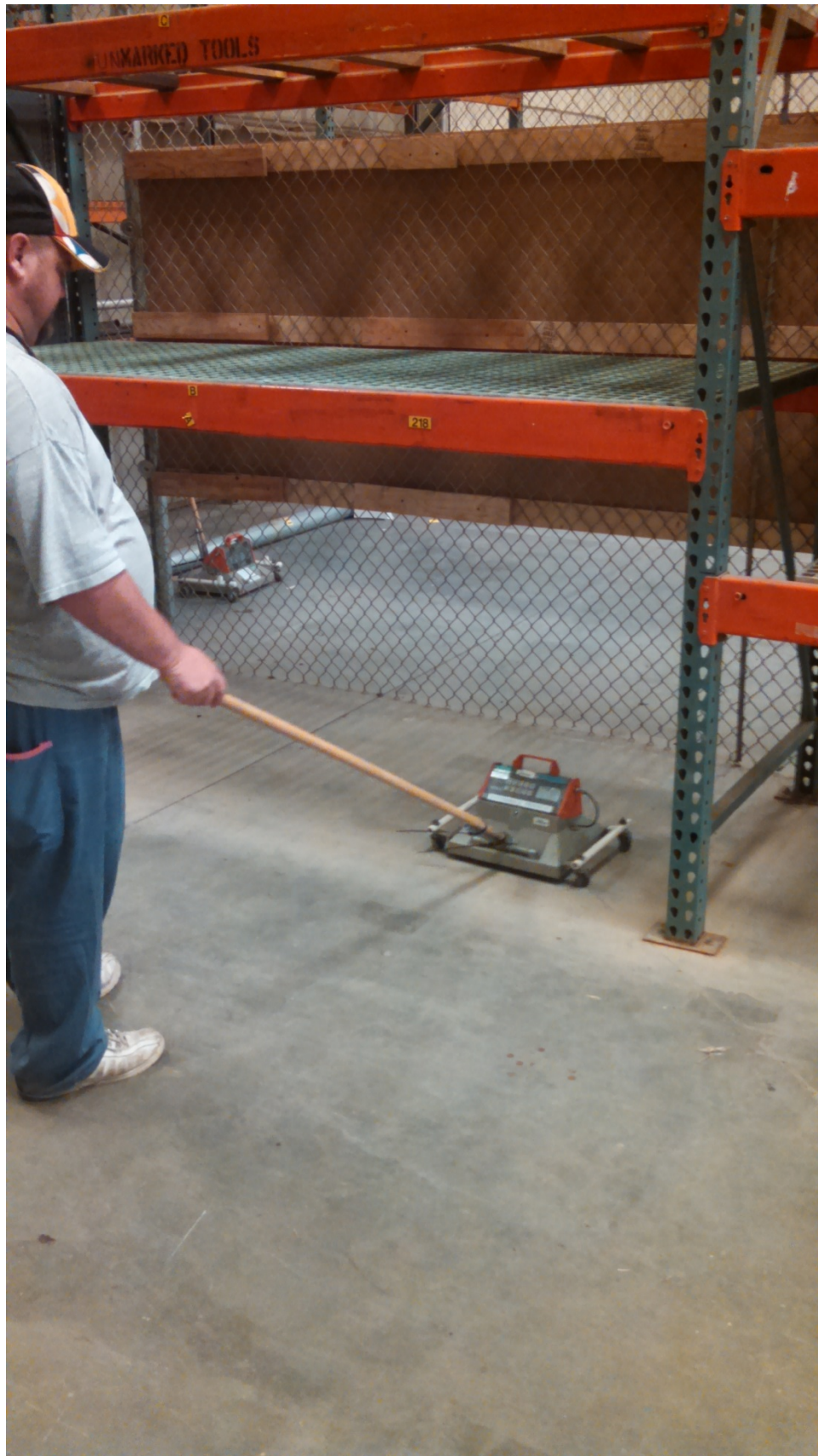
Bicron Floor Monitor