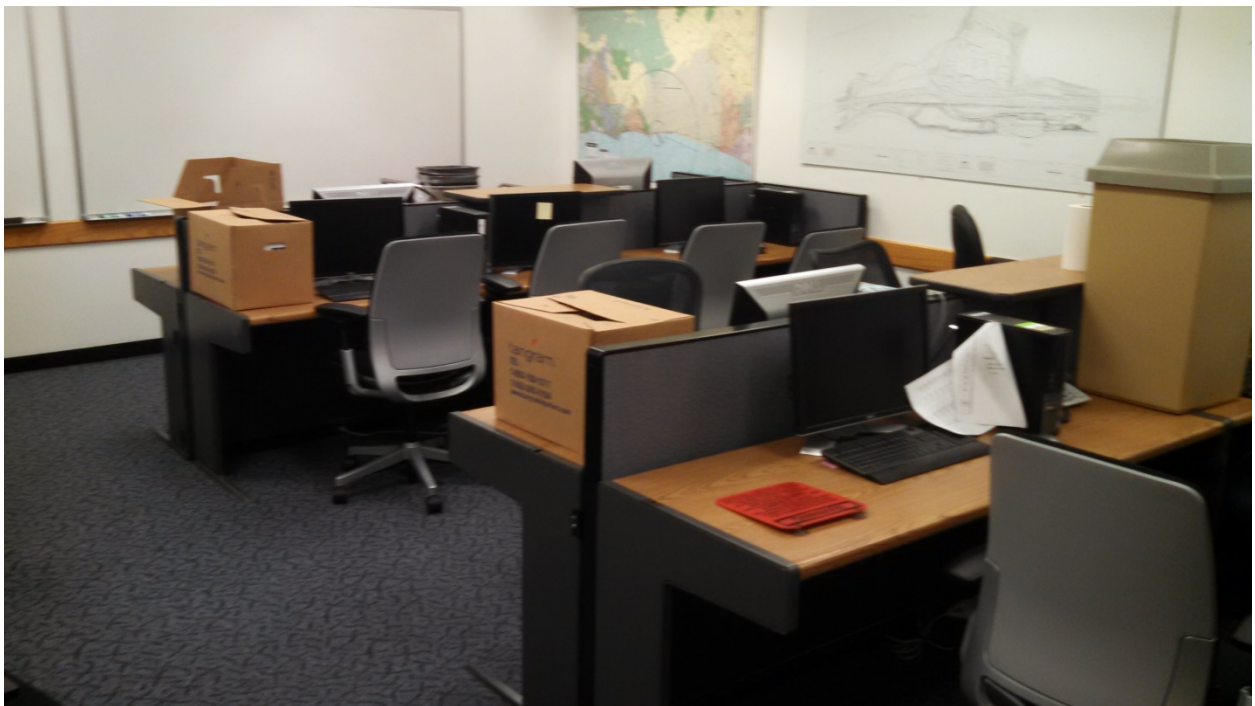
E-50 HP Classroom