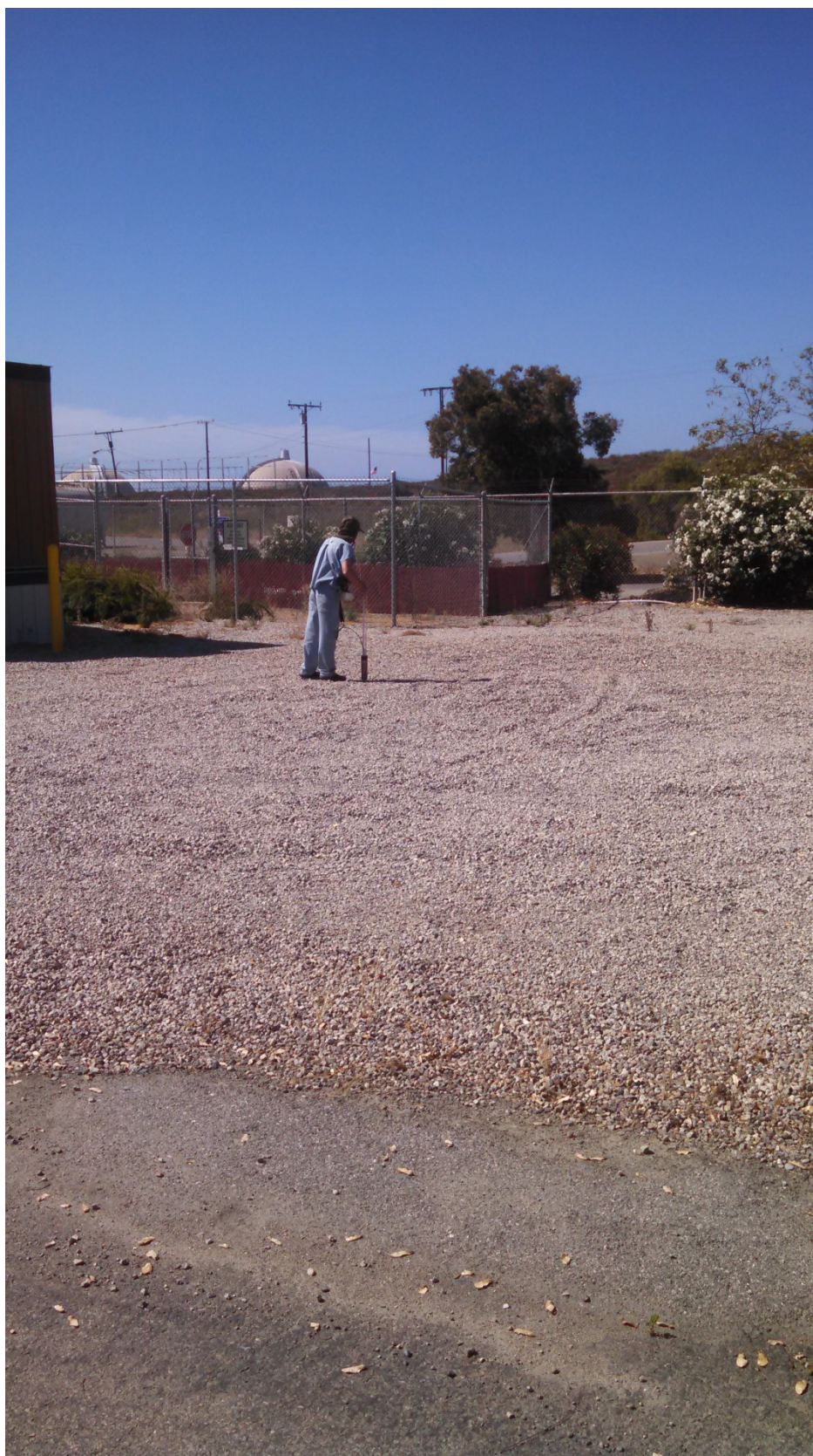
Surface Static Reading