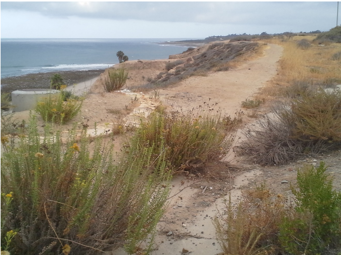
Reference Area 3