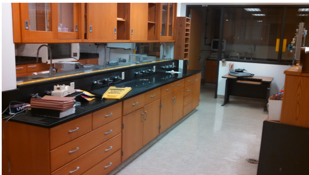
E-50 Chemistry Lab