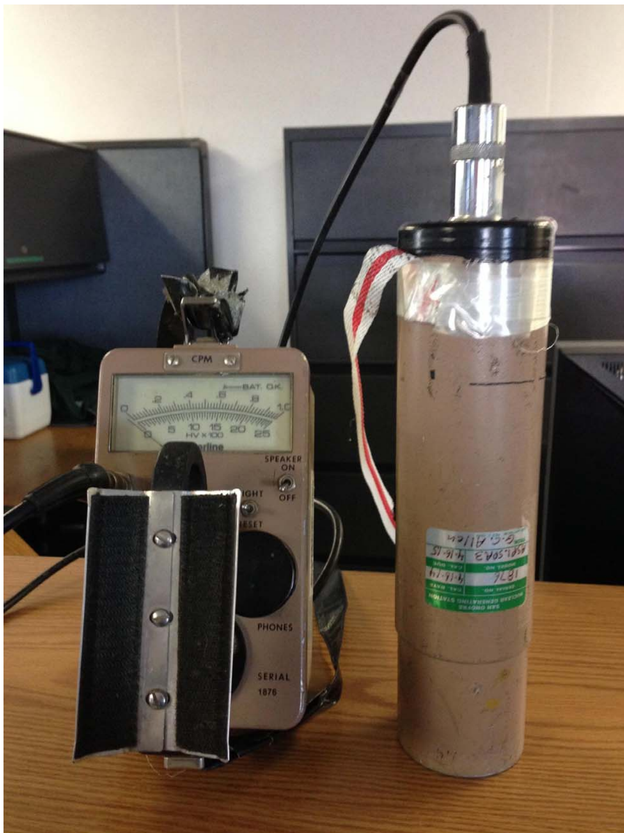
Eberline ASP-1 with SPA-3 Probe