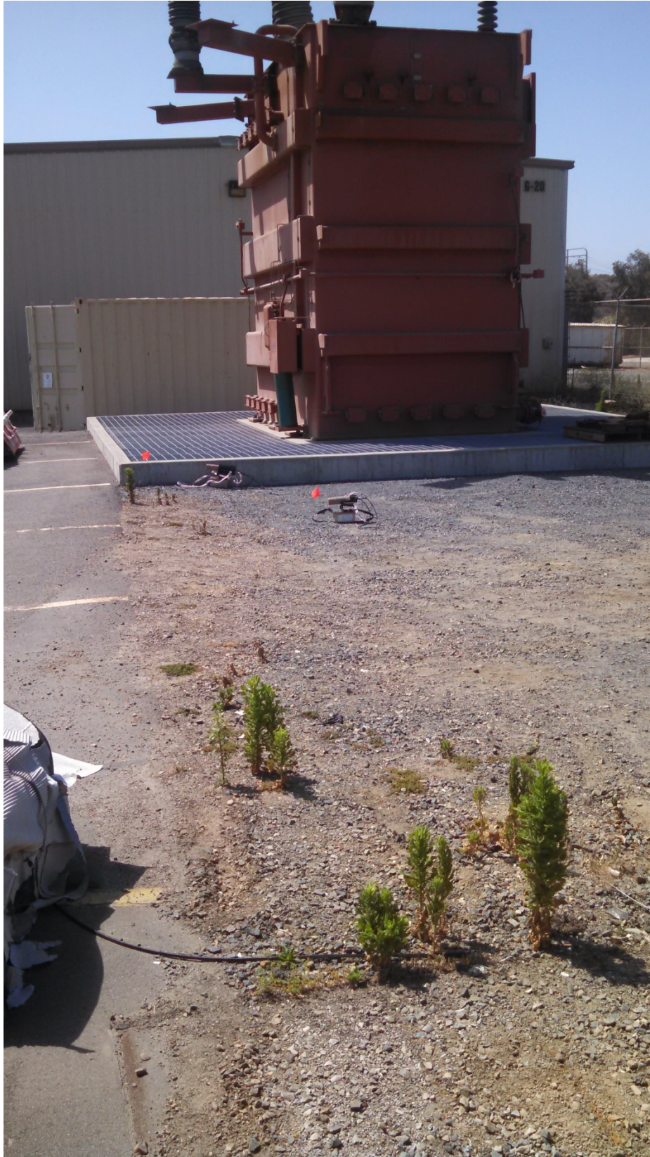
STAR Yard Increased Countrate Area