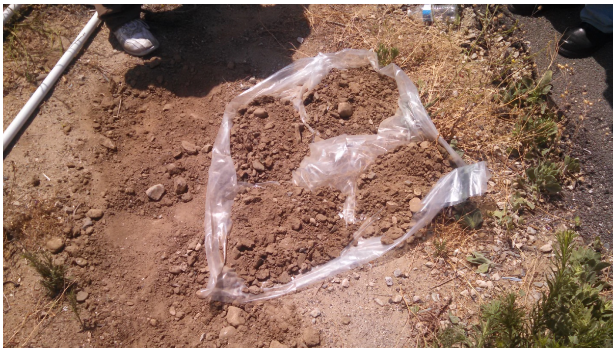
Soil Sample Mixing