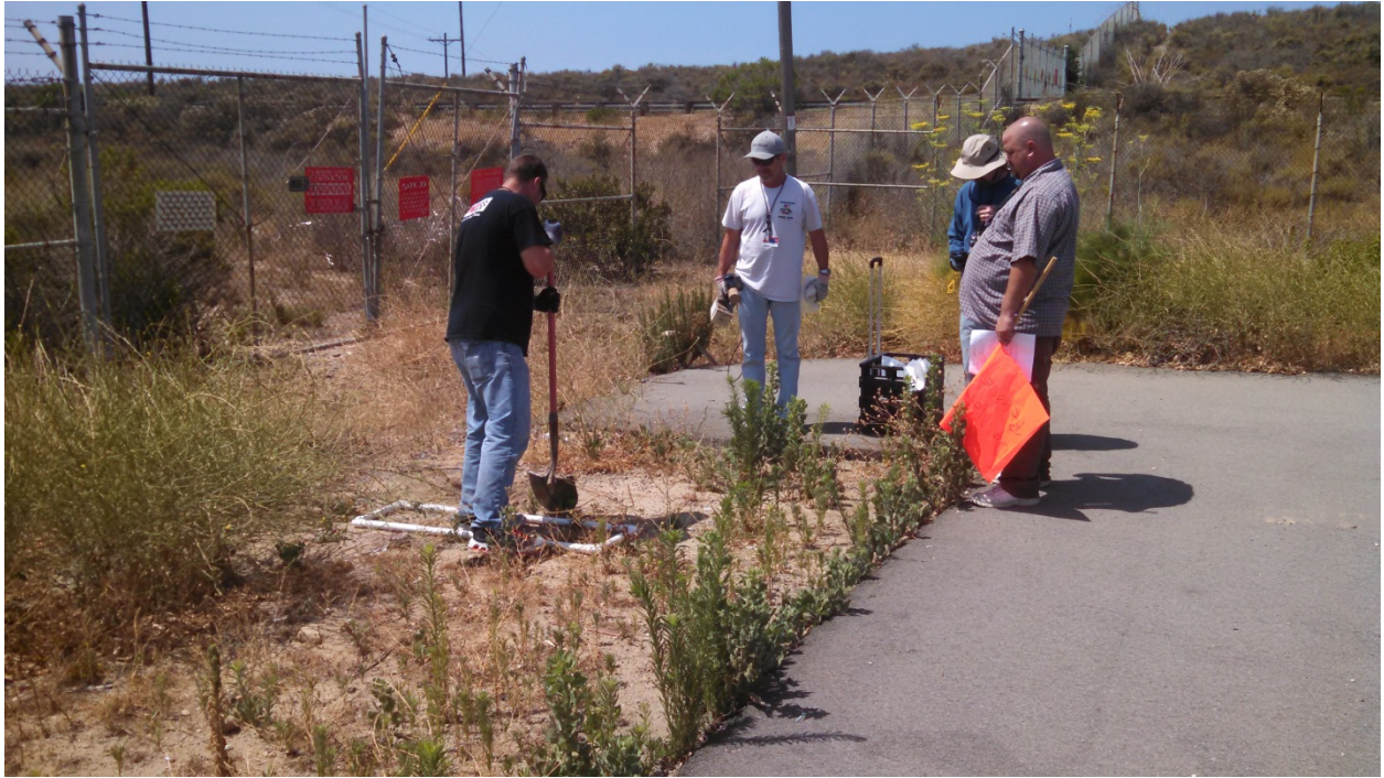
Reference Area 2