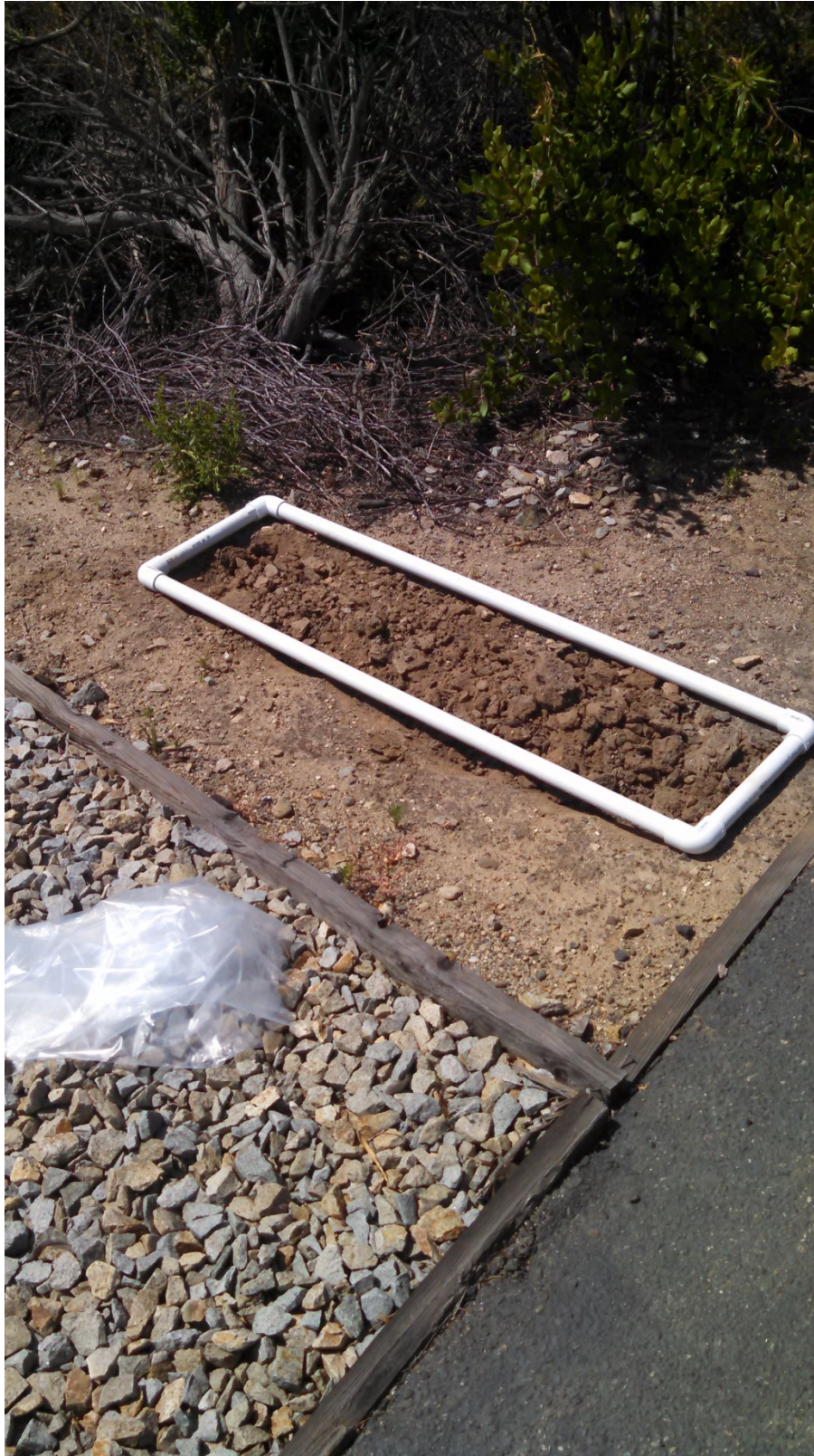
Soil Sampling Jig