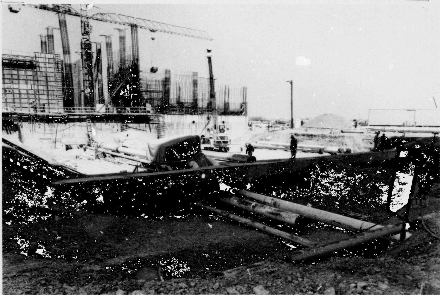
Enrico Fermi #2

Underground Piping--Reactor Building to RHR