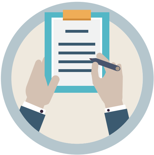
Evaluating How Plants Plan Work With Potentially Significant Radiation Doses