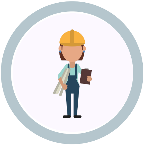
Observation of Radiation Workers

The NRC staff recommended a more efficient use of inspector resources by combining inspections of ALARA (as low as reasonably achievable) programs with other radiation protection inspections. The recommendation would also refocus procedures plant performance outcomes. If approved, the revised approach will focus on three key aspects: