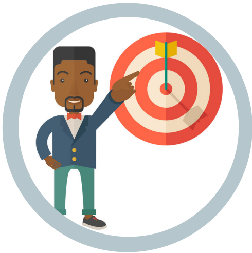
Evaluating How Plants Assess Discrepancies Between Planned And Actual Doses