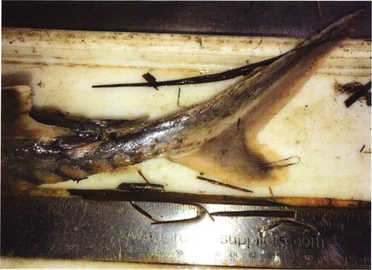
A close-up of the caudal peduncle, showing a minor laceration to the skin, immediately posterior to the dorsal fin (12/30/2019).