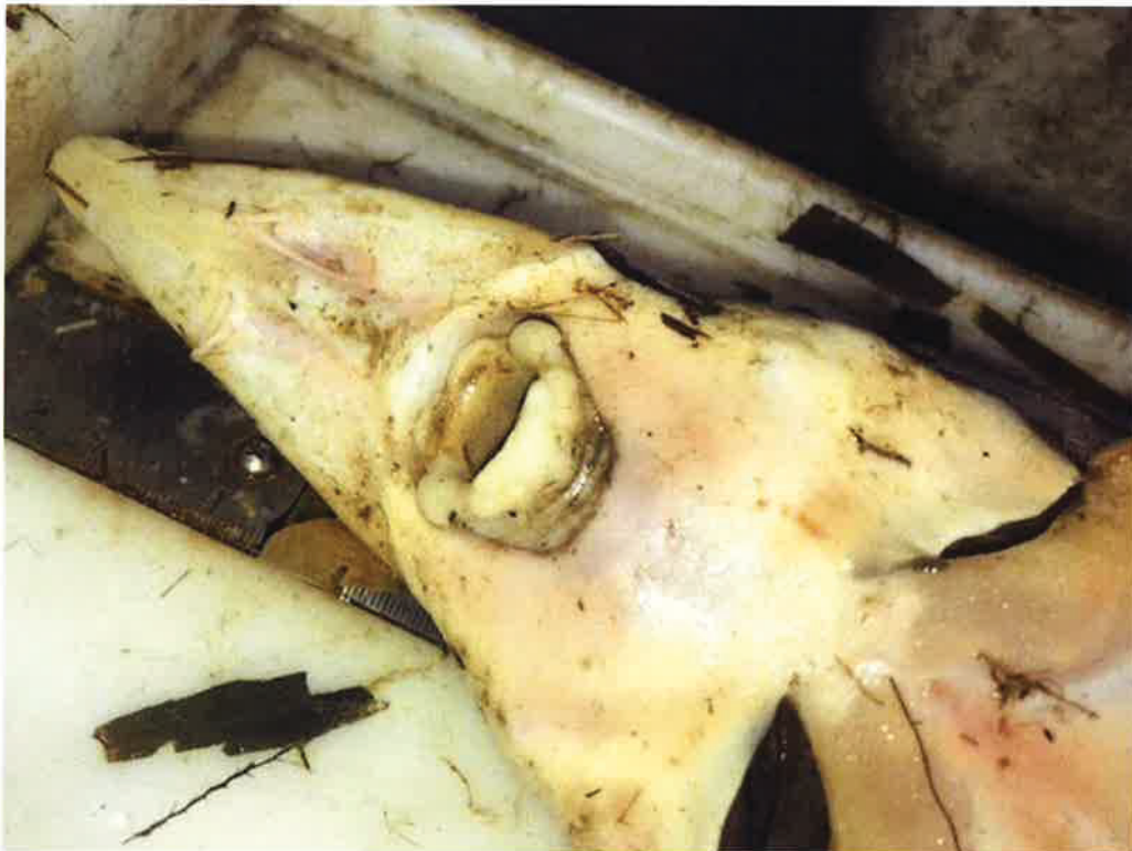
A ventral view of the head, showing a close-up of the characteristic elongated rostrum and small mouth (12/30/2019).