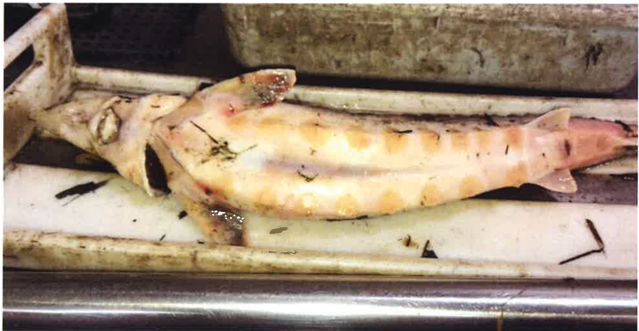
A ventral view of the specimen, showing existing minor bruising at the edges of the pectoral fins and on the ventral portion of the tail (12/30/2019).