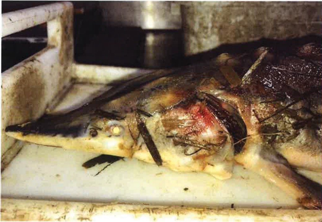
A left, dorsolateral view of the head, showing minor bruising on the operculum. Similar bruising was evident over the dorsal surface of the torso (12/30/2019).