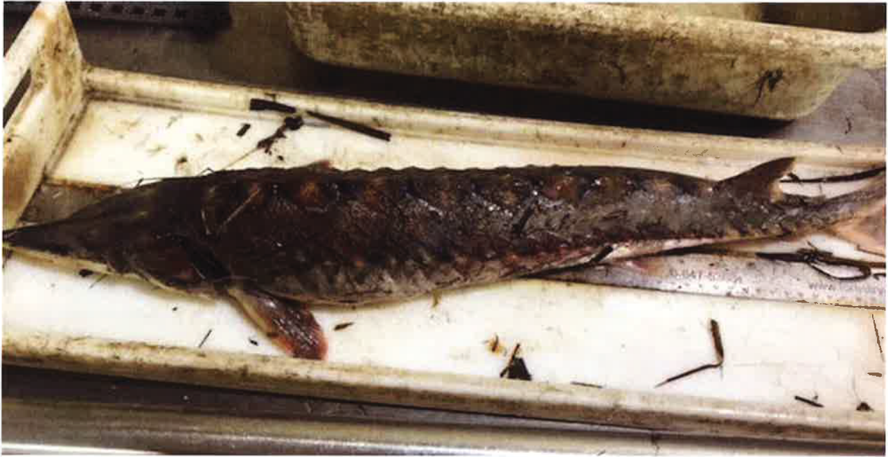
Dorsal view showing the size and condition of the recently deceased Atlantic sturgeon ( Acipenser oxyrinchus ), retrieved at 10:18am on 12/30/19 from 11B circulator intake by Salem Yard Crew personnel during routine trash rack cleaning at Salem Nuclear Generating Station (12/30/2019).