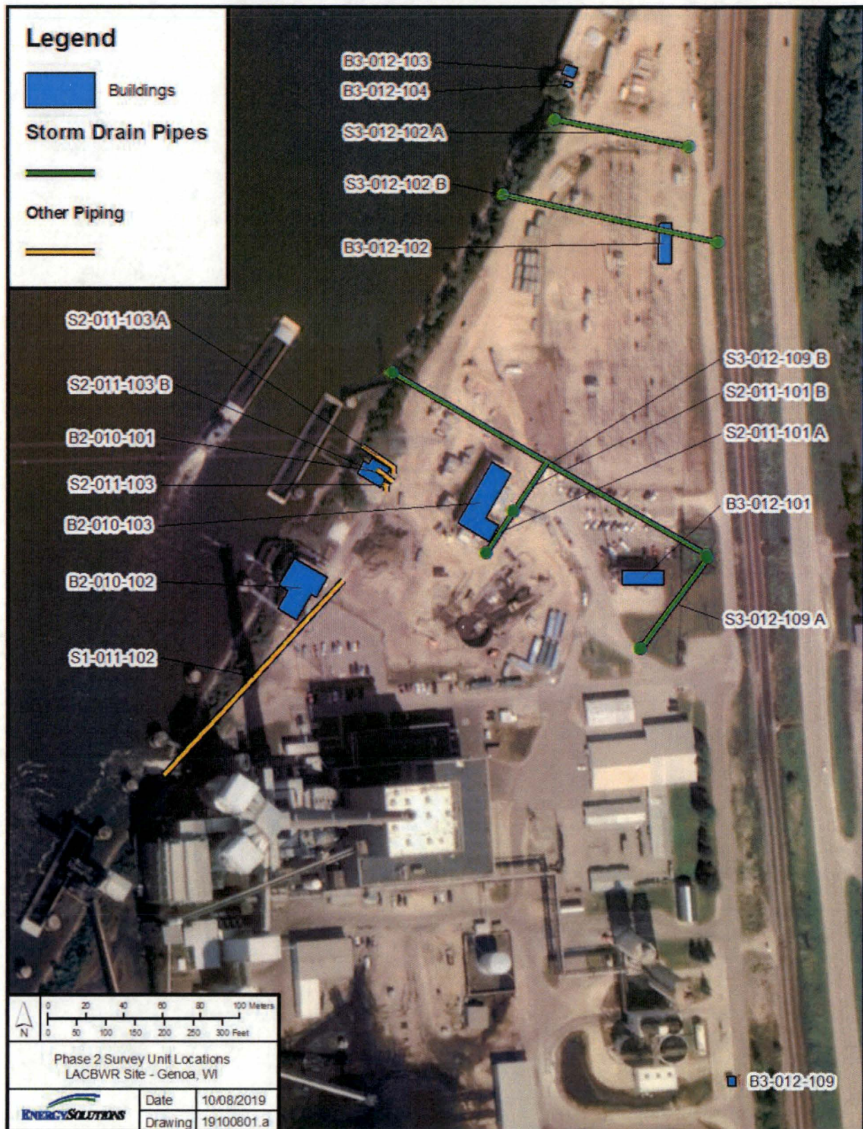
Figure 1-1 Phase 2 Survey Unit Locations