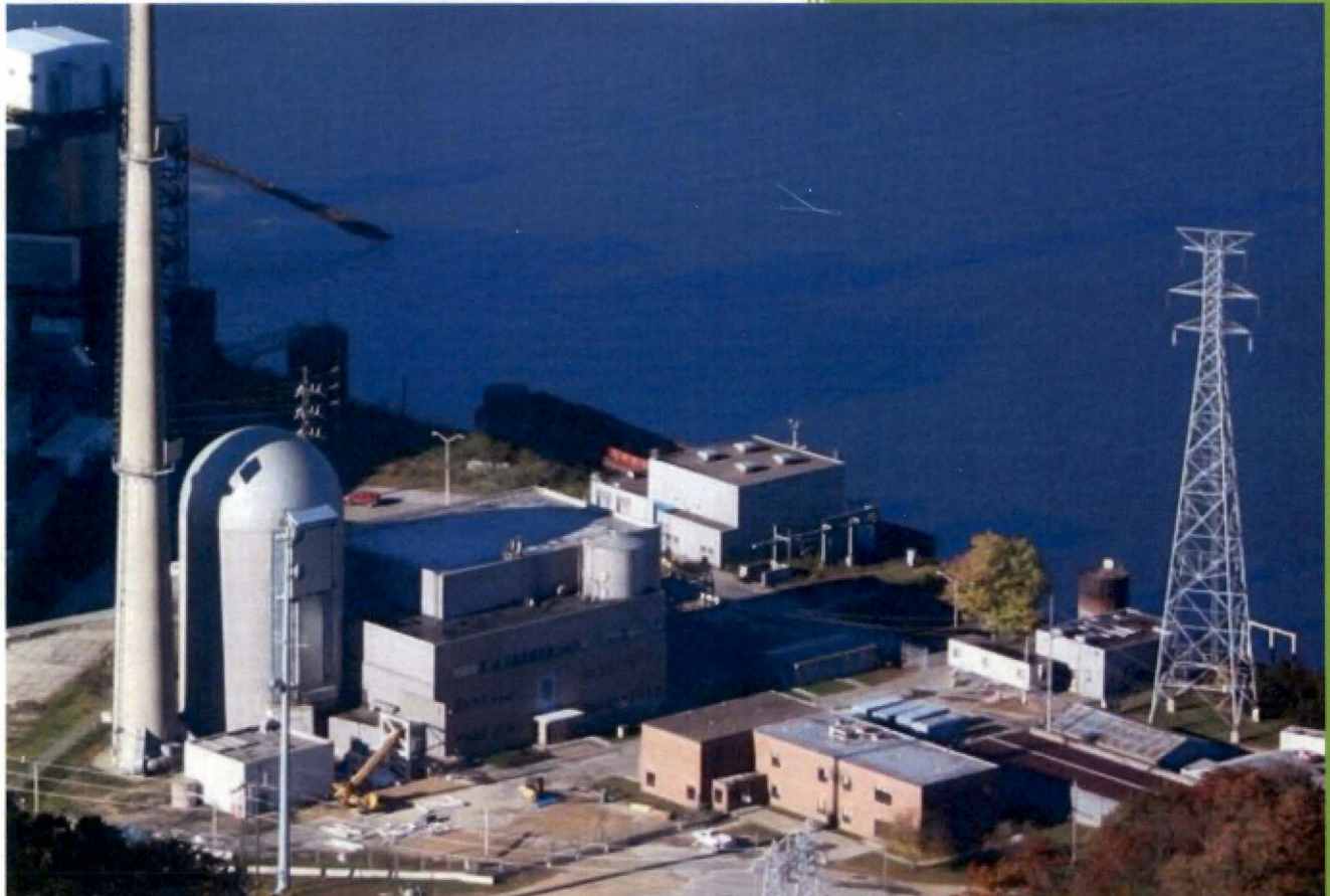
Lacrosse Boiling Water Reactor