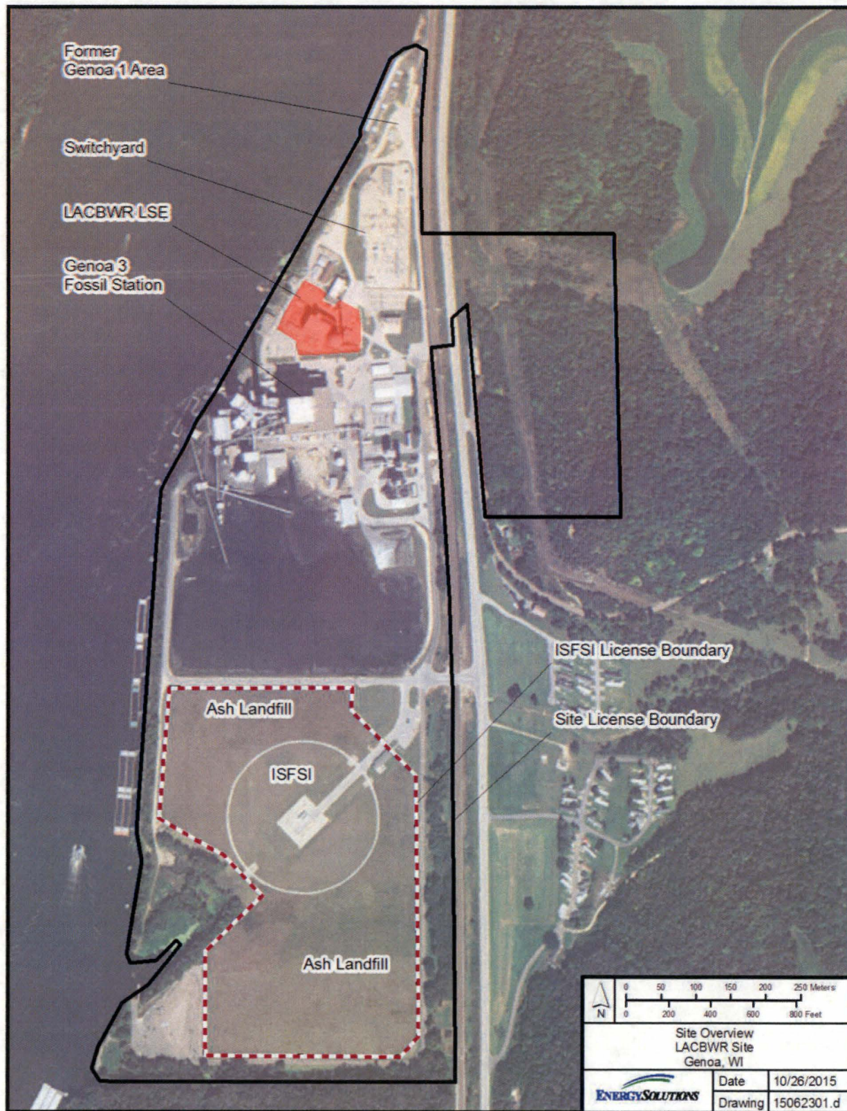
Figure 3-2 Site Overview