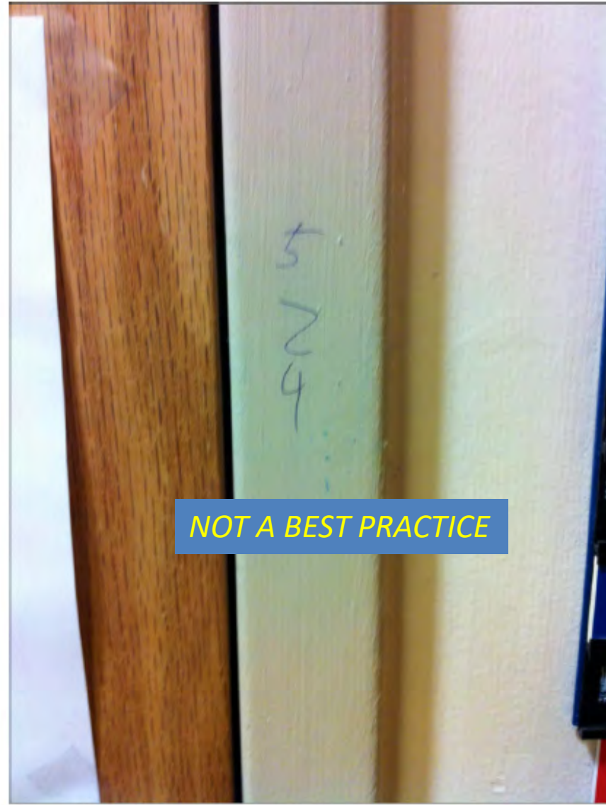
Figure 3: Combination to Lock on Door Frame Outside Blood Bank