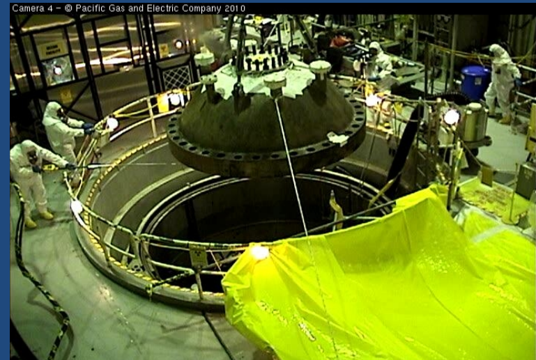
Camera 4 - © Pacific Gas and Electric Company 2010