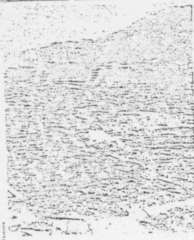
Nagasaki: cancer rates among survivors are unreliable

that there is no radiation risk at low doses. If the proponents of nuclear energy had been more reasonable in their claims about radiation safety, they would not now be trying desperately to save face.