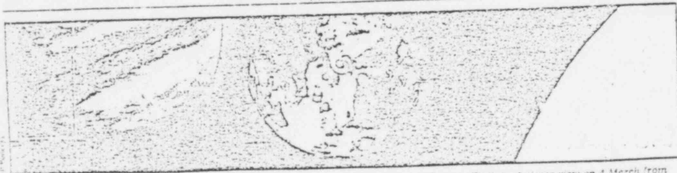
A sequence of views of the moon Io: Left Io (about the size of Earth's Moon) passing the Great Red Spot on 13 February, when Voyager 1 was 20 million km distant. The other moon

The latest spacecraft to visit the Jovian system has discovered features as diverse as volcanoes on one moon and ripples of ice on another