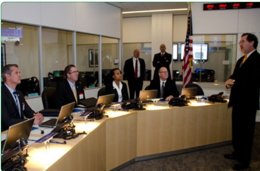
Europol officials are accompanied by NRC officials briefed regarding NRC emergency preparedness and incident response topics, in the agency's Headquarters Operations Center, during their visit to discuss building a multilateral partnership. Europol is the European policing authority that assists the members of the European Union, other countries, and international organizations in combating crime and terrorism.