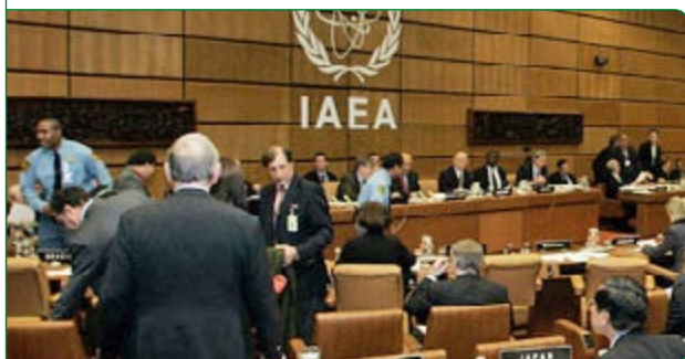
The NRC participates in the annual General Conference for the International Atomic Energy Agency in Vienna, Austria.