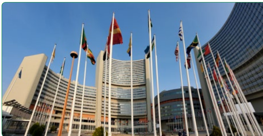
The United Nations office in Vienna, Austria, site of the International Atomic Energy Agency.

See Appendices X, Y, and Z for lists of international activities.