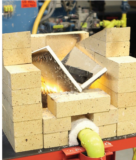
Figure 4: After 57 minutes, the USG Sheetrock® Brand Firecode® X Gypsum Panel collapsed due to the thermal exposure and the superimposed load.

In Figure 4, the test has been in progress for 57 minutes, and the USG Sheetrock® Brand Firecode® X Gypsum Panel has collapsed due to the thermal exposure and the superimposed load. The glass fibers in the Type X panel have given it the strength to last nearly one hour under these severe conditions. In Figure 5, the test has been terminated at two hours two minutes with no sign of failure of the USG Sheetrock® Brand Firecode® C Gypsum Panel. The Type C panel resisted failure for over twice as long as the Type X panel.