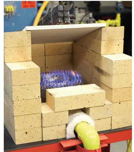
Figure 3: 13" x 13" sample of USG Sheetrock® Brand Firecode® C Gypsum Panel with a 16 lb. 13 oz. weight located in the center to dramatize the failure point.