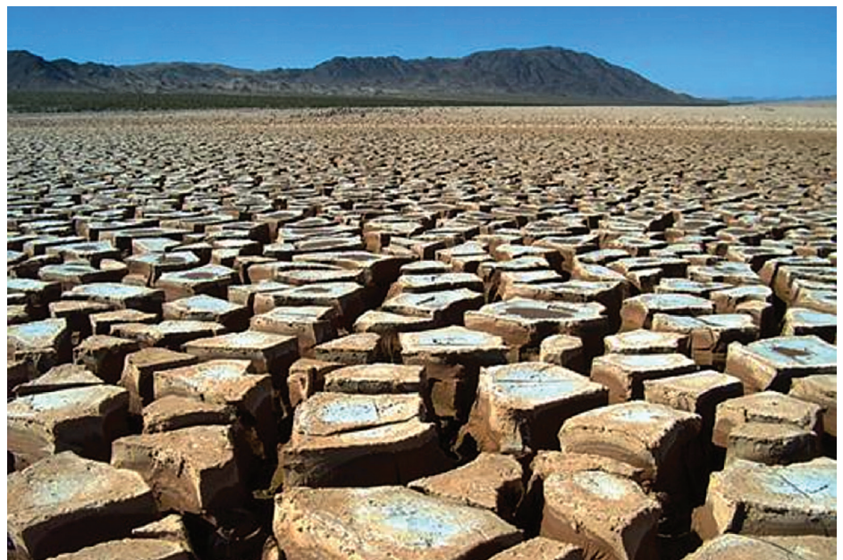
Figure 1: Dry lake bed, Mojave Desert, Weather Underground wunderground.com

In the case of regular gypsum board, as the crystalline water is driven off, the reduction of volume within the gypsum core causes large cracks to form, eventually causing the panel to fail due to structural integrity. This is similar to the cracking that can be observed in a dry lake or river bed as shown in Figure 1. If such large cracks are permitted to form in the gypsum board, the board will quickly be breached by the fire's hot gases passing through the cracks.