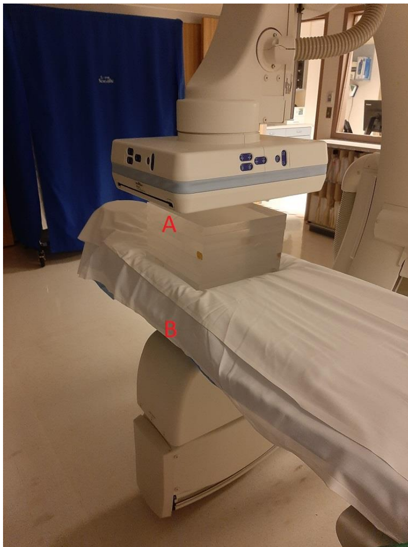
Figure 4 – CT Scanner Scatter Measurement Set-Up

A – Scatter measurements made at the collar position