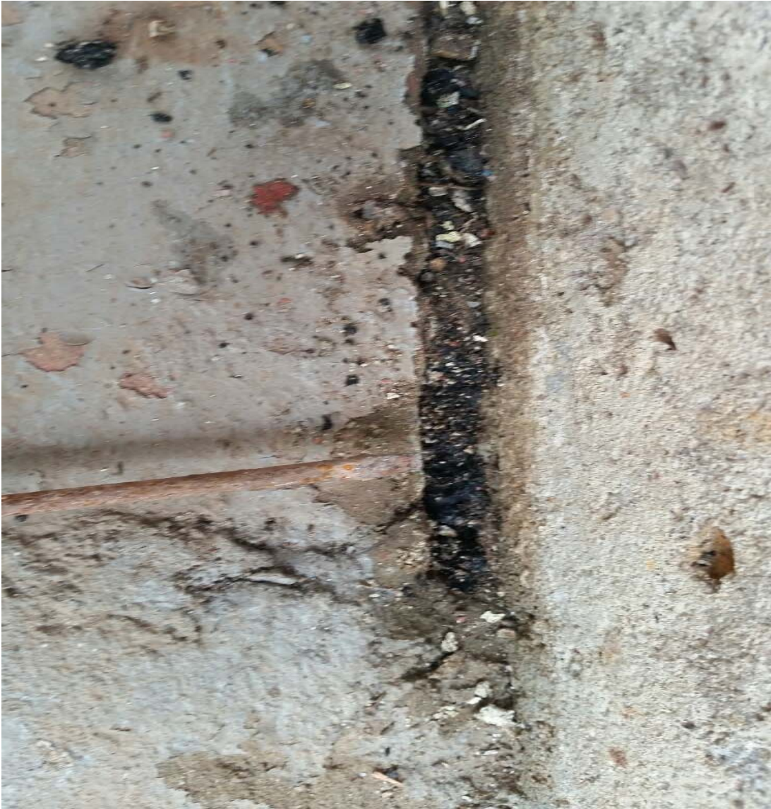
Area in 3H where the section of caulk was found.