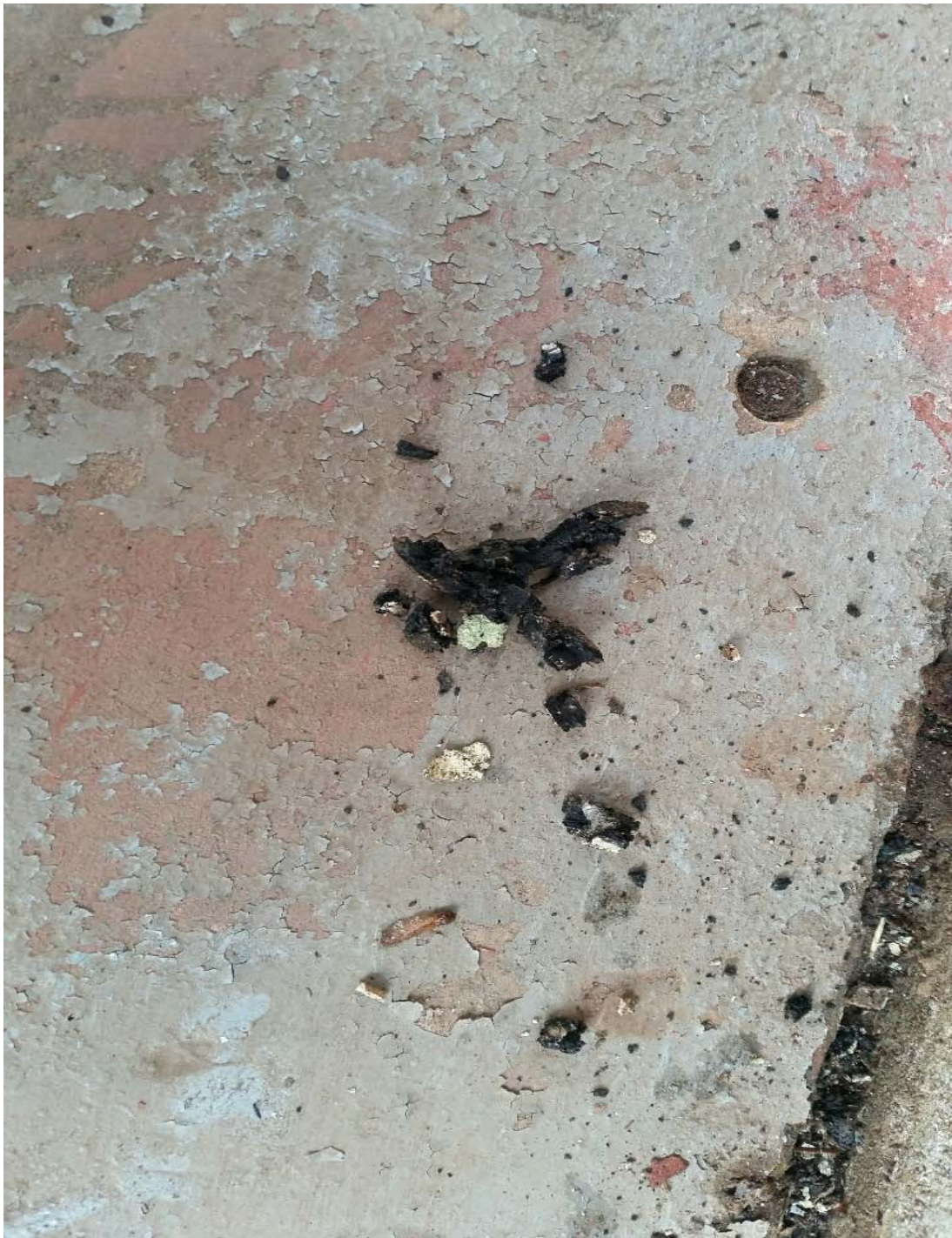
The caulk that was removed and held all the items.