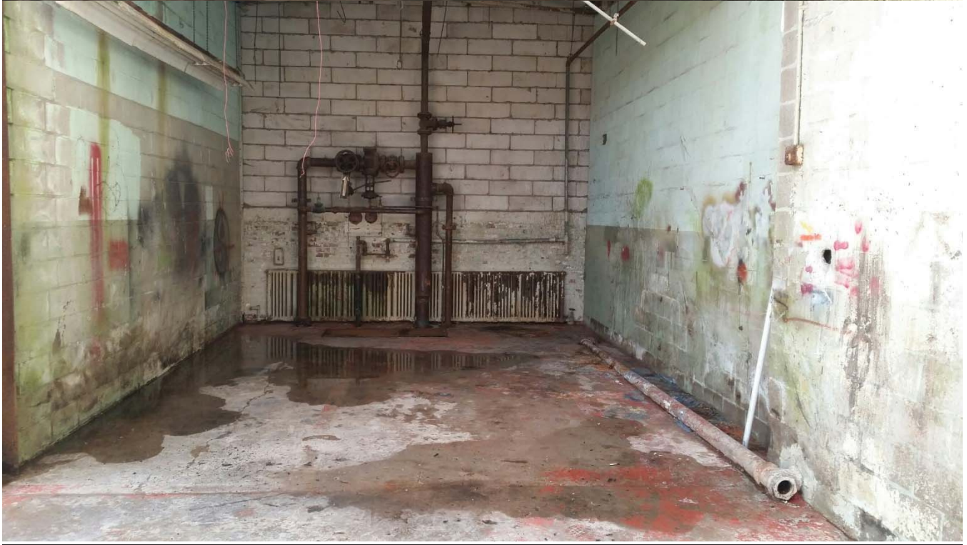
Before and after abatement on the eastern wing of 3H.