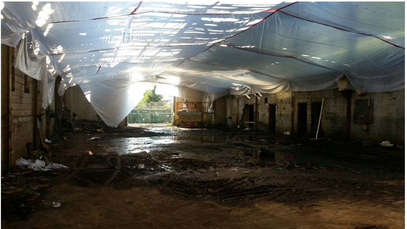
Workers continue to setup containment #8 in the eastern part of building 3H.