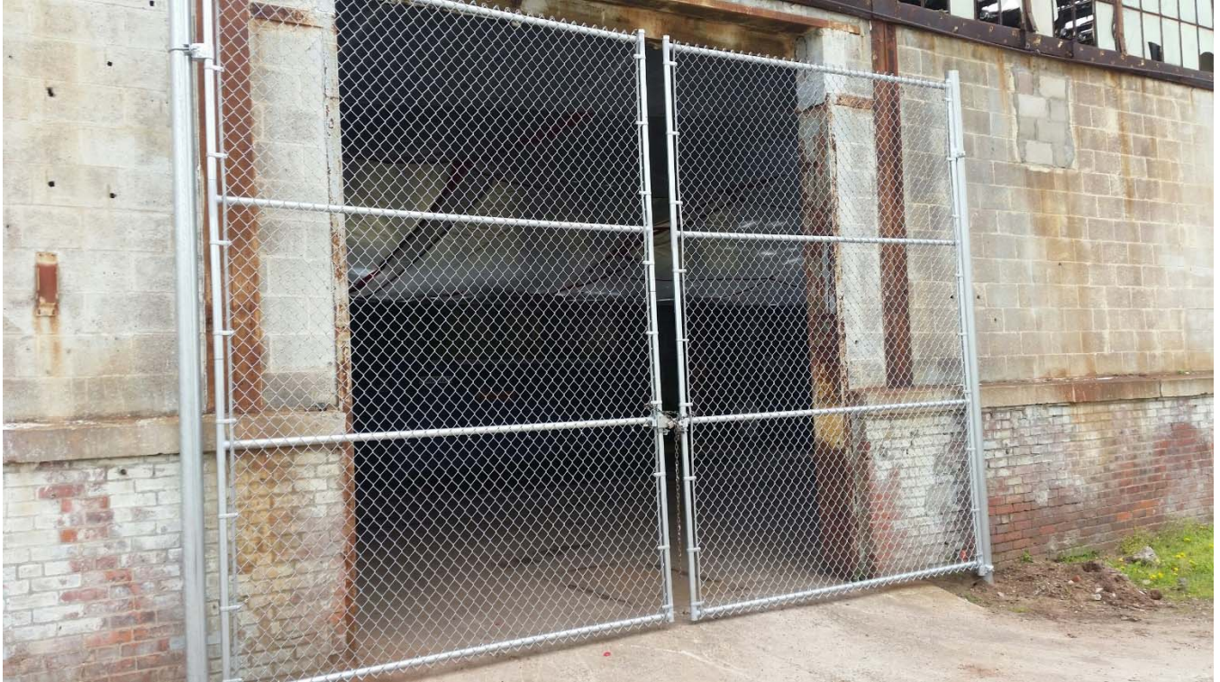
Completed gate for 6H.