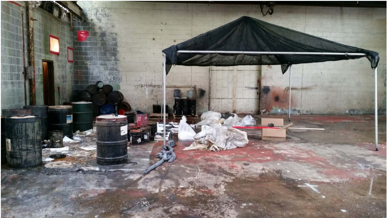
Brightfields utilizing the mobile overhead debris catcher for drum consolidation and overpacking.