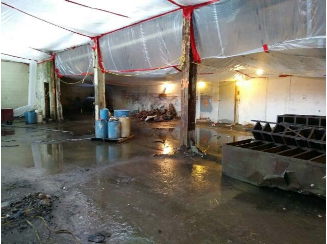
3H containment 3 during abatement