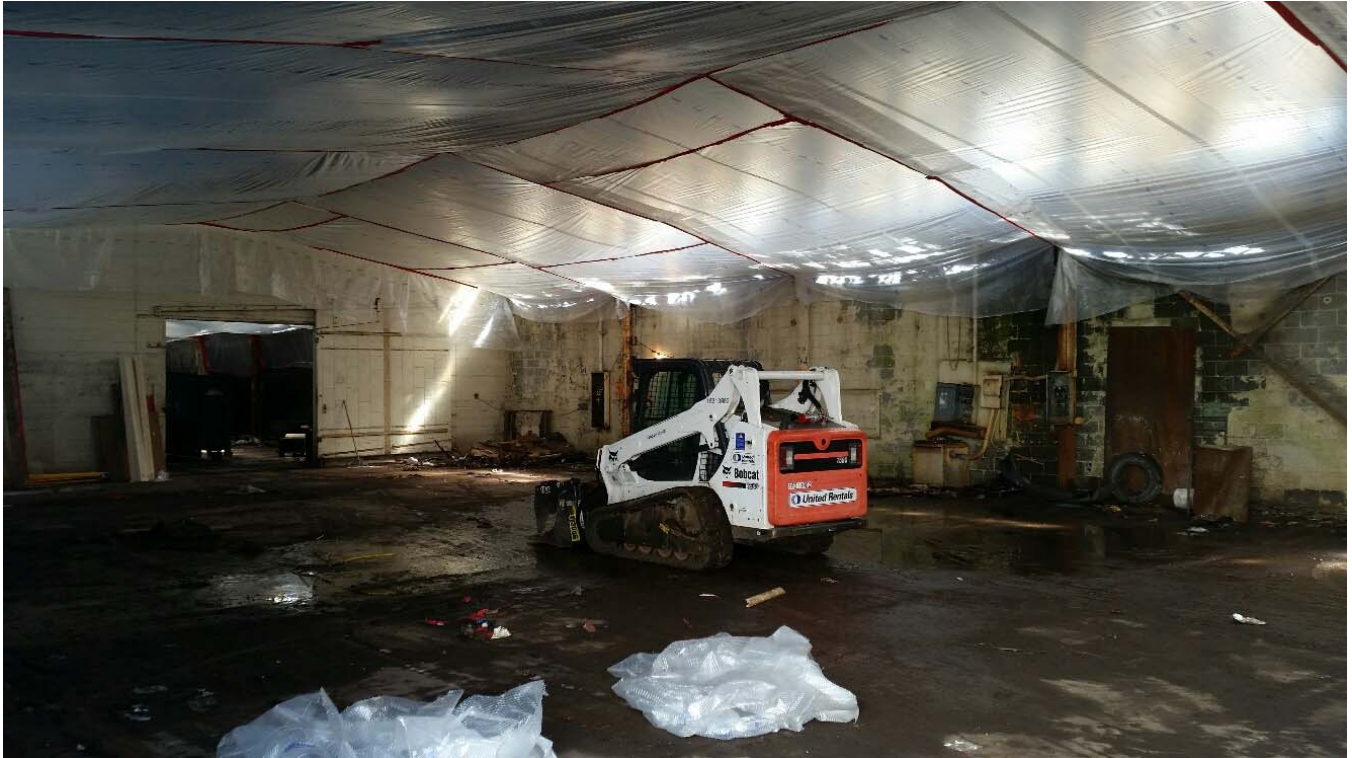
Containment 6 being constructed.