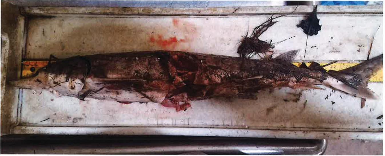
A dorsolateral view showing the size and condition of the deceased, Atlantic Sturgeon ( Acipenser oxyrinchus ), retrieved at 14:25pm on 02/19/19 from 22B circulator intake bay by Salem Yard Crew personnel during routine trash rack cleaning at Salem Nuclear Generating Station (02/19/2019).