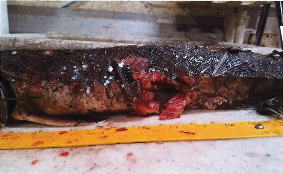
Dorsolateral view of the right side, showing detail of the observed damage (02/19/2019).