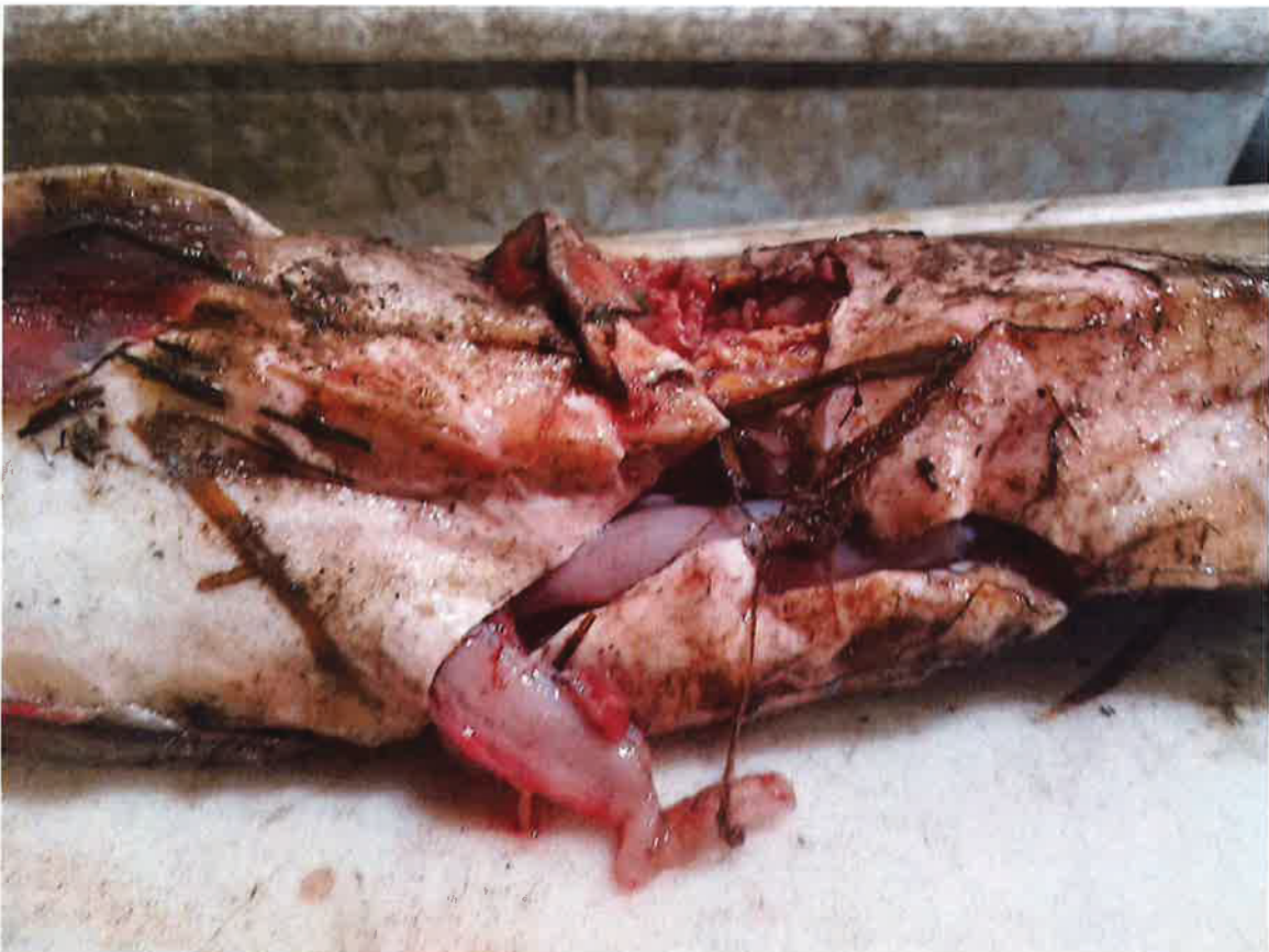
Ventral view of the carcass, showing additional detail of the observed damage (02/19/2019).