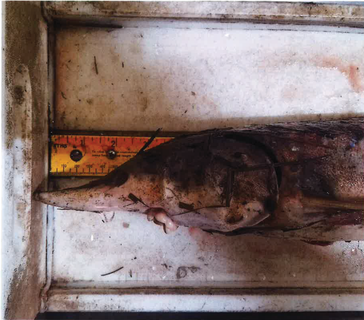
A dorsolateral view of the head, showing the characteristic elongated rostrum (02/19/2019).