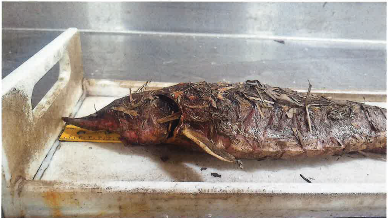
Another dorsolateral view of the specimen, showing a close up of the head and torso (02/15/2019).