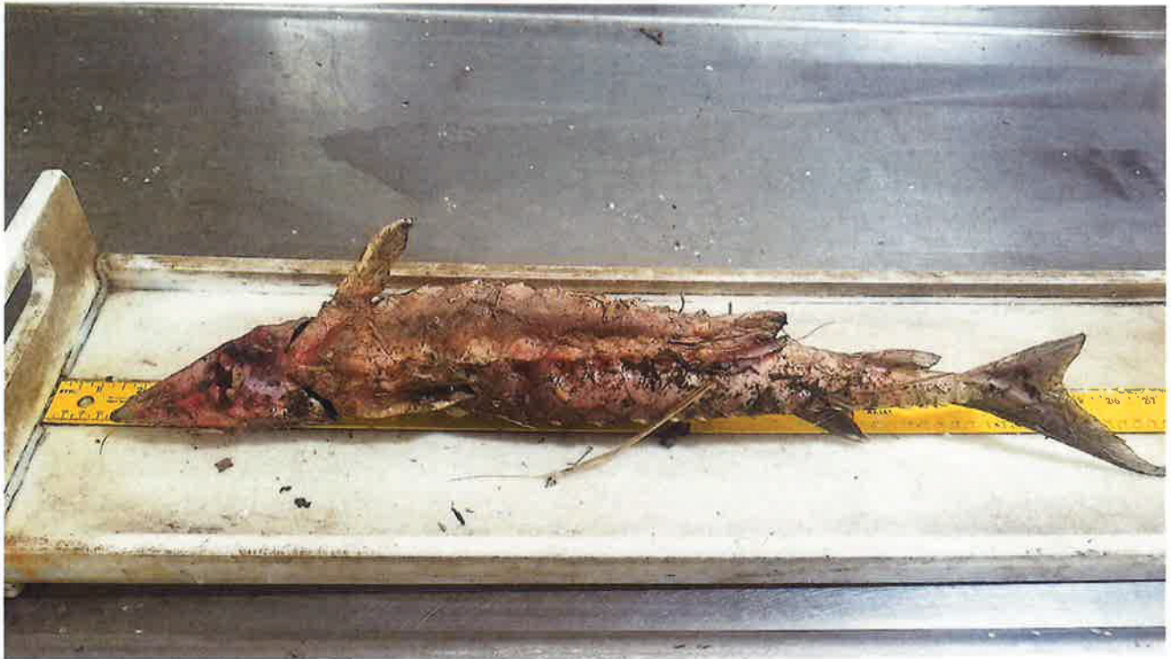
A ventral view of the carcass. The specimen was found to lack any evidence of external damage but was observed to be dried out (02/15/2019).