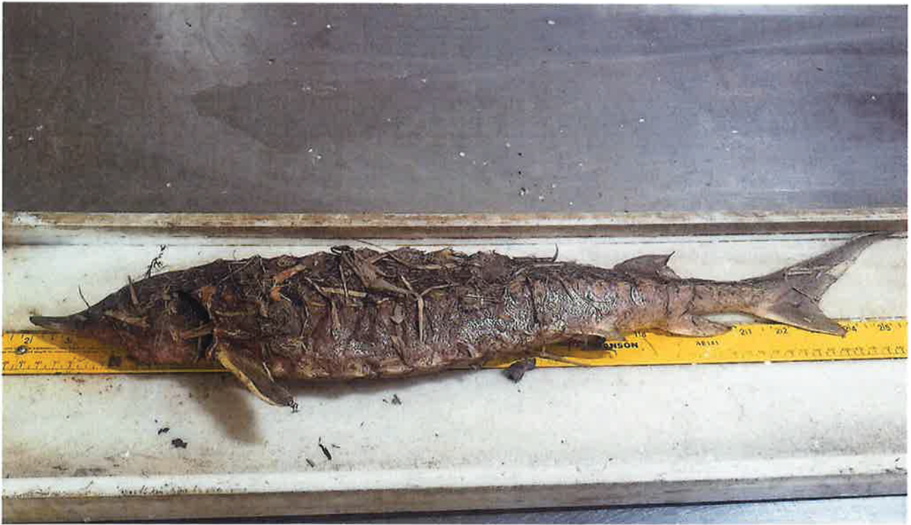
A dorsolateral view showing the size and condition of the deceased, Atlantic Sturgeon ( Acipenser oxyrinchus ), retrieved at 10:30am on 02/14/19 from the Unit 1 Circulating Water Intake trash basket by Operations personnel at Salem Nuclear Generating Station (02/15/2019).