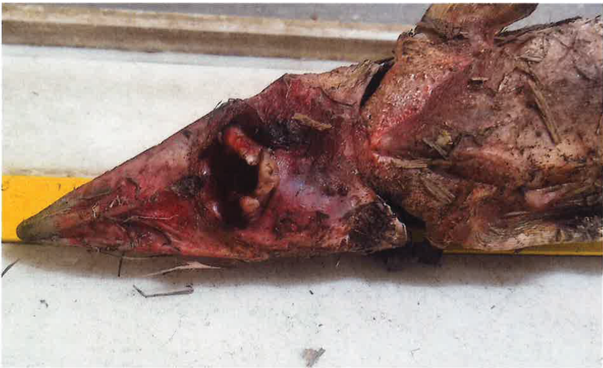
A ventral view of the head, showing the characteristic small mouth (02/15/2019).