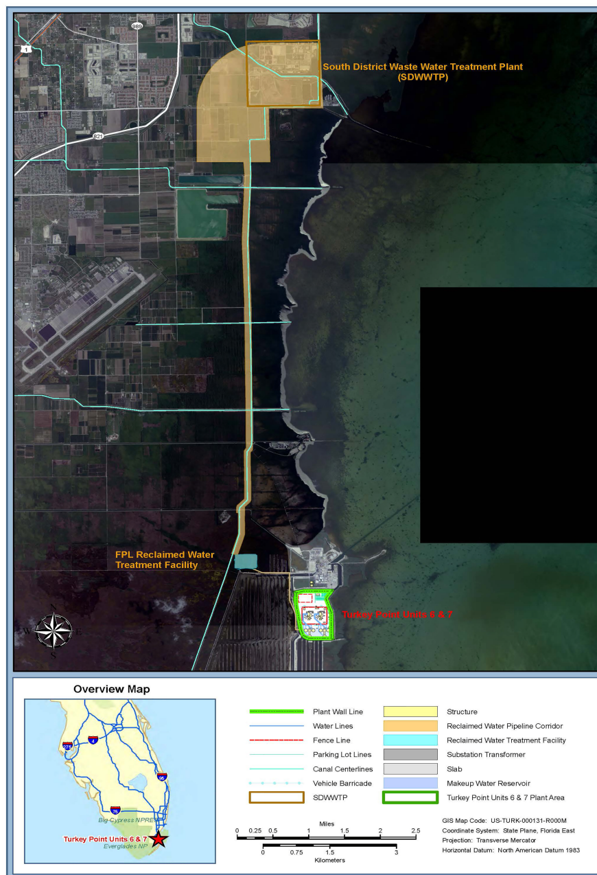
Figure 2.4.11-201 Location of Reclaimed Water Source and Pipeline Route