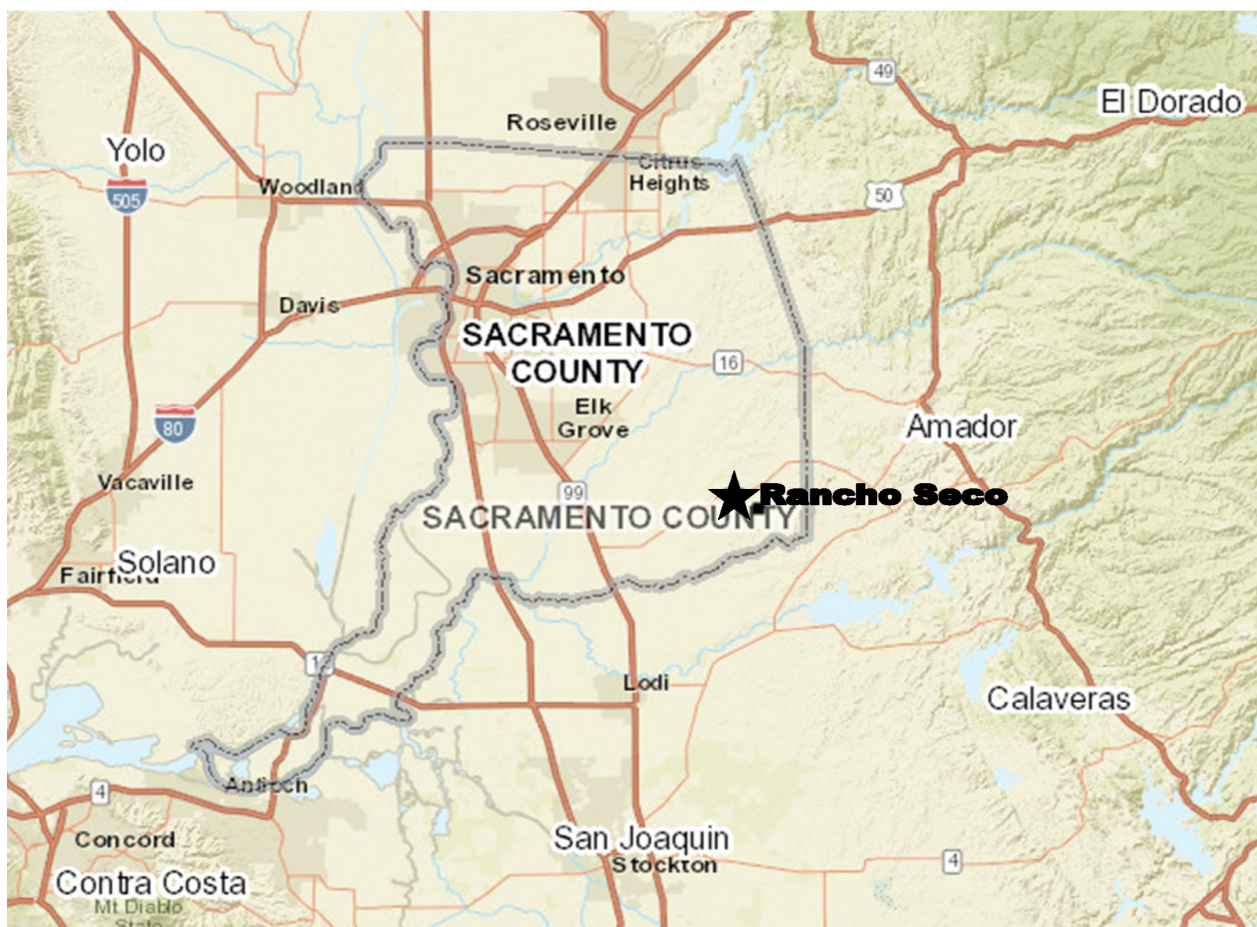
Rancho Seco General Site Location