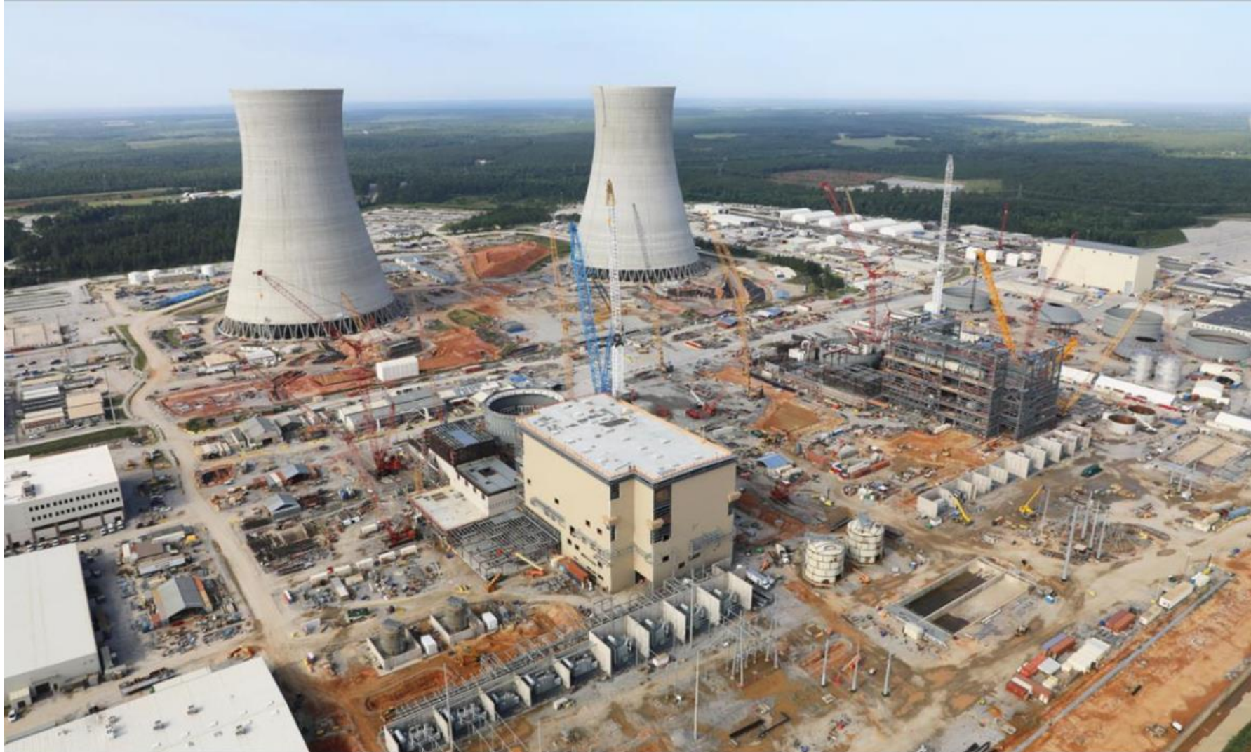
Vogtle Units 3&4