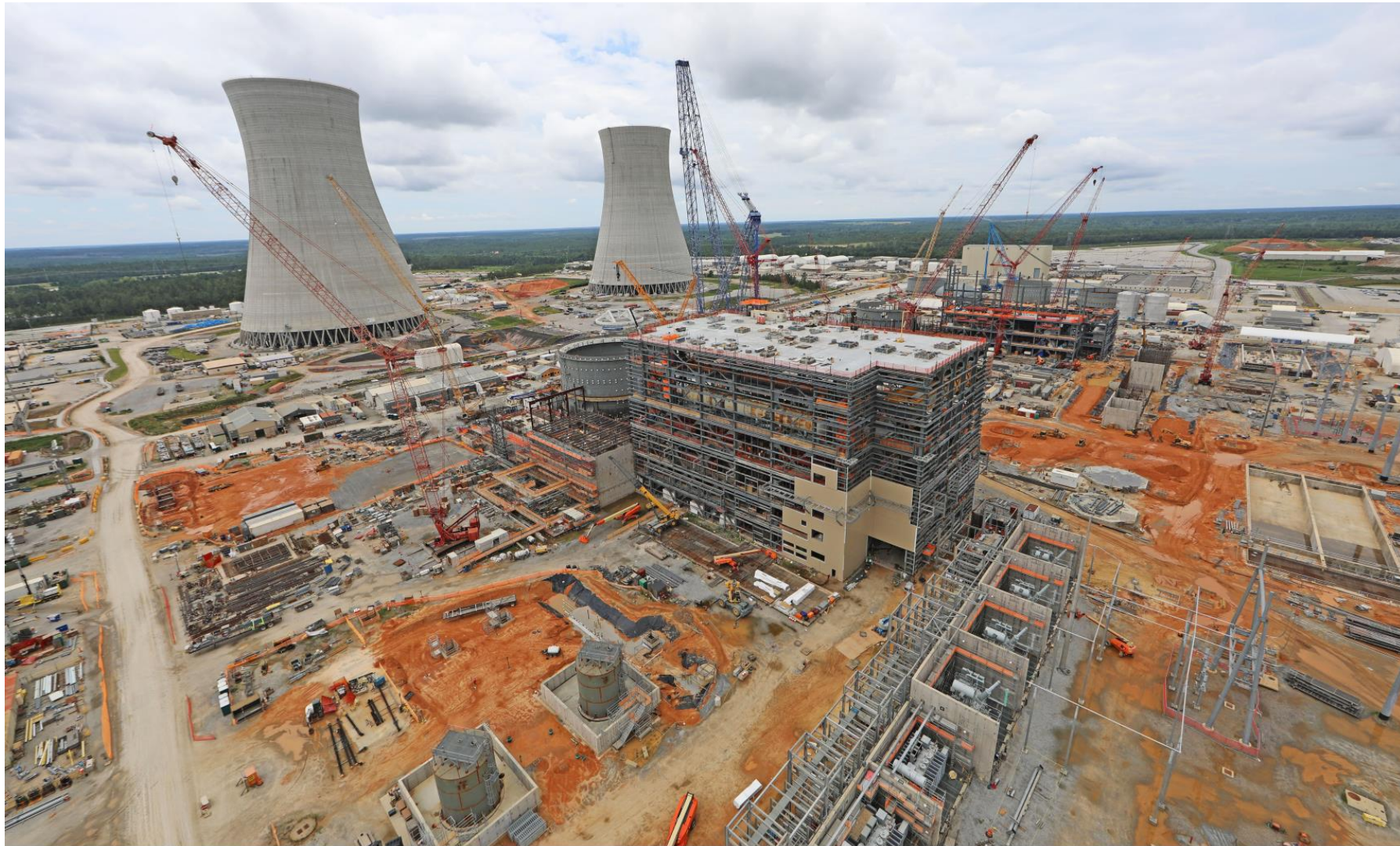
Vogtle 3 and 4 construction site.