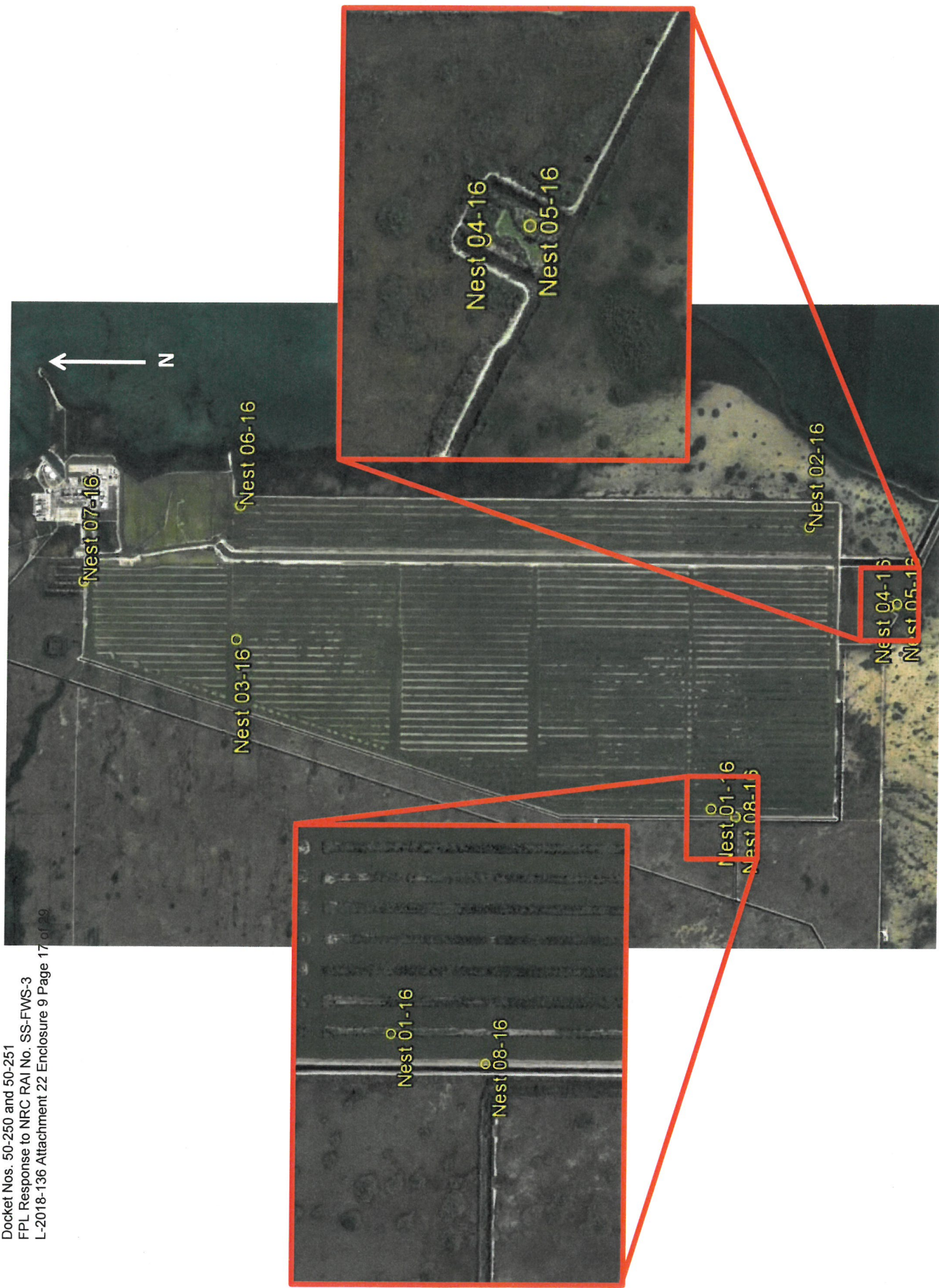
Figure 2. 2016 Nest Locations at Turkey Point