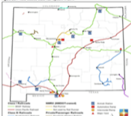
Figure 6B-1 New Mexico State Rail System in 2014

More than 10,000 rail cars of this risky waste would rumble on New Mexico rails, in a process that would take 20 years, likely traveling rail lines along I-10, I-40, and I-25 to Clovis and thus Carlsbad and across Texas on the routes running along I-10, I-20, I-30, I-35 and I-27