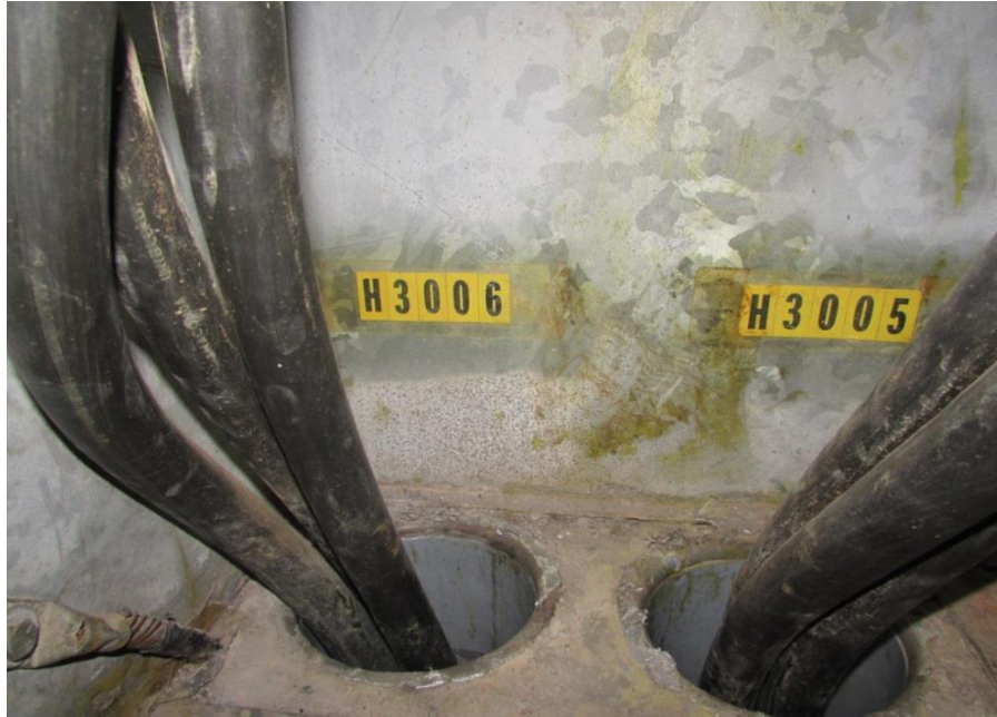
“As-found” (top) and “As-left” (bottom) condition of embedded 6.9kV conduits which penetrate the Turbine and Auxiliary Building at ANO-1. Some of the penetrations are in floors or walls that are flood boundaries.