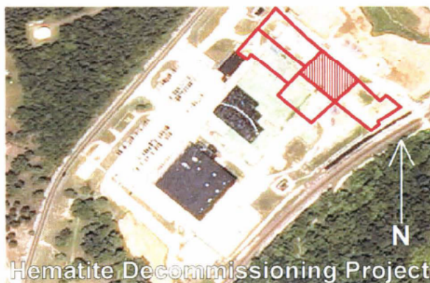
HDP Satellite Site View: Area 3 in Red Outline LSA 08-09 in Red Crosshatching

LSA 08-09 is designated Class 1 and is located in the Central Open Land Area and includes the area between LSA 08-05 and 08-14. This SU is located within the Technetium Surrogate Evaluation Area (SEA); therefore the Tc-99 SEA DCGLs were used only for Scan MDC calculations where the inferred Tc-99 DCGL for U-235 is 1.2 pCi/g. The surrogate DCGL for U-235 was used for the calculation of Scan MDC only. Laboratory analysis for Tc-99 will be performed on all final status survey samples and as such, the adjusted U-235 DCGL values will not be used to demonstrate compliance with the final status survey dose criteria. The two-dimensional areal extent of LSA 08-09 is 1,542 m 2 upon which the systematic sampling grid is based. The interior surface area (three-dimensional) of Survey Unit LSA 08-09 is 1,581 m 2 .